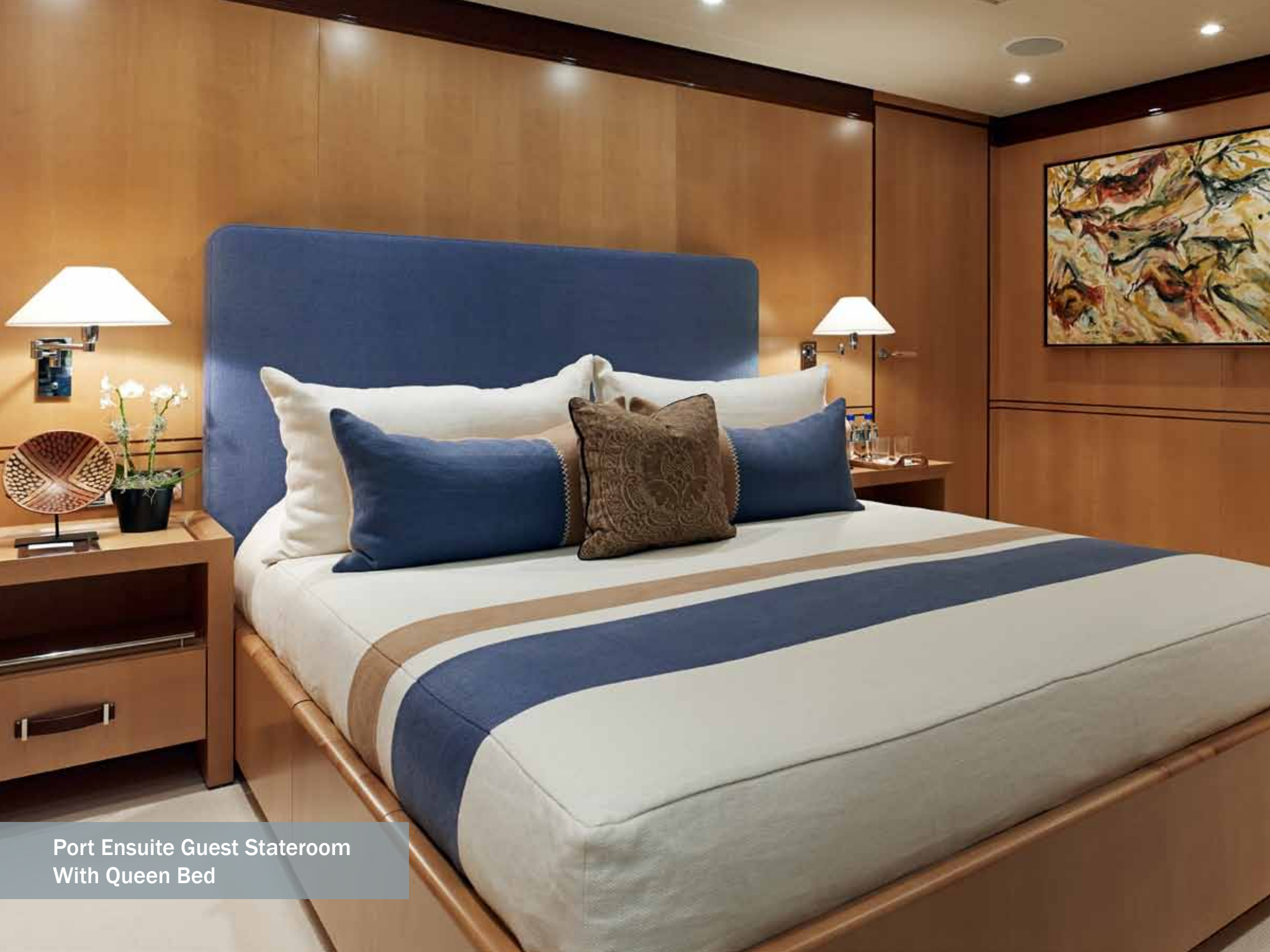
Port Ensuite Guest Stateroom With Queen Bed