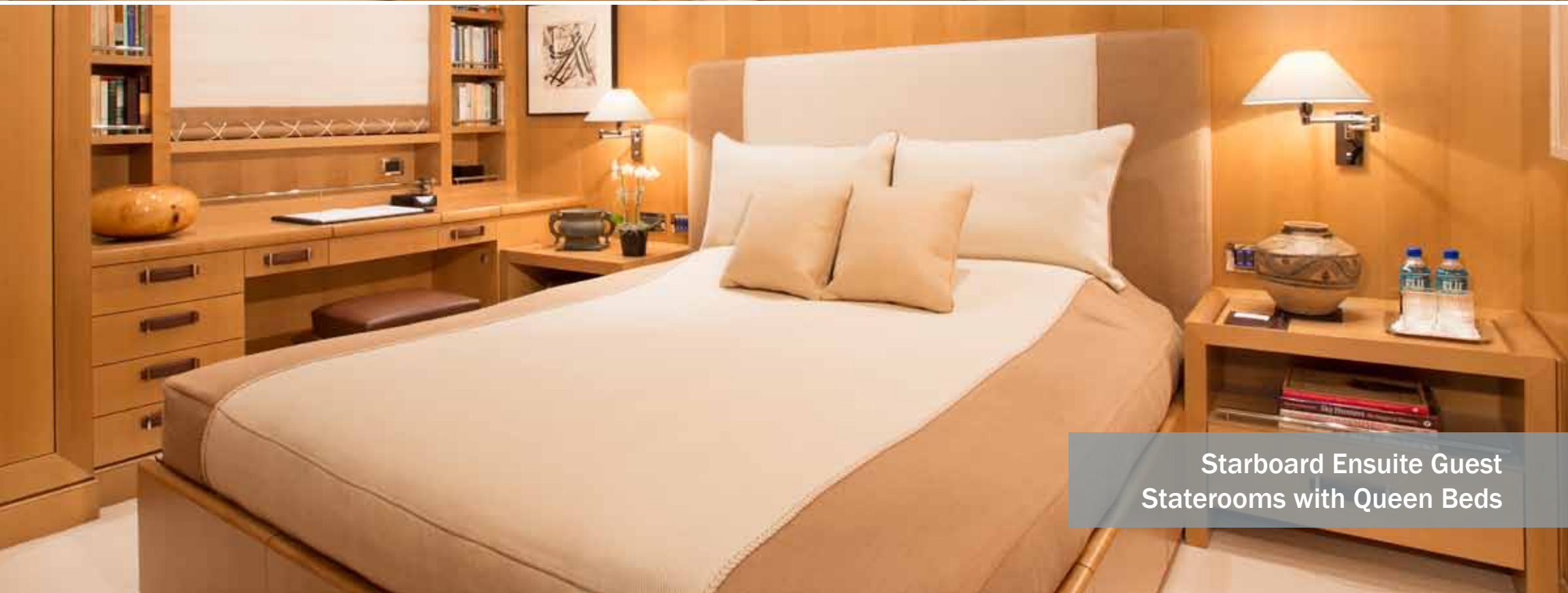
Starboard Ensuite Guest Staterooms with Queen Beds