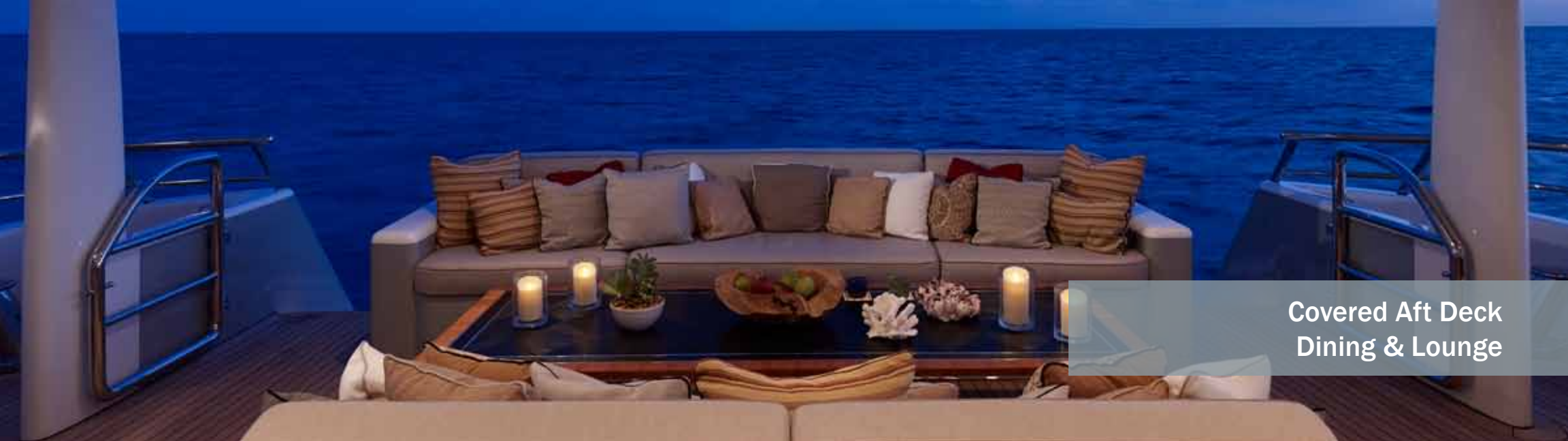
Covered Aft Deck Dining & Lounge