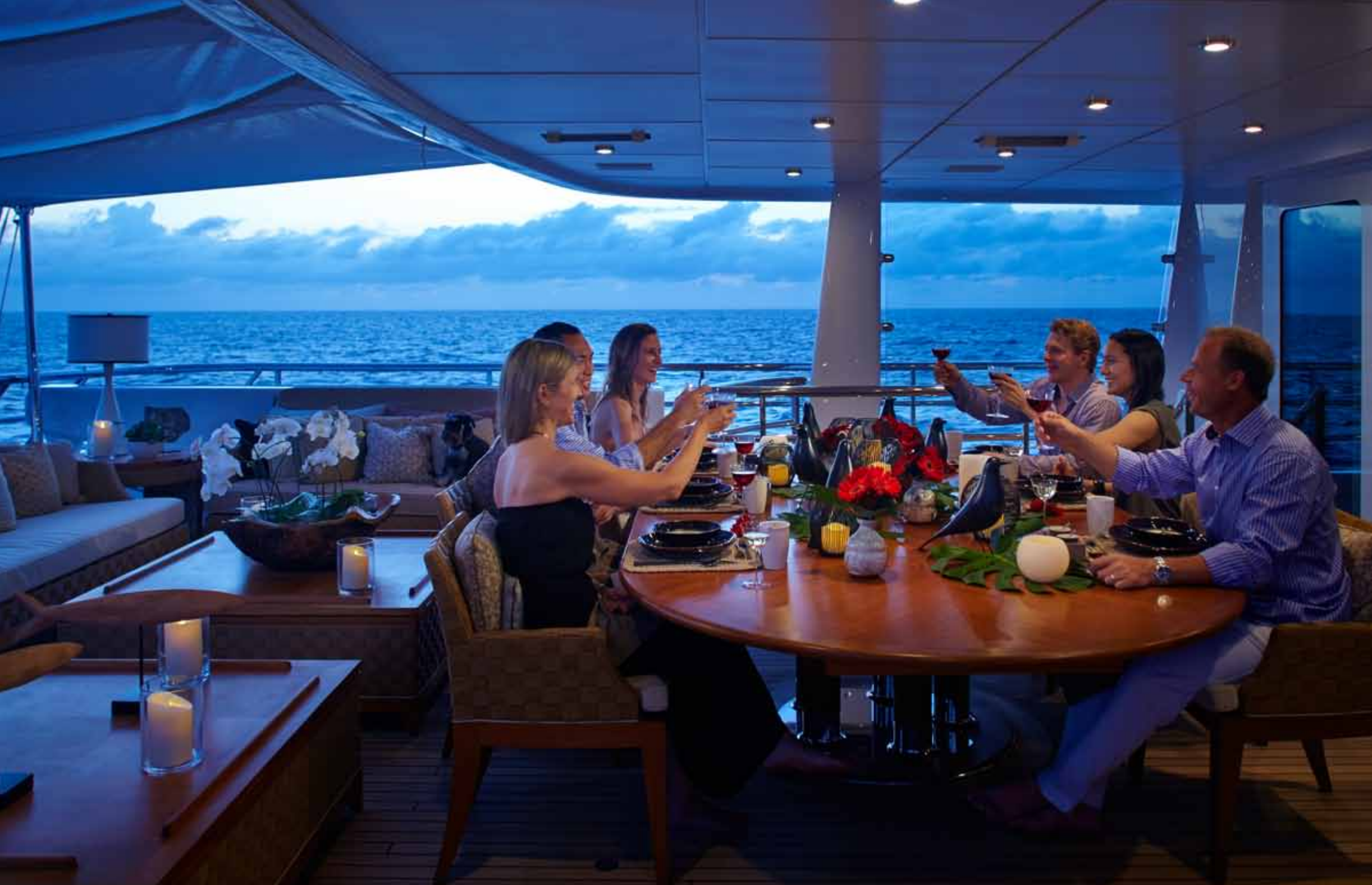
Bridge Deck Aft Al Fresco Dining For Up To Twelve Guests