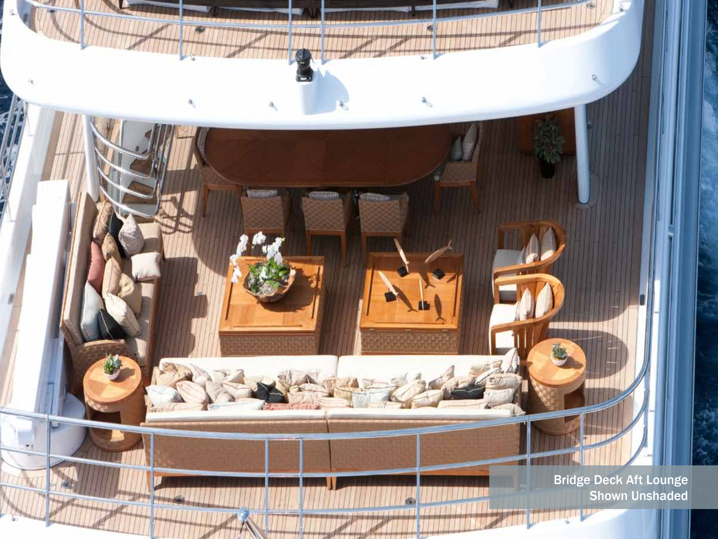
Bridge Deck Aft Lounge Shown Unshaded