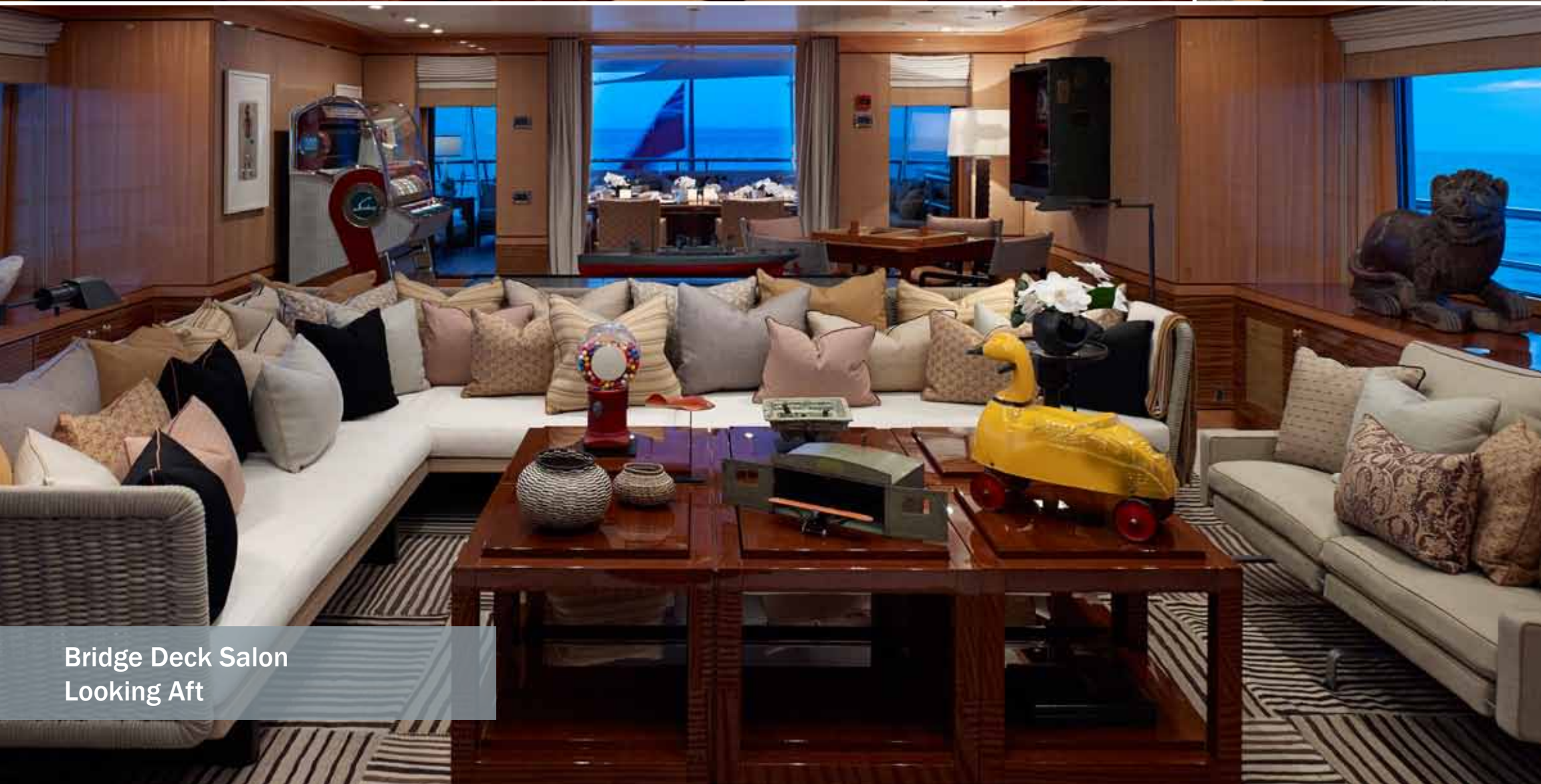
Bridge Deck Salon Looking Aft