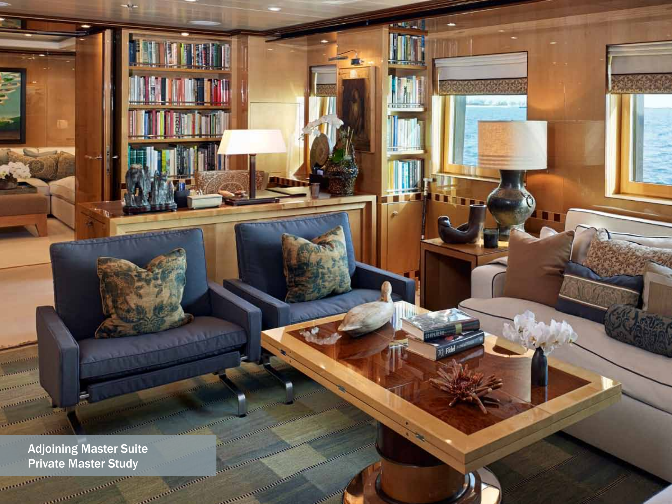
Adjoining Master Suite Private Master Study