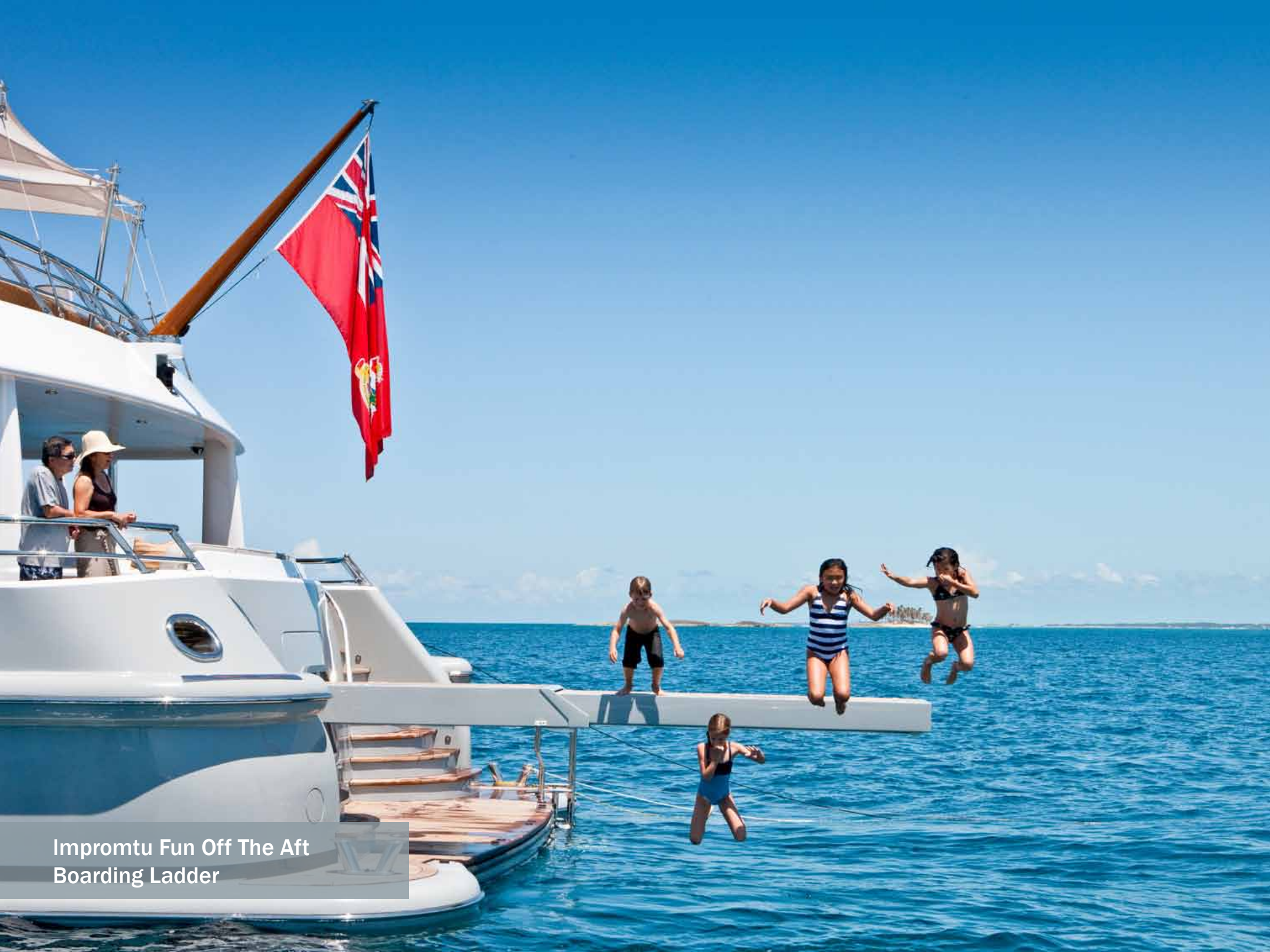
Impromptu Fun Off The Aft Boarding Ladder