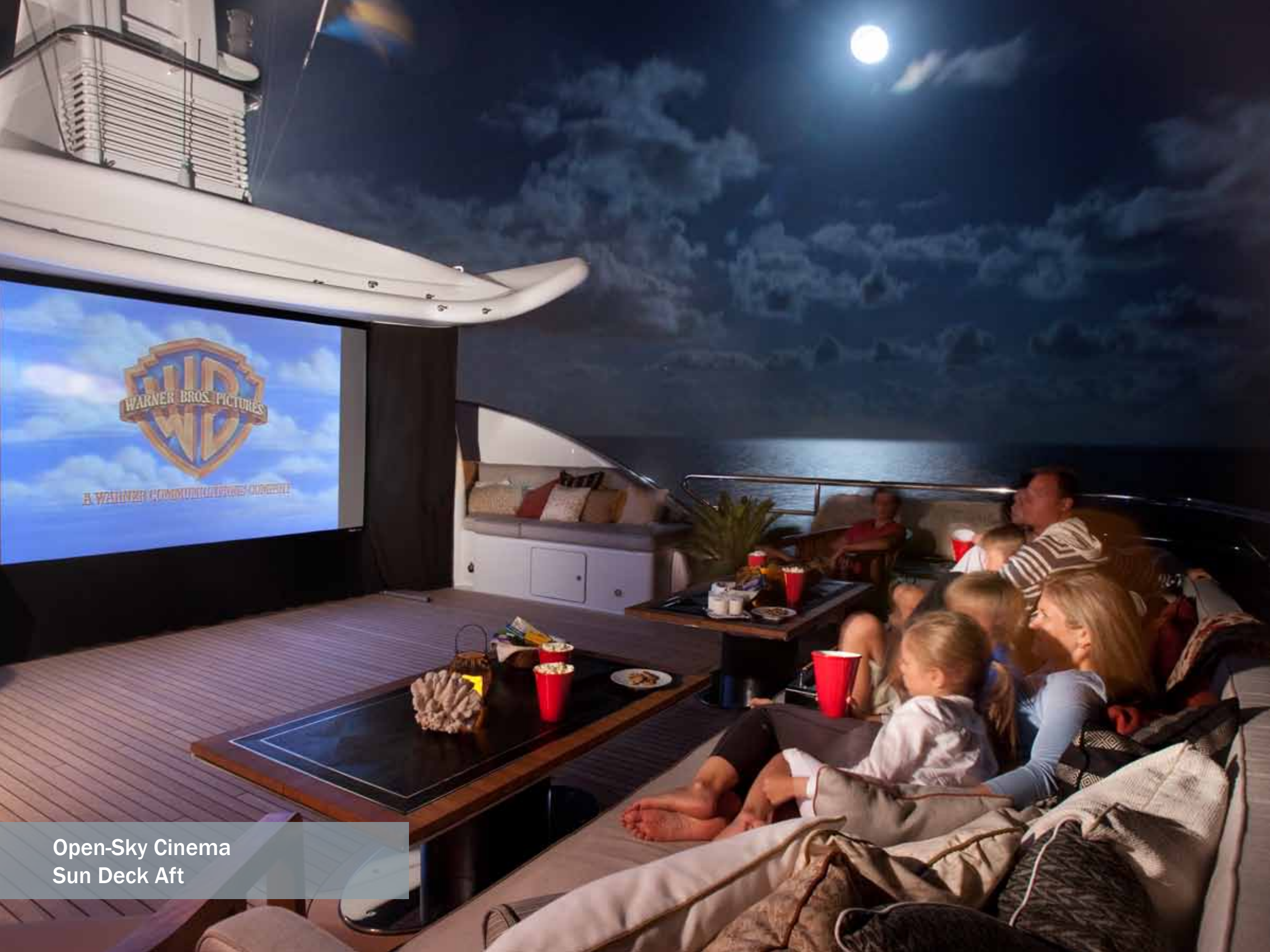
Open-Sky Cinema Sun Deck Aft