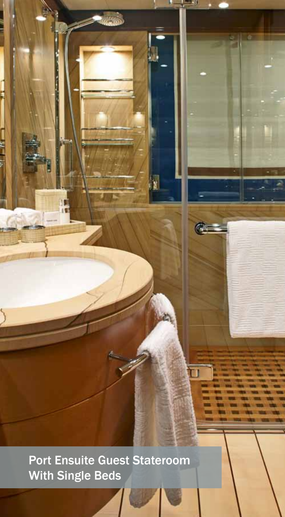
Port Ensuite Guest Stateroom With Single Beds