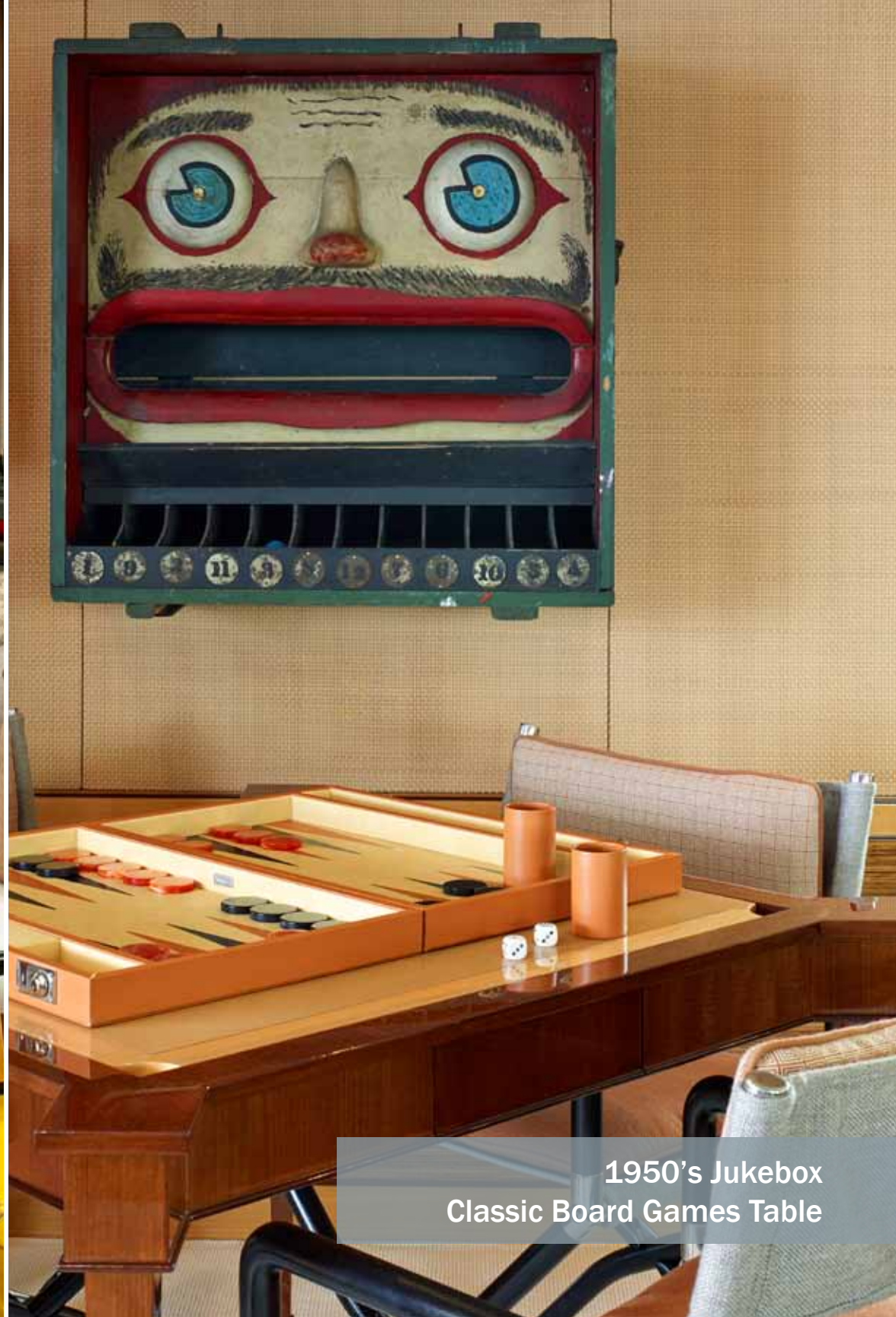
1950's Jukebox Classic Board Games Table