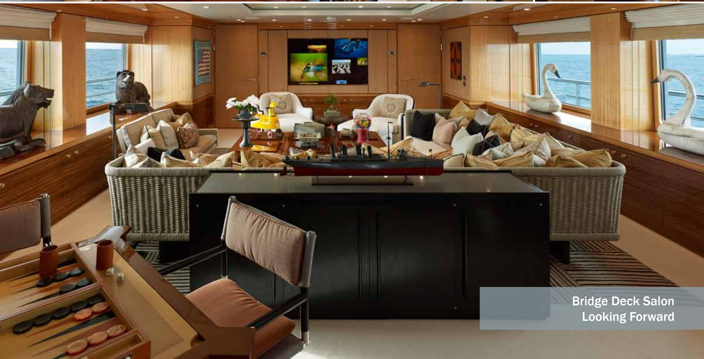
Bridge Deck Salon Looking Forward