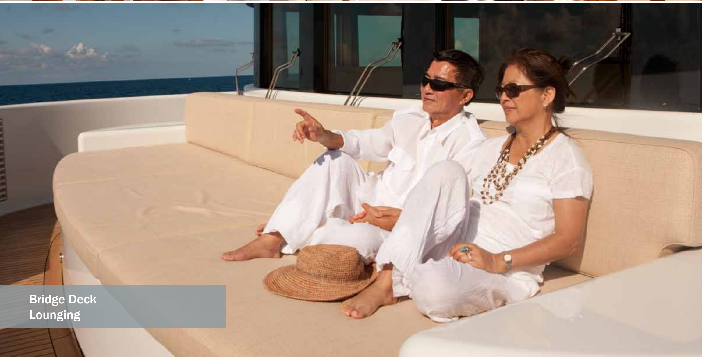
Bridge Deck Lounging