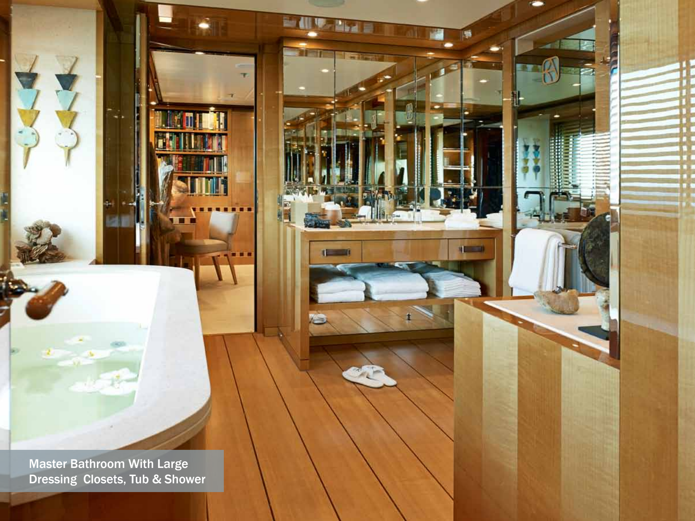
Master Bathroom With Large Dressing Closets, Tub & Shower