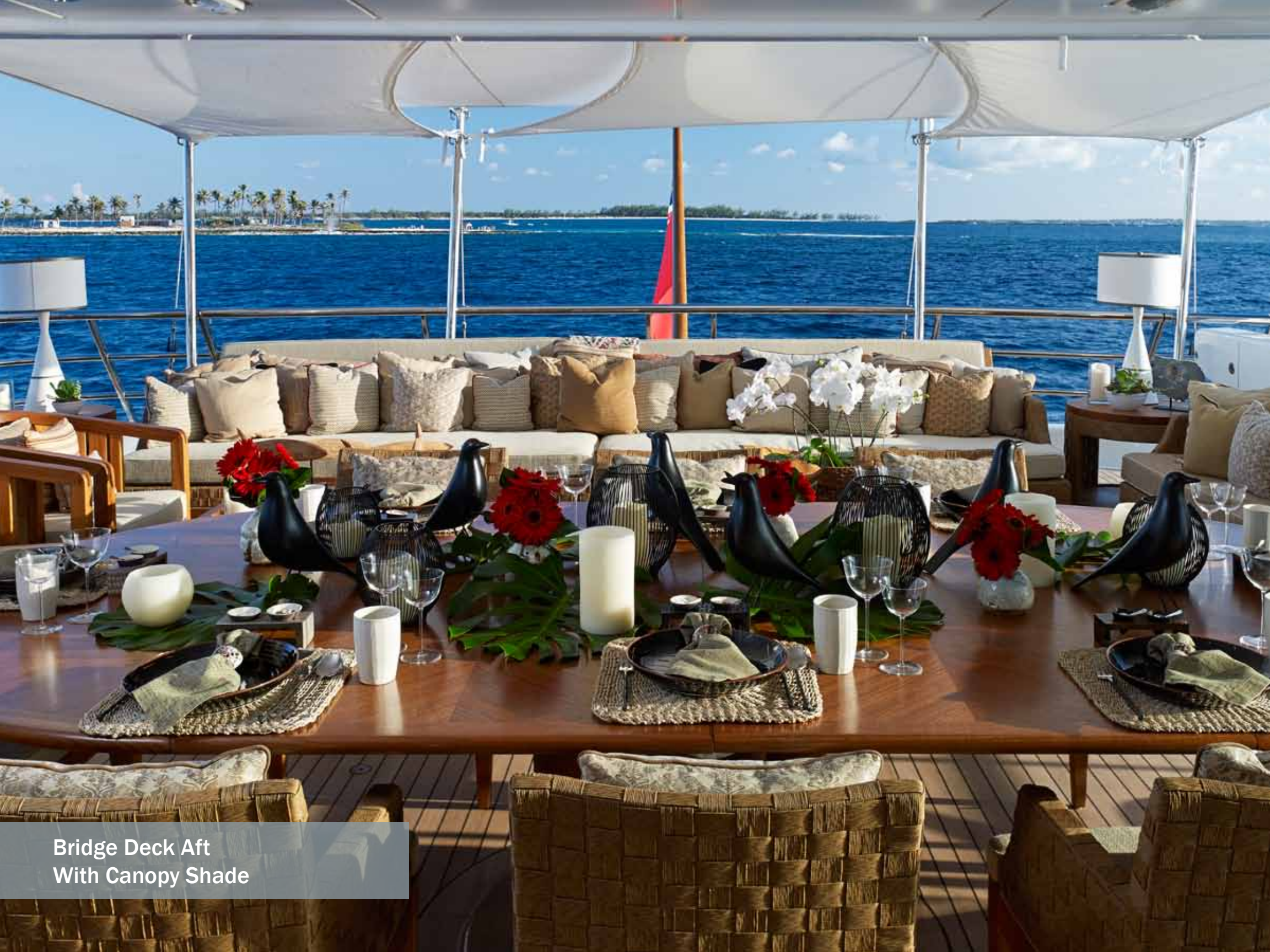
Bridge Deck Aft With Canopy Shade