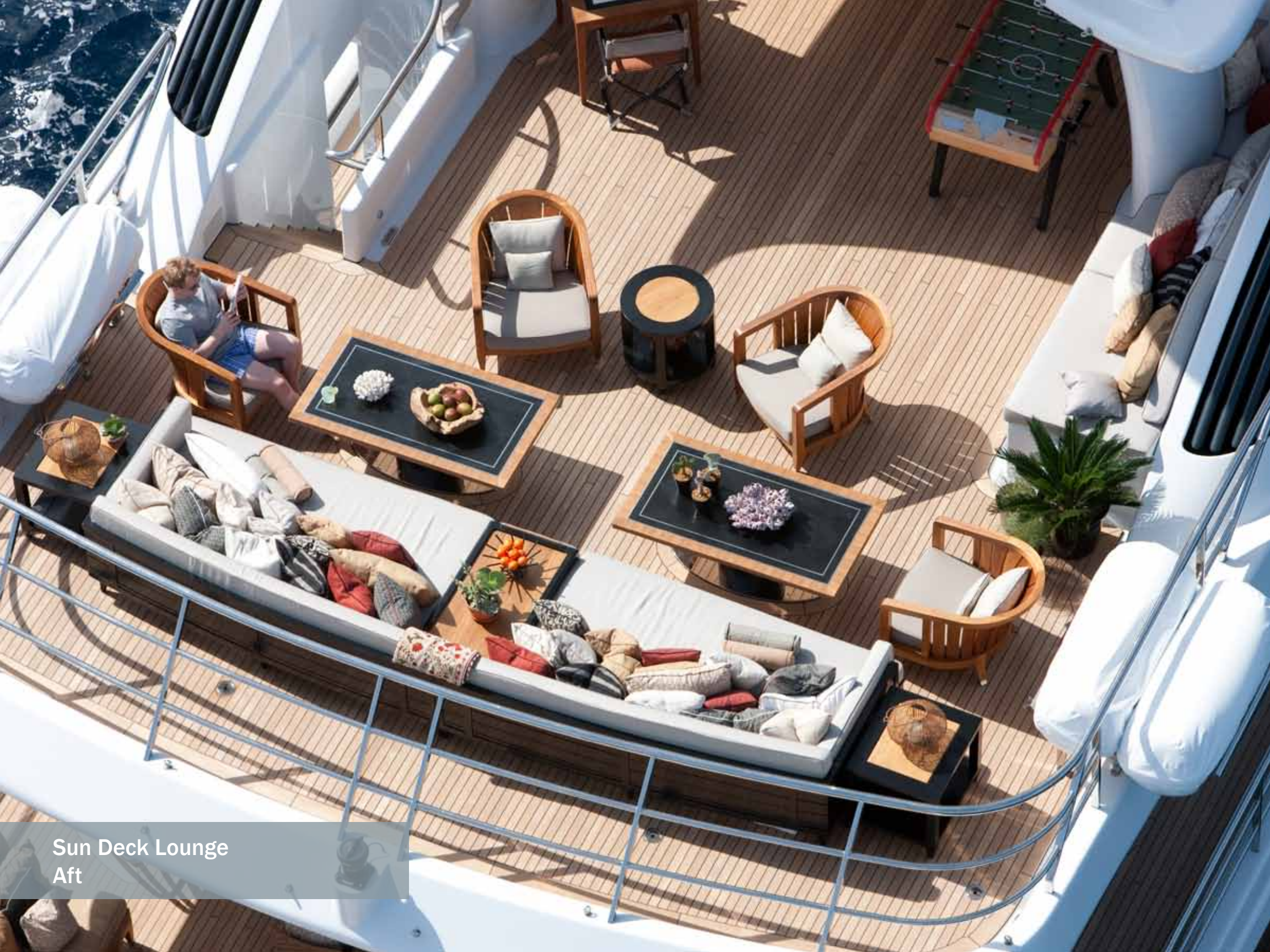
Sun Deck Lounge Aft