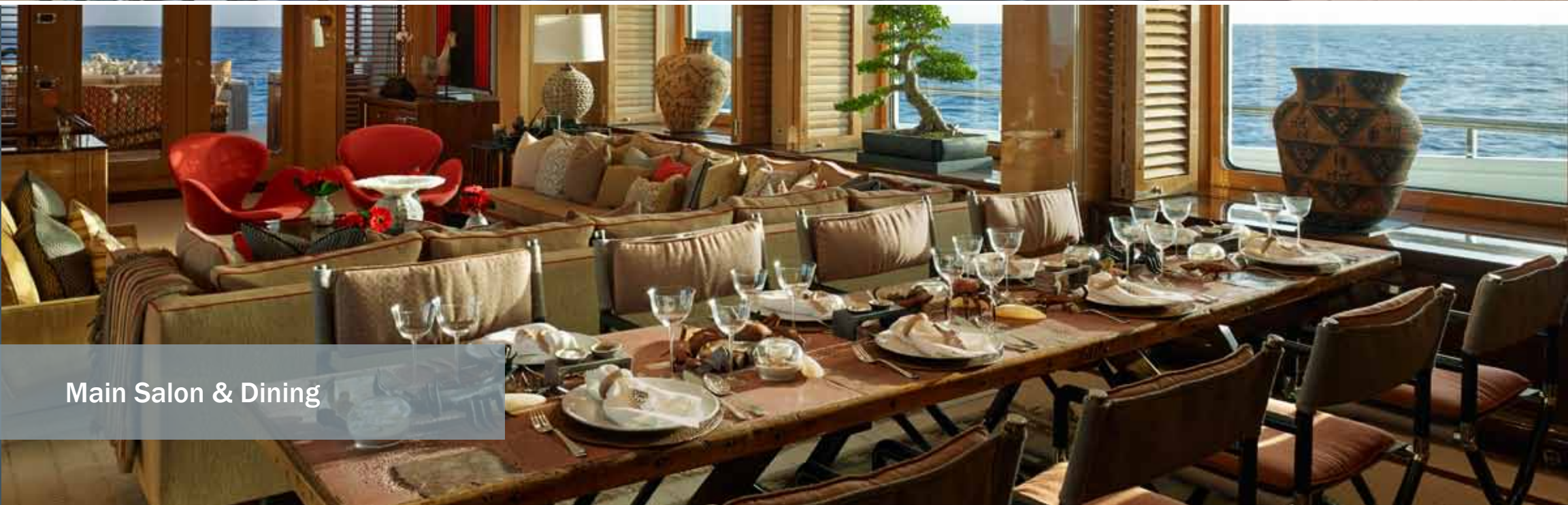
Main Salon & Dining