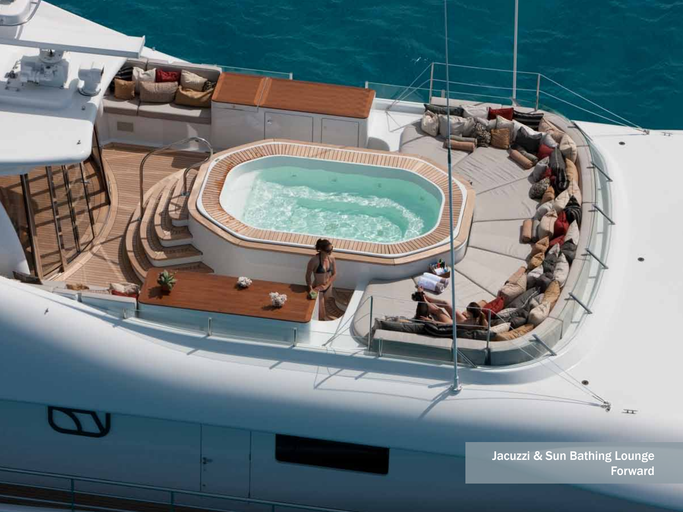
Jacuzzi & Sun Bathing Lounge Forward