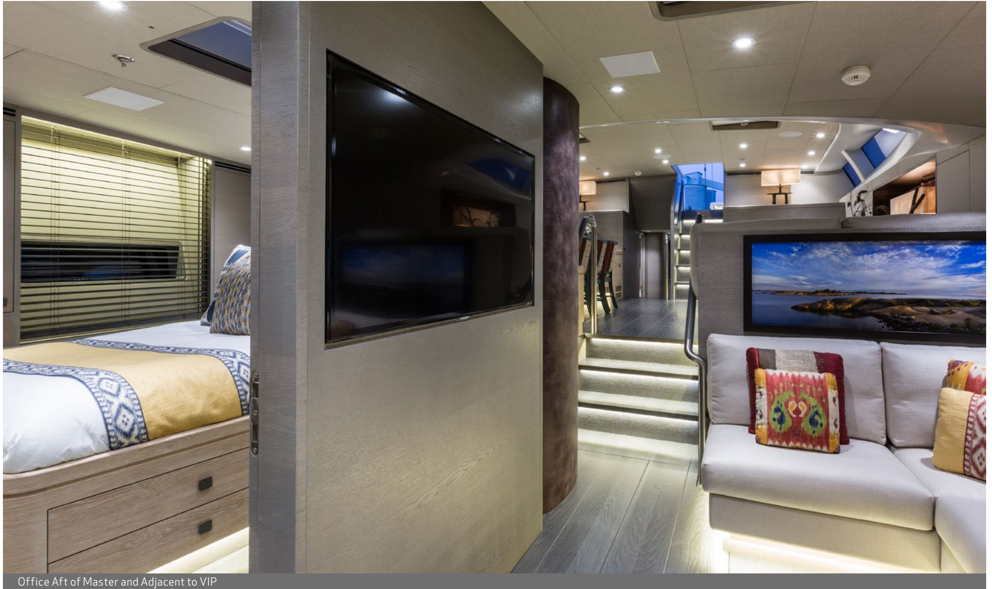
Office Aft of Master and Adjacent to VIP