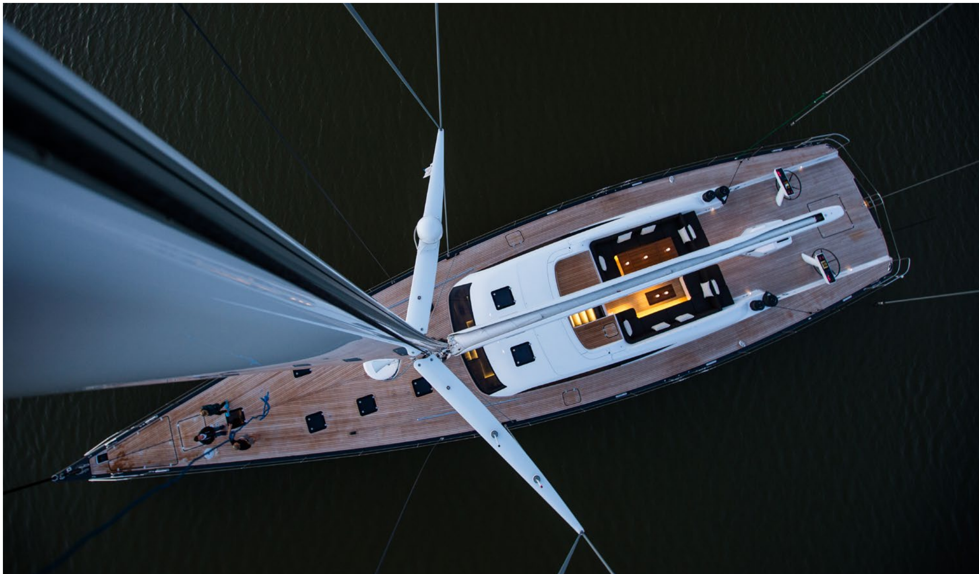
Aerial Shoot From the Mast