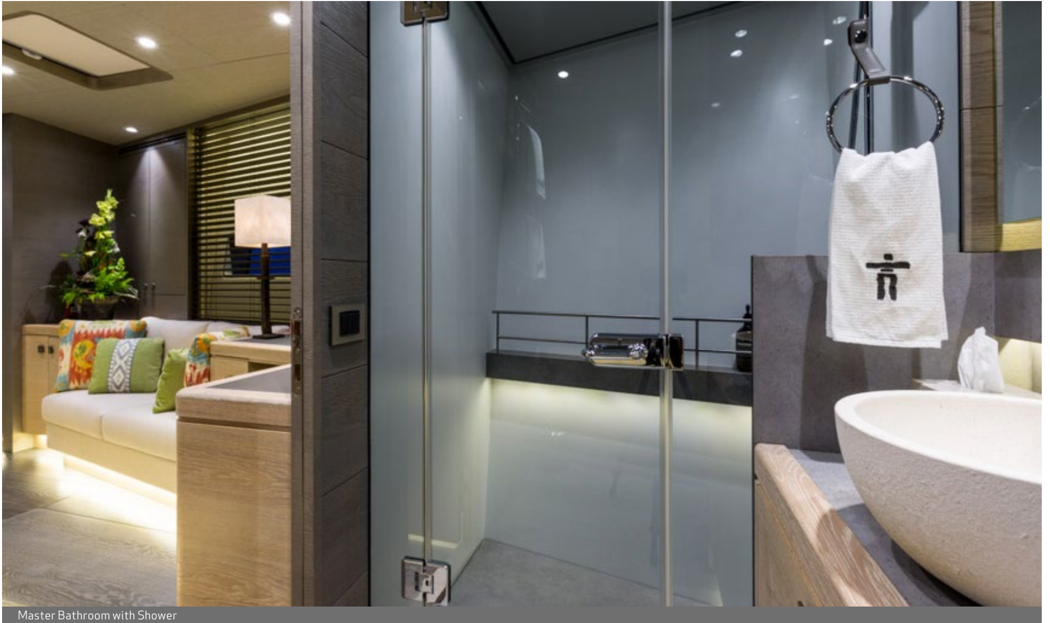
Master Bathroom with Shower