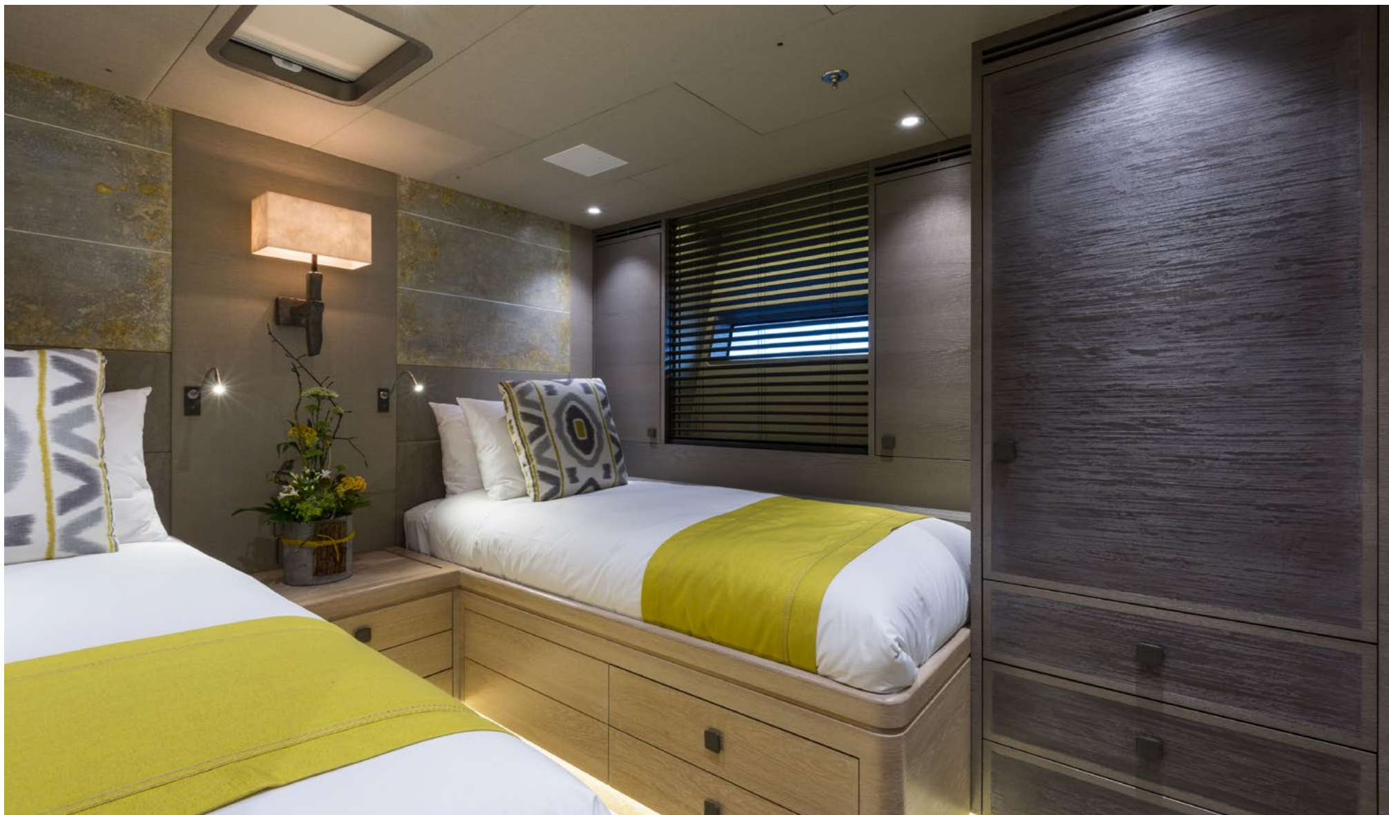
Guest Stateroom II