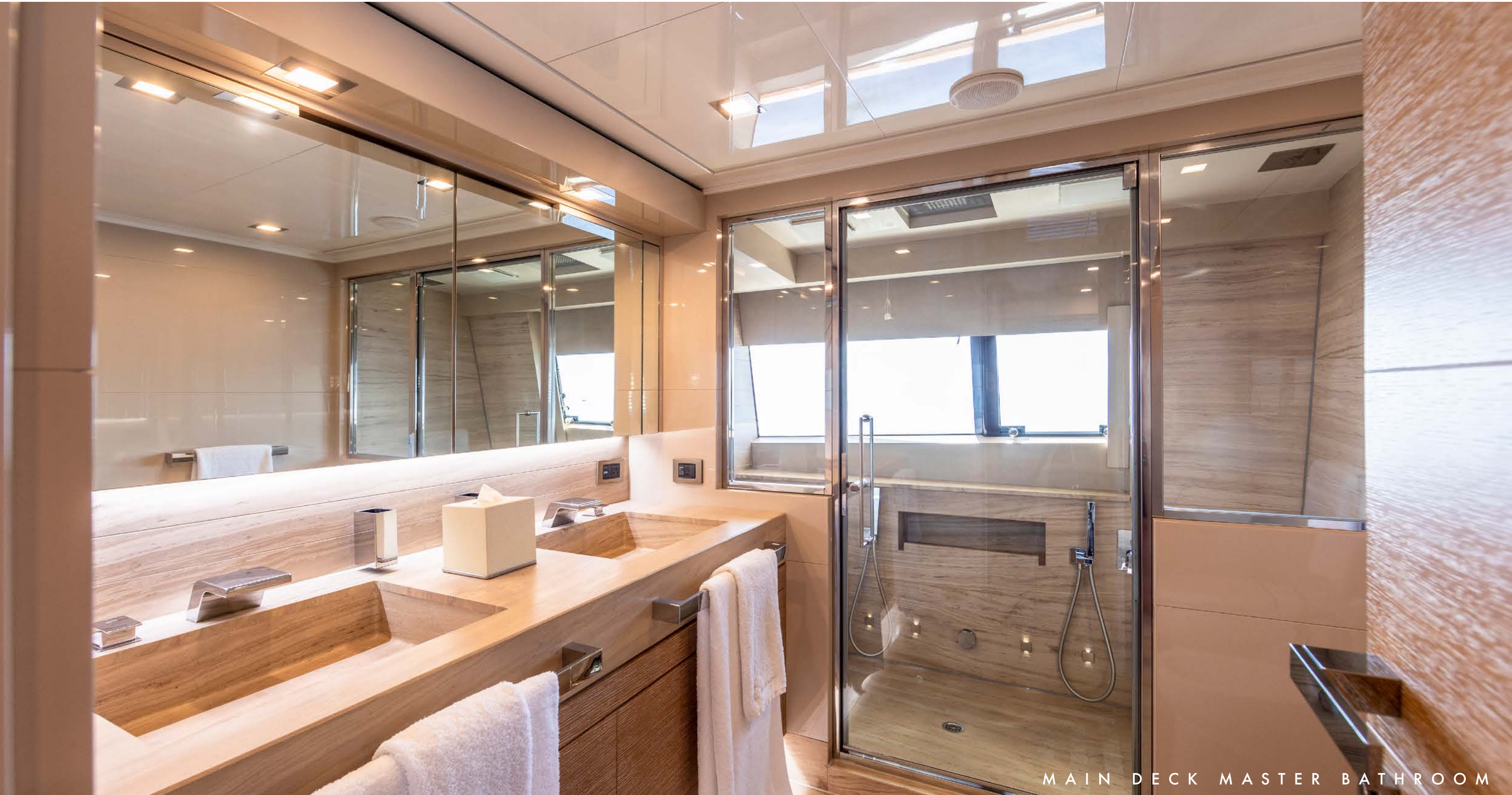
MAIN DECK MASTER BATHROOM