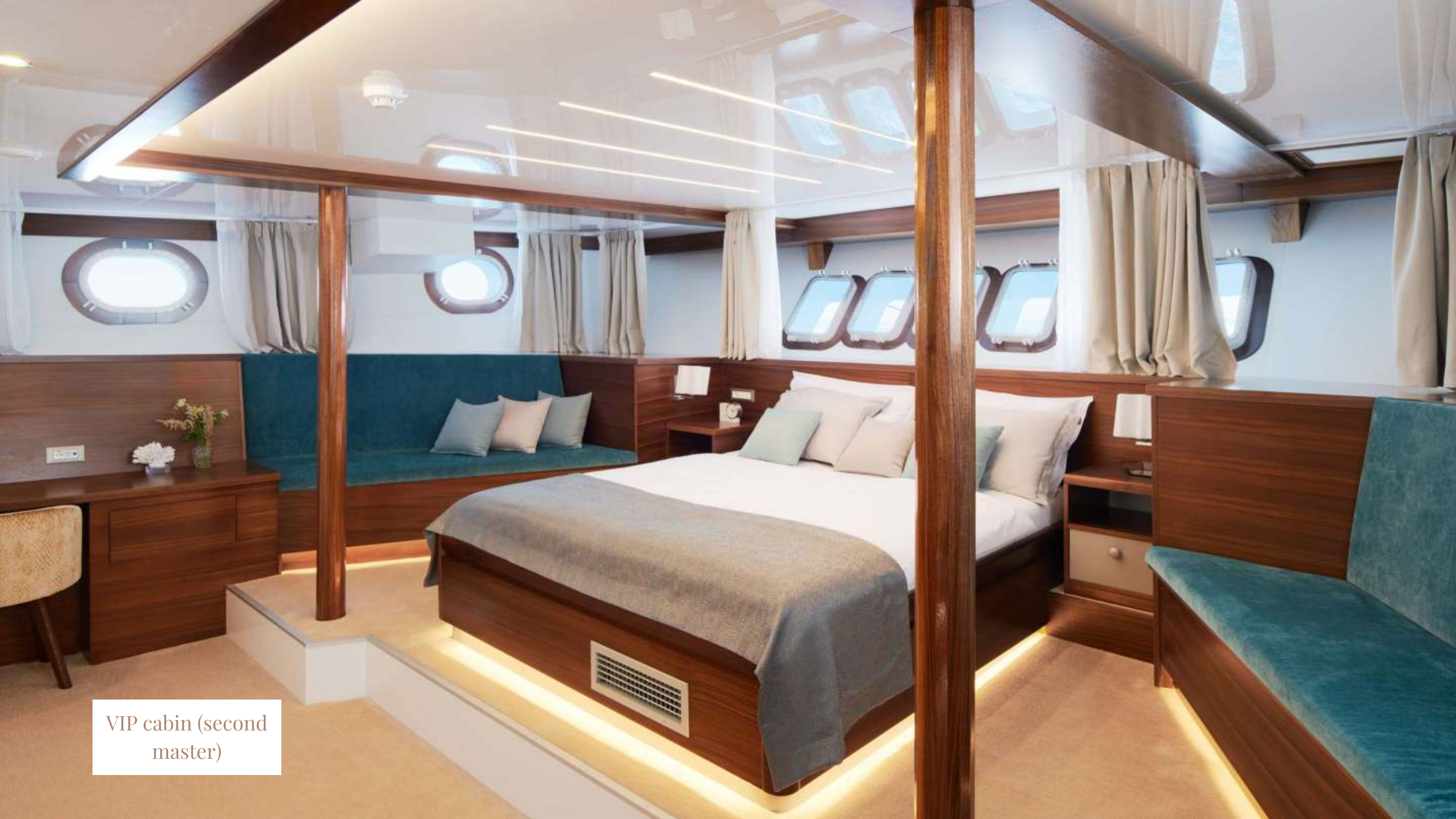
VIP cabin (second master)