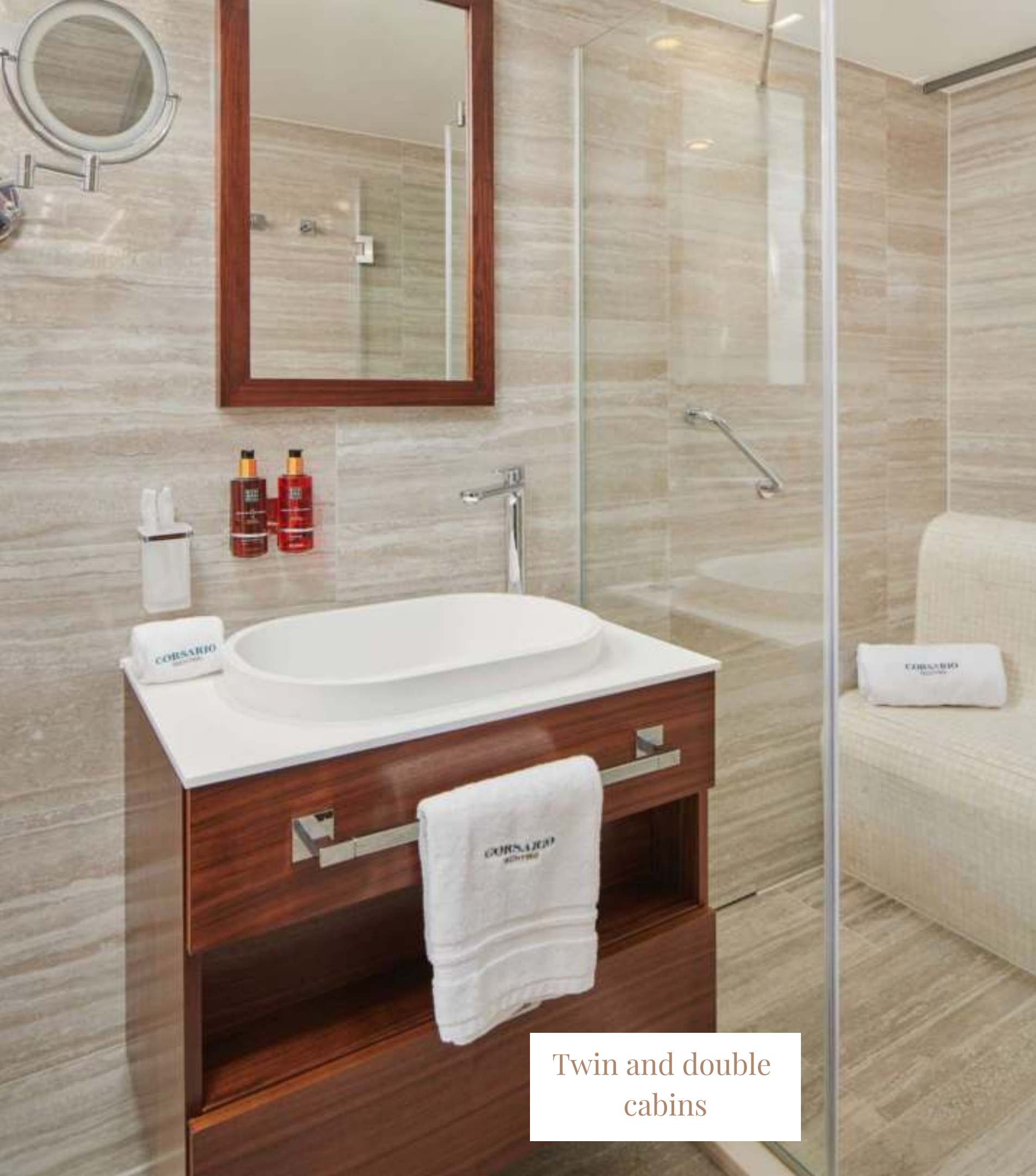
Twin and double cabins