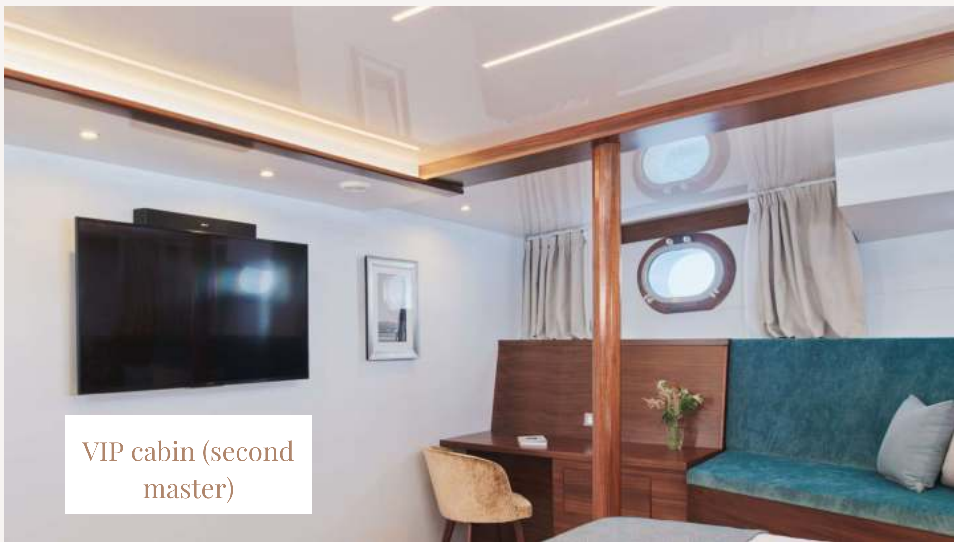
VIP cabin (second master)