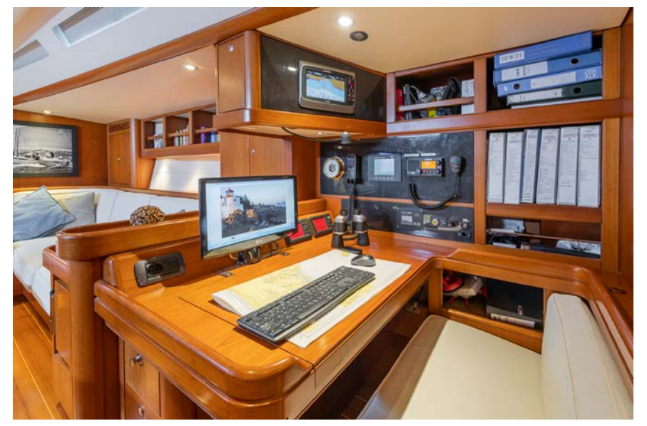
SW78 Elise Whisper