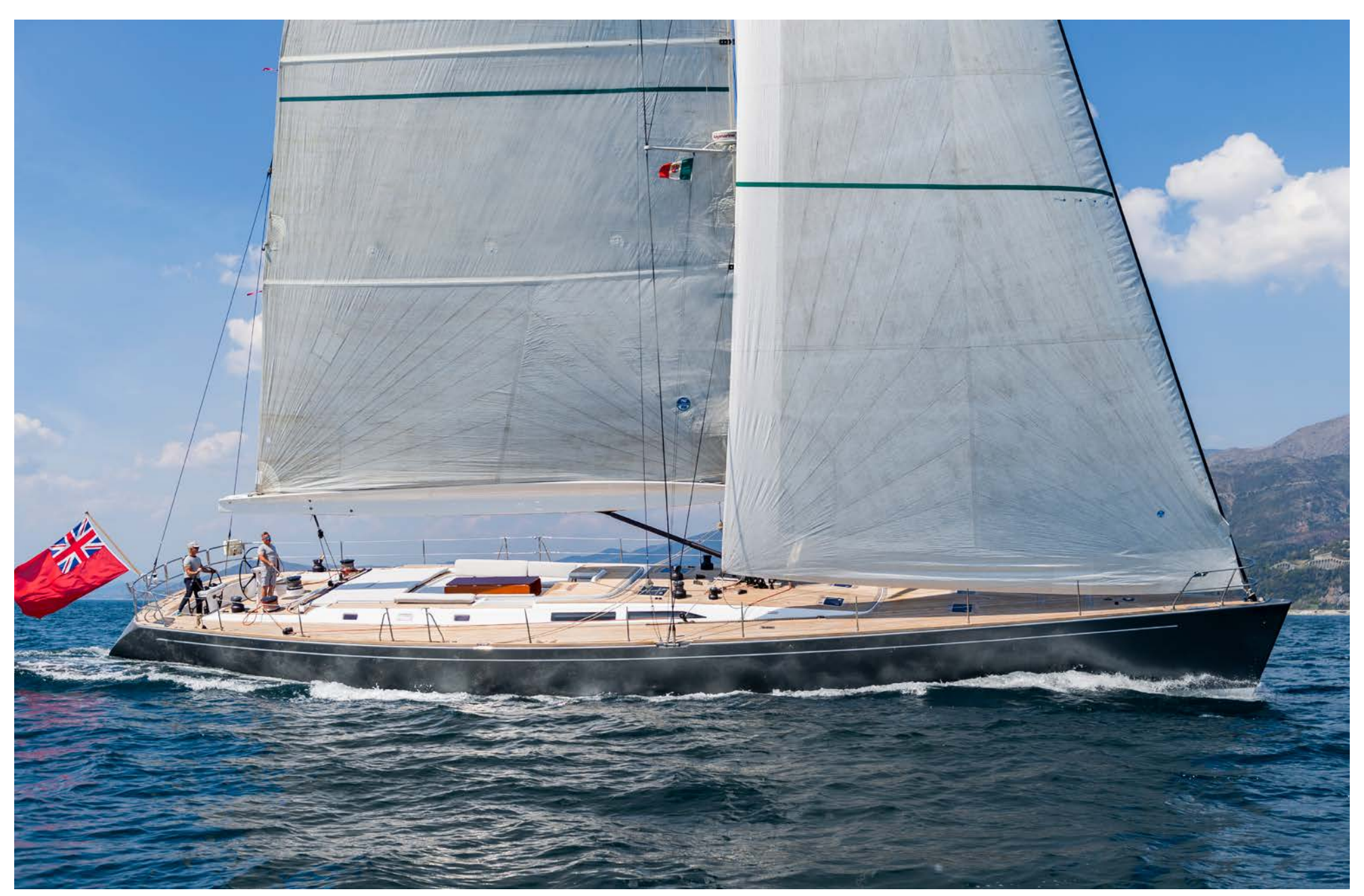
SW78 Elise Whisper