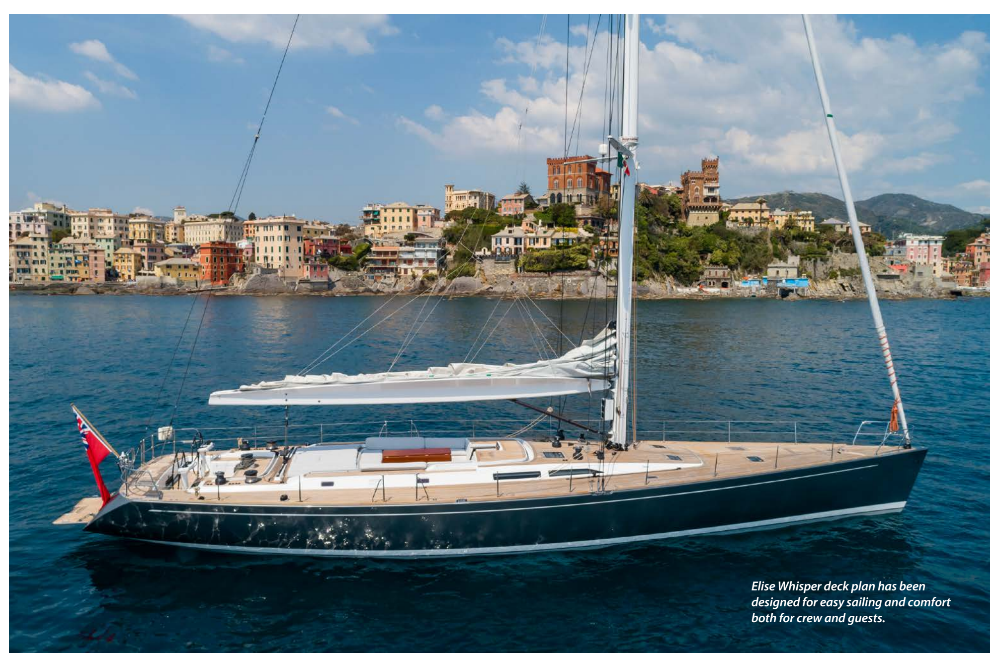
SW78 Elise Whisper