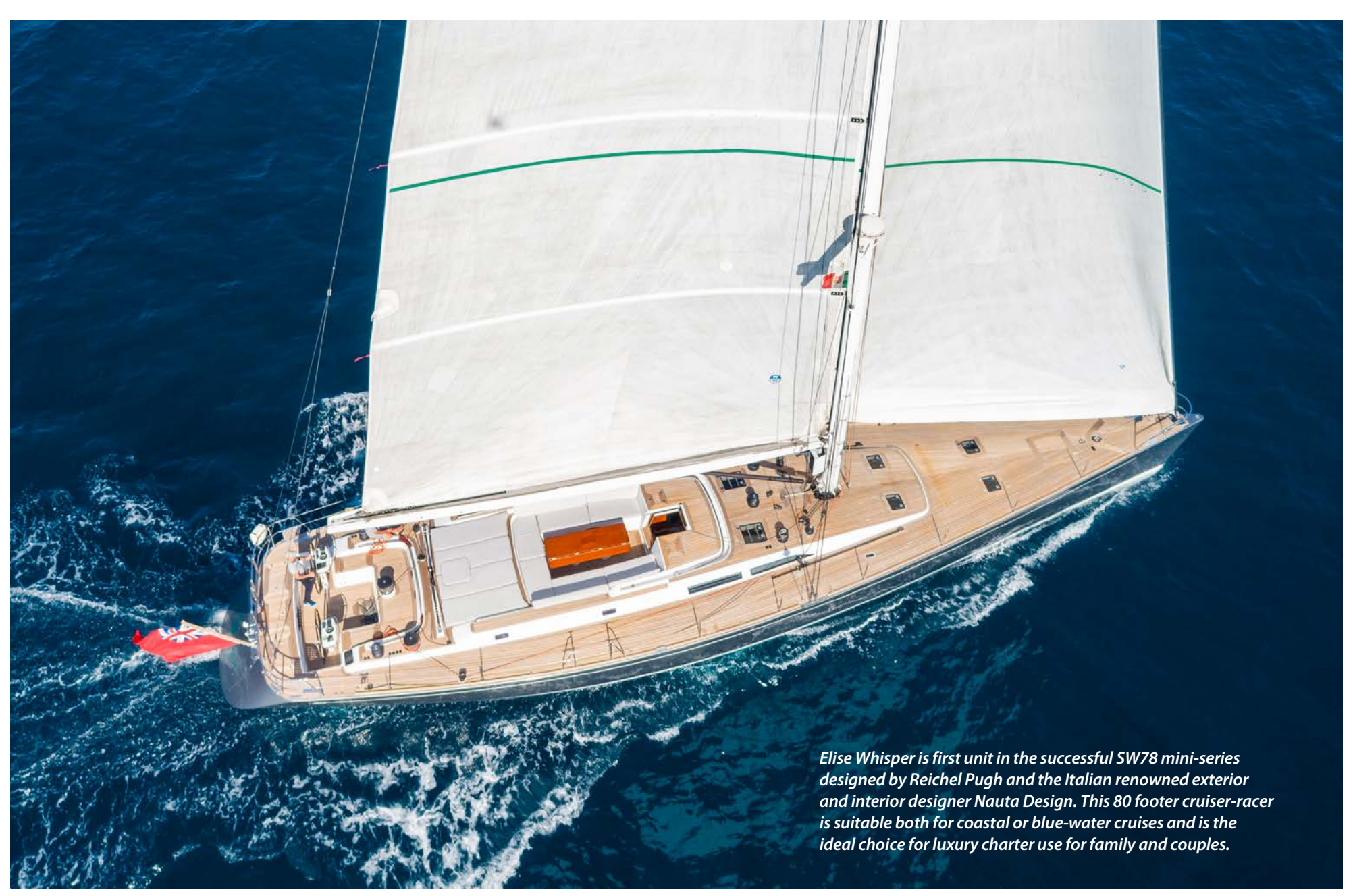
SW78 Elise Whisper