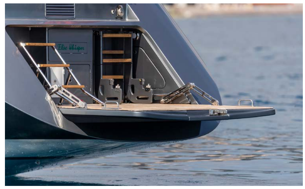
SW78 Elise Whisper