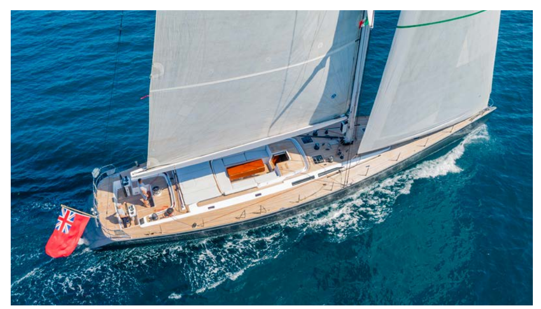
SW78 Elise Whisper