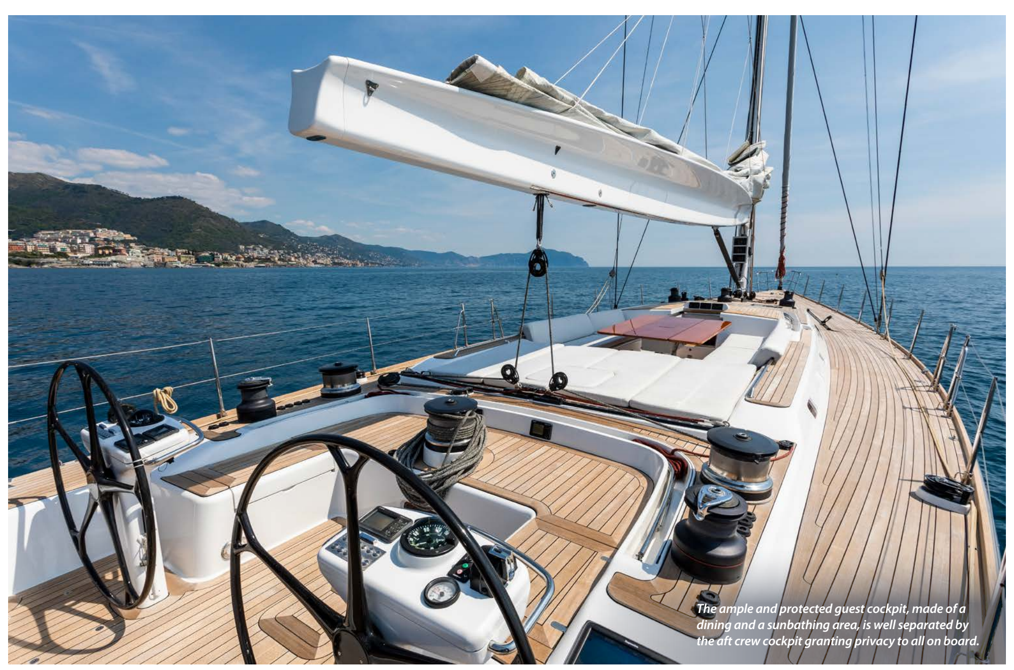
SW78 Elise Whisper