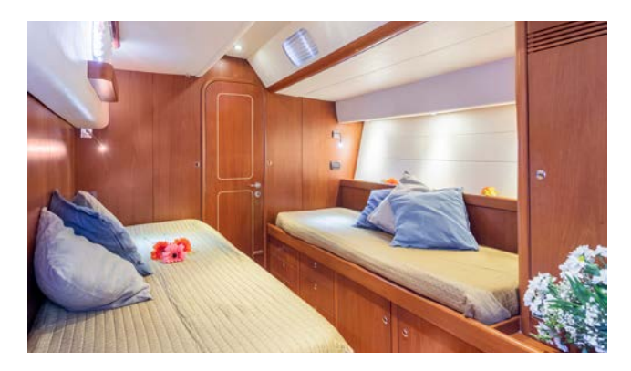
SW78 Elise Whisper