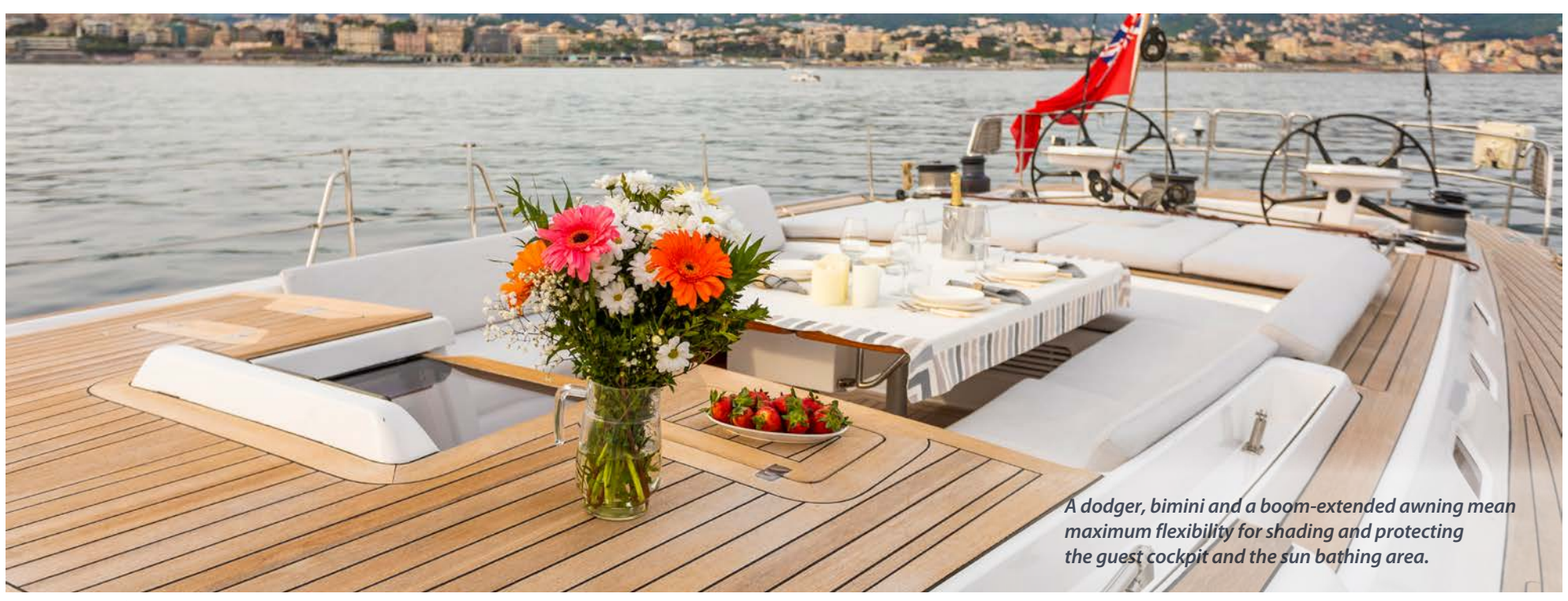
SW78 Elise Whisper