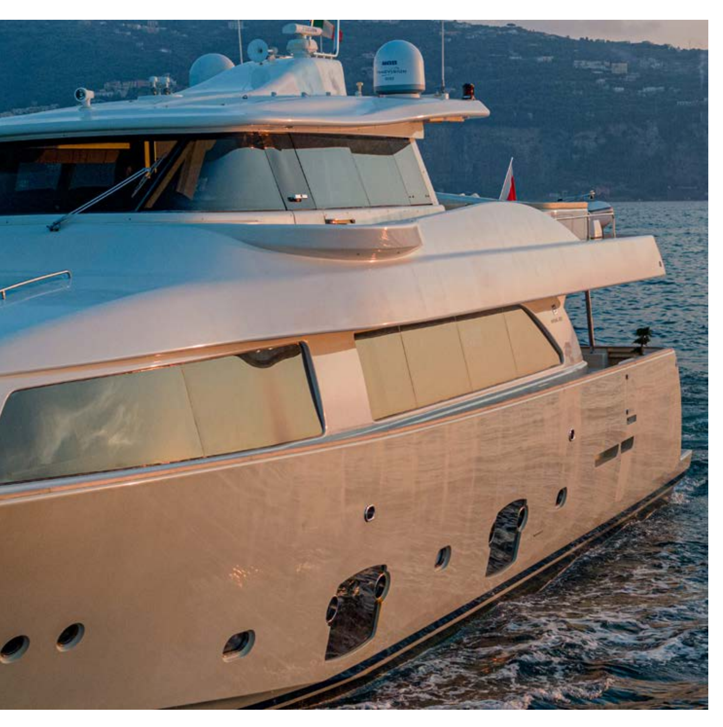
Built in 2009 by the Ferretti shipyard and extensively refitted between 2020 and 2023, the magnificent Ferretti Navetta 26 EOLIA provides a spacious living environment and offers accommodation for 12 guests, and up to 5 crew to guarantee an unforgettable charter experience.

The sleek salon is furnished with a sofa, a coffee table and a dining table perfect for a lunch during breezy days. A staircase on the main deck leads up to the sky lounge, which is seamlessly connected to the exterior lounge area.