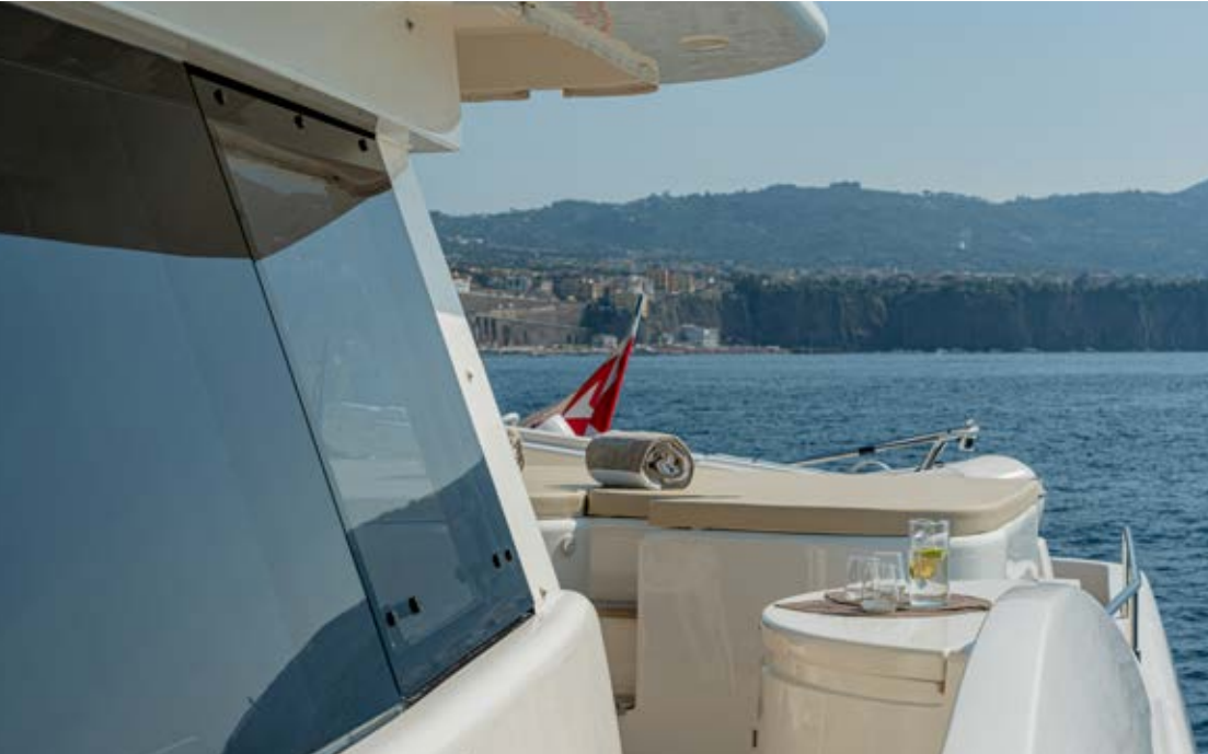
EOLIA | FERRETTI NAVETTA 26