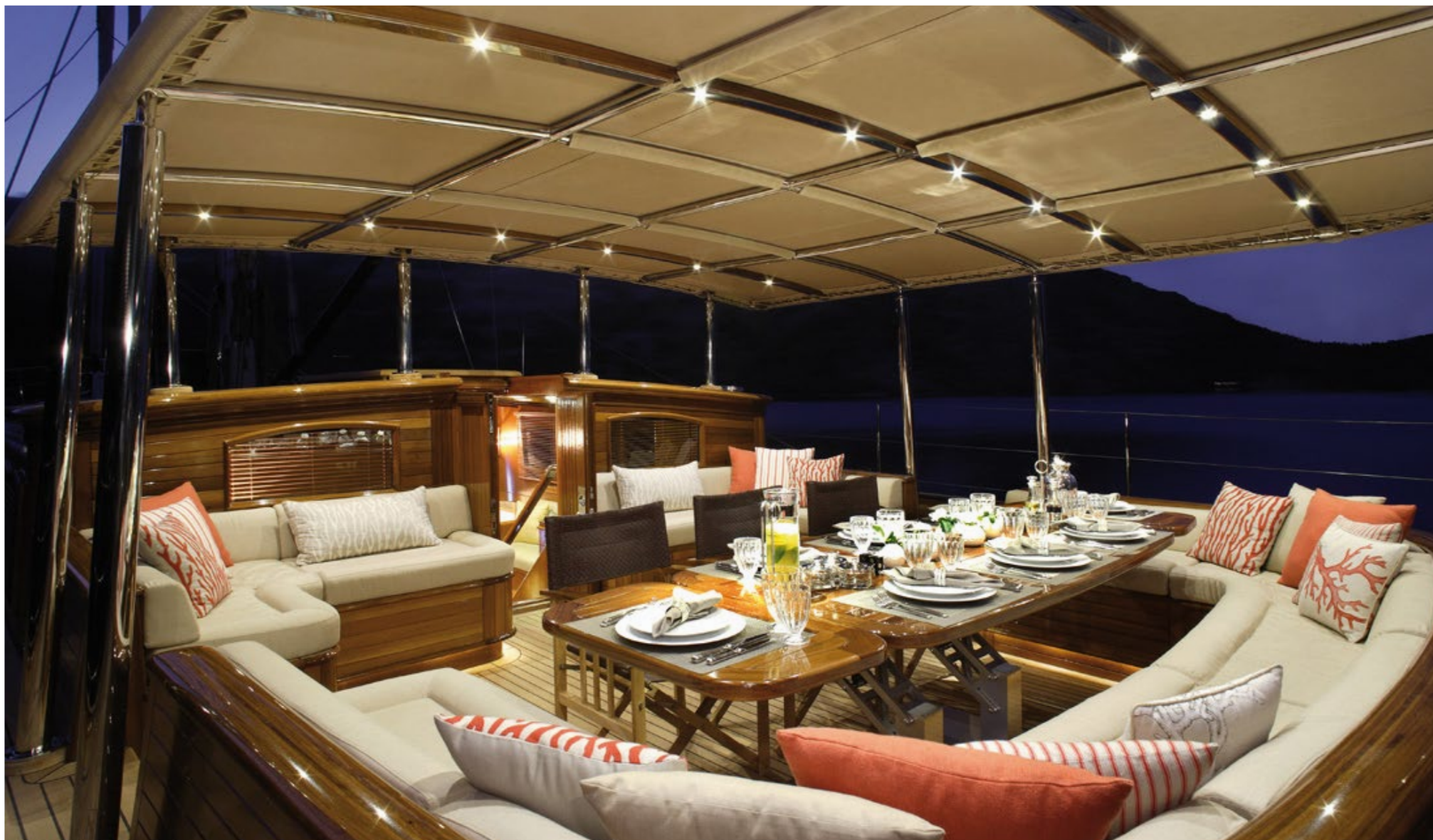
AFT DECK | DINING