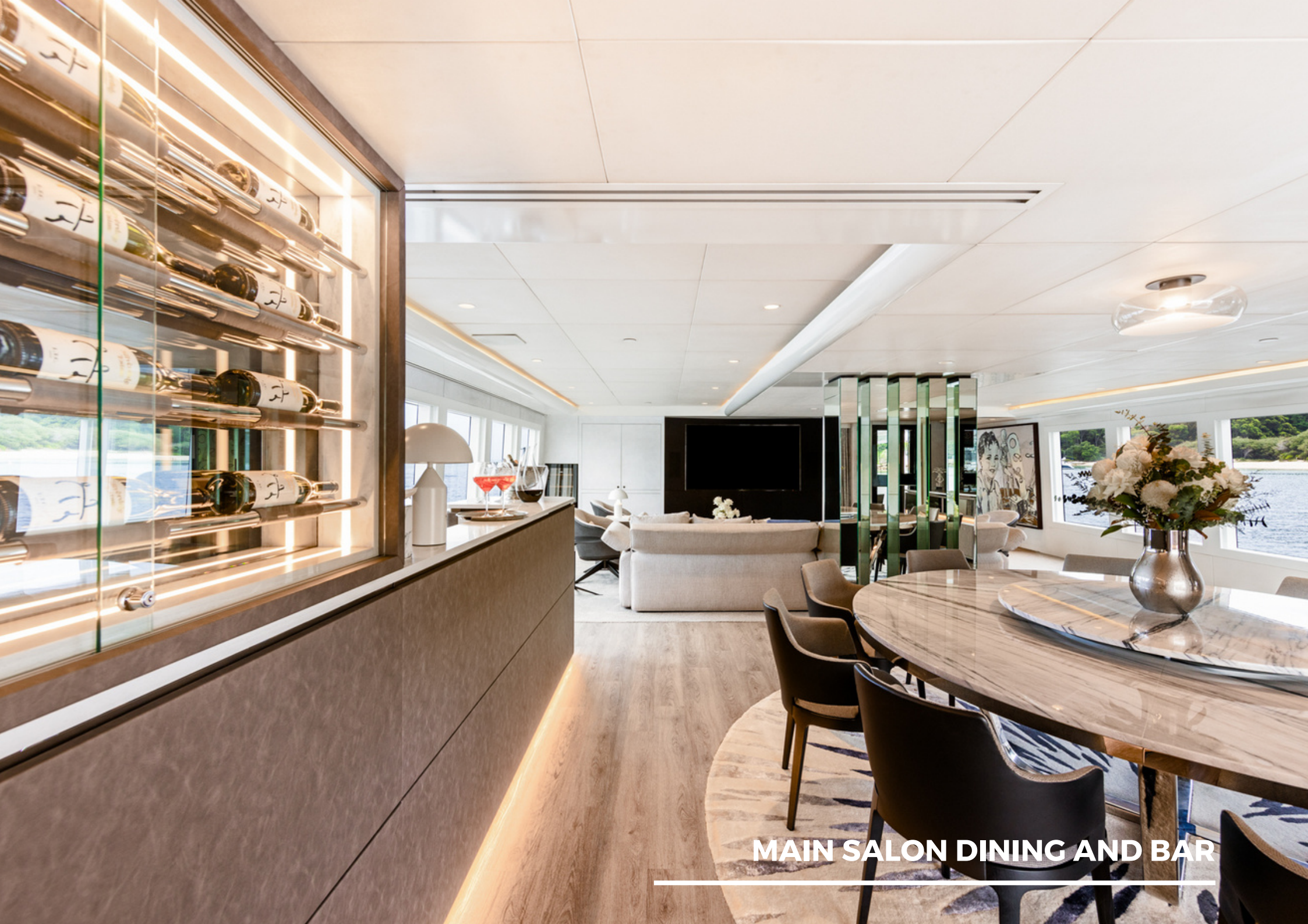
MAIN SALON DINING AND BAR