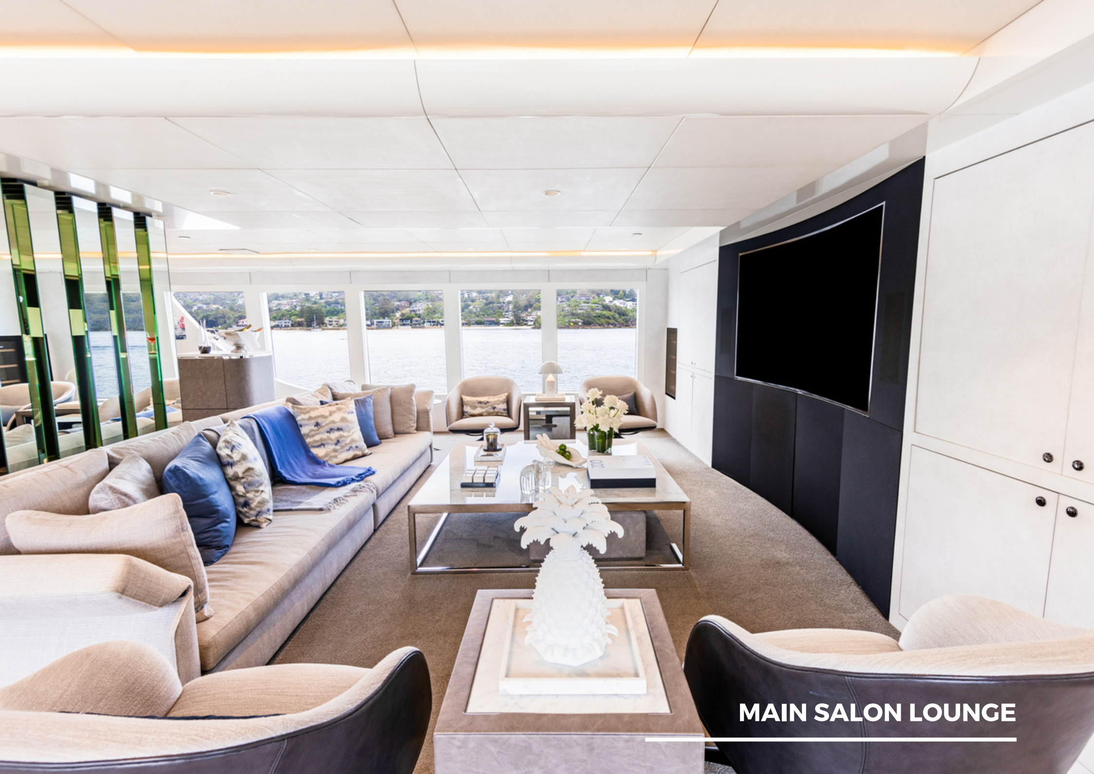
MAIN SALON LOUNGE