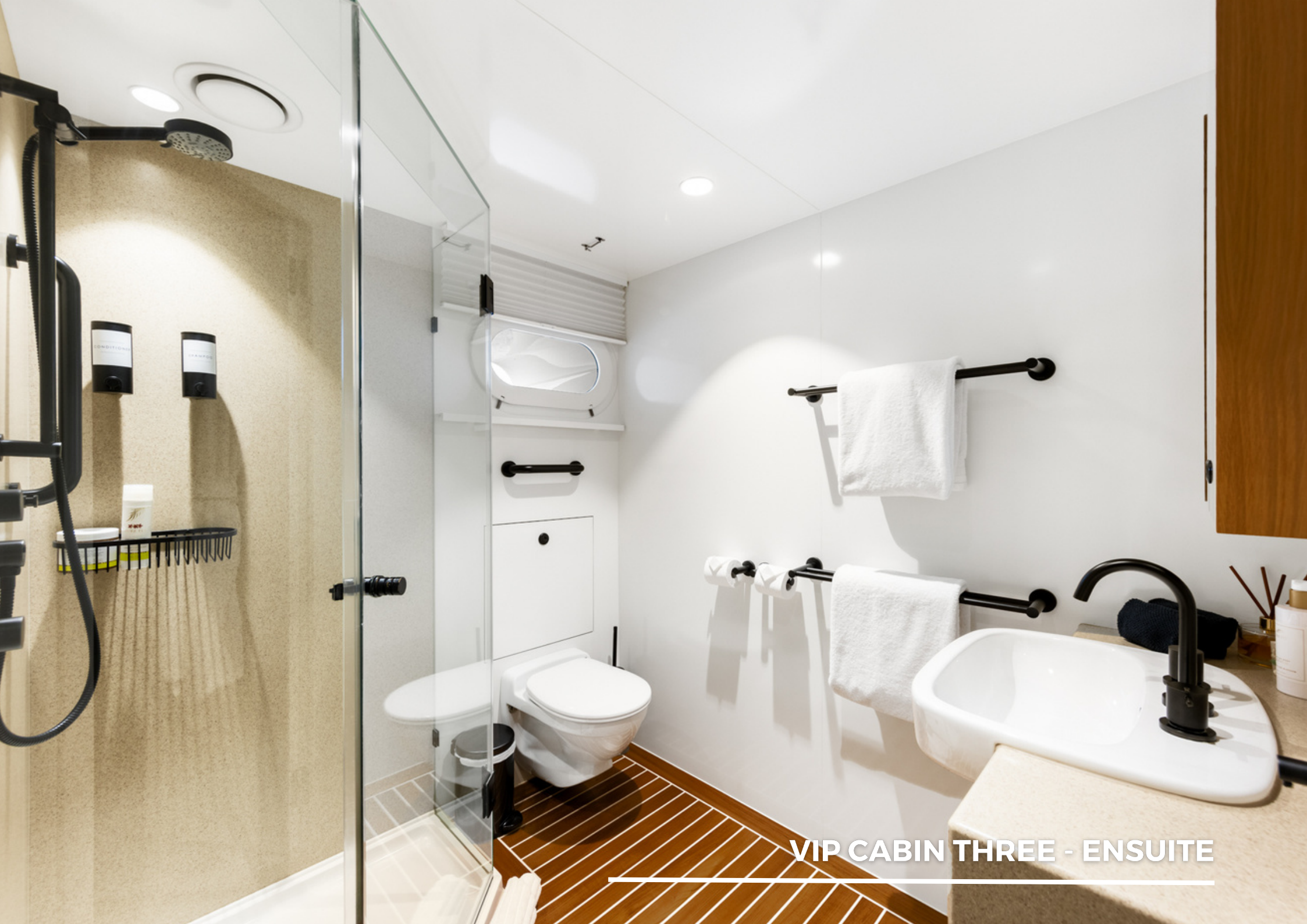
VIP CABIN THREE - ENSUITE