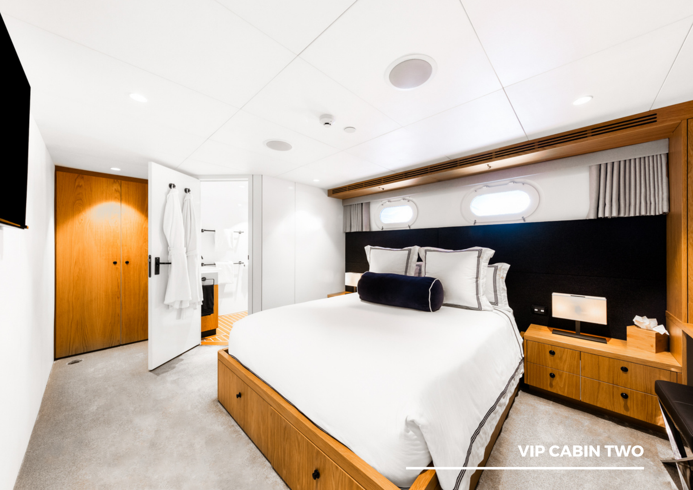
VIP CABIN TWO