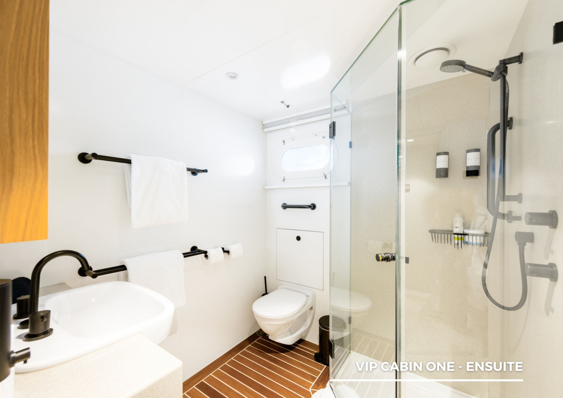
VIP CABIN ONE - ENSUITE