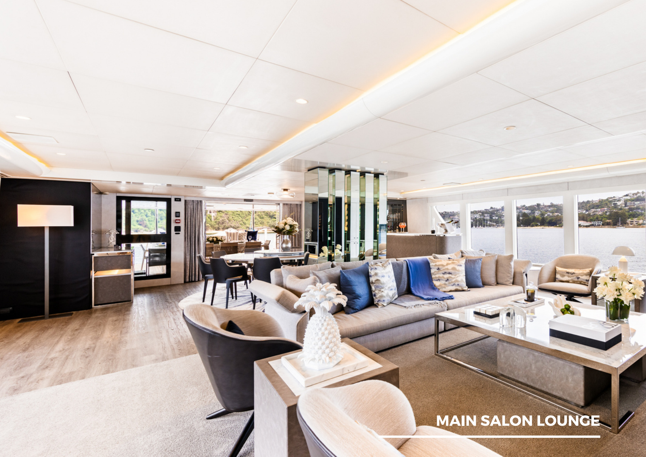
MAIN SALON LOUNGE