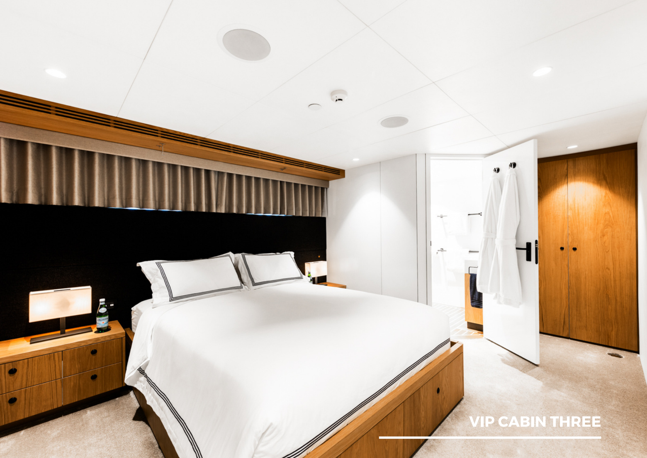
VIP CABIN THREE