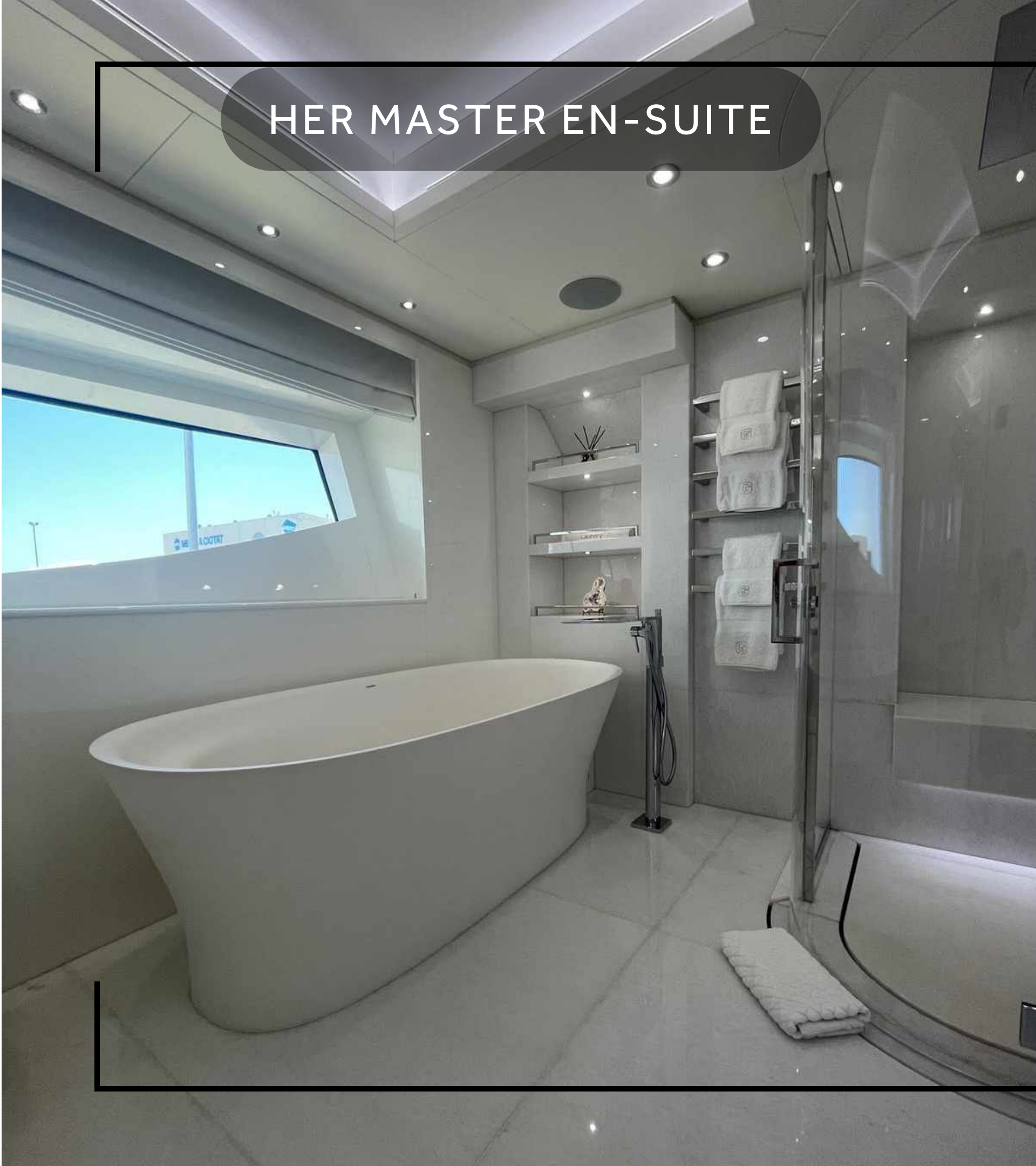
HER MASTER EN-SUITE