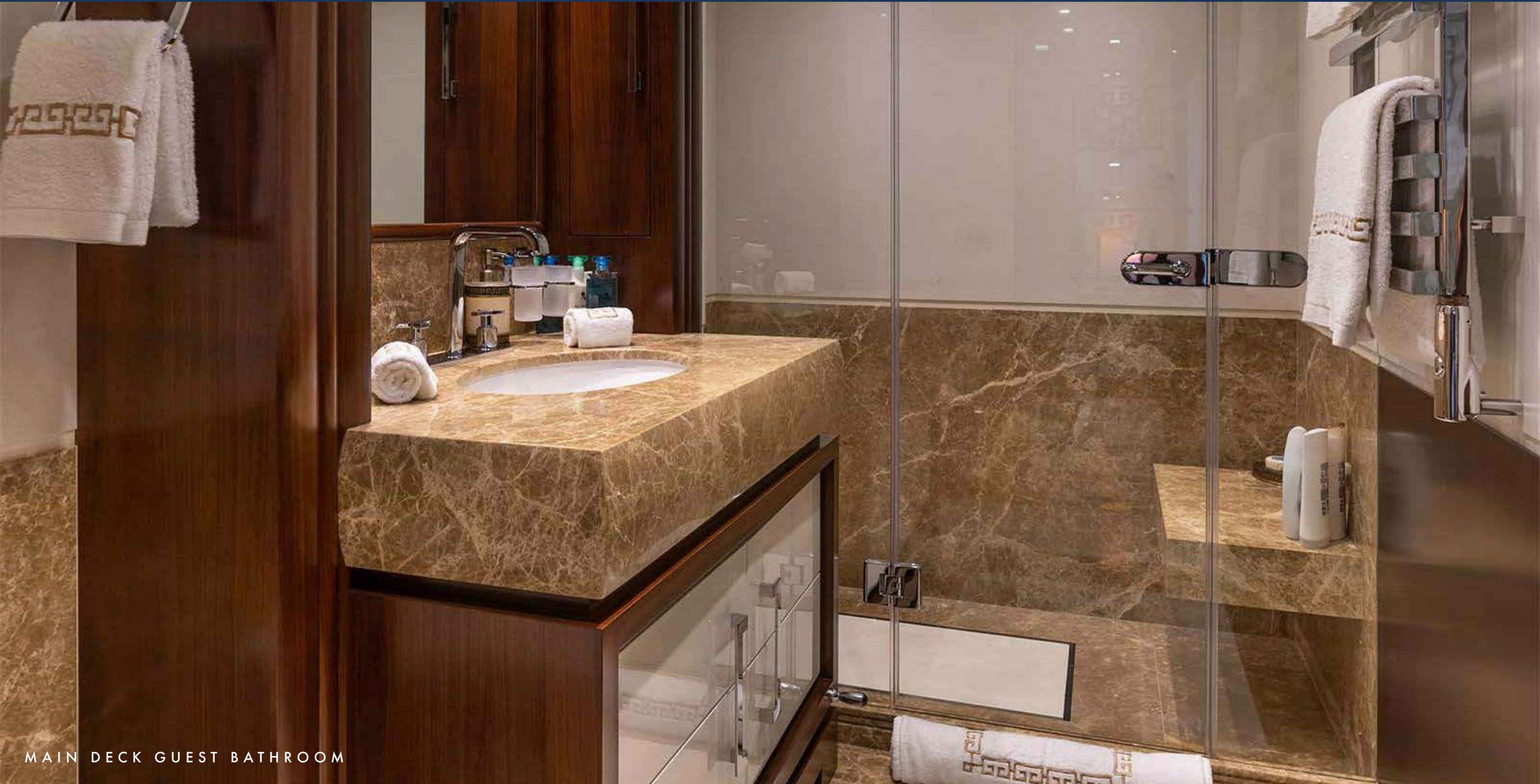
MAIN DECK GUEST BATHROOM