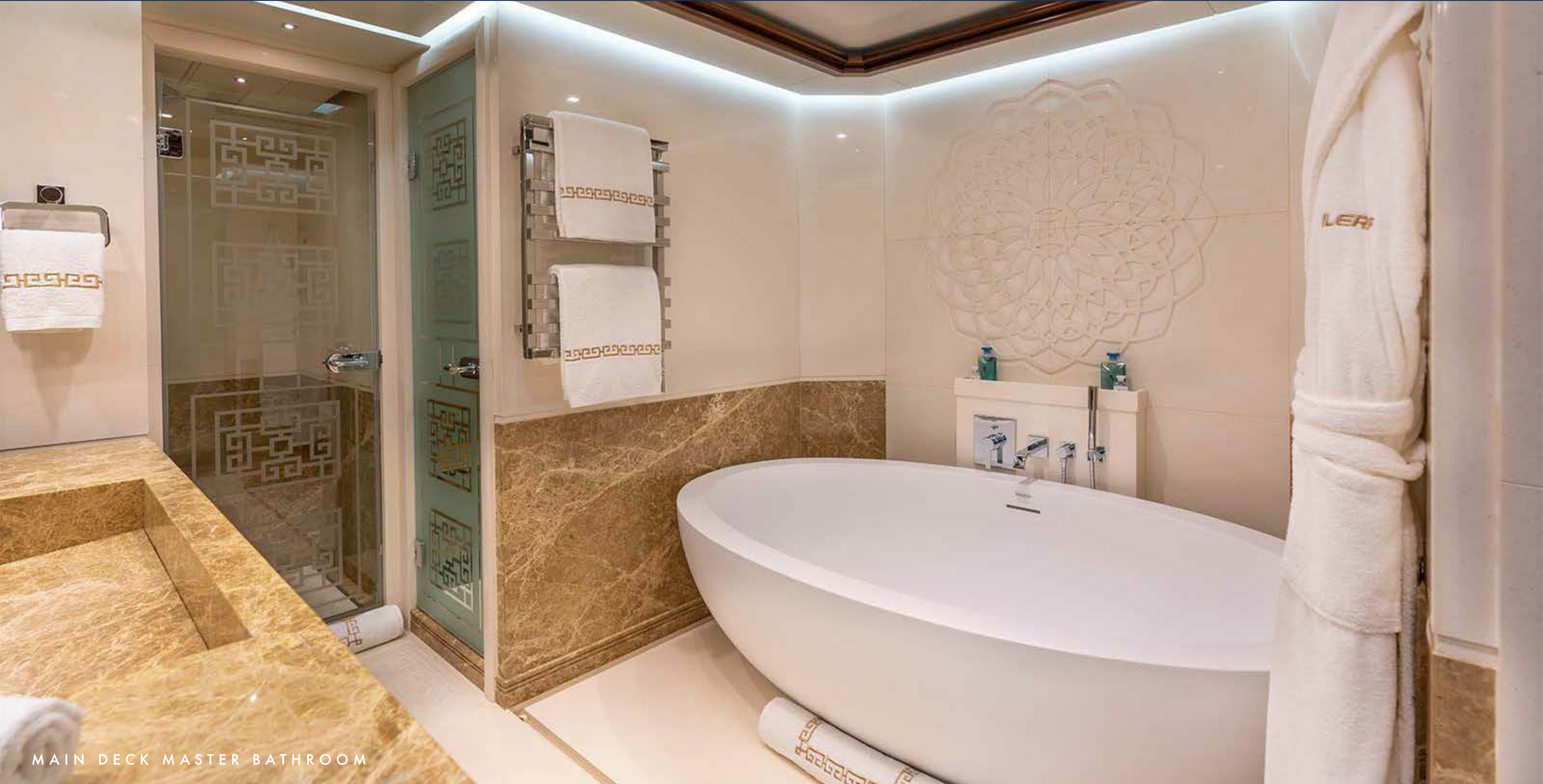
MAIN DECK MASTER BATHROOM