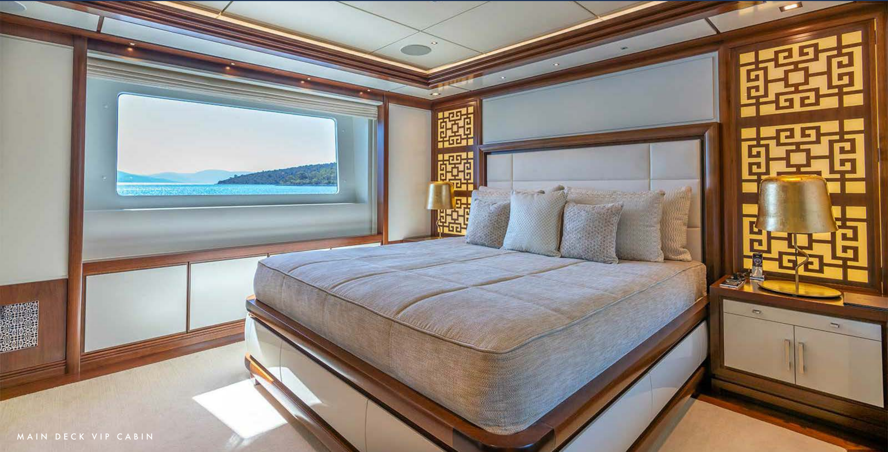
MAIN DECK VIP CABIN