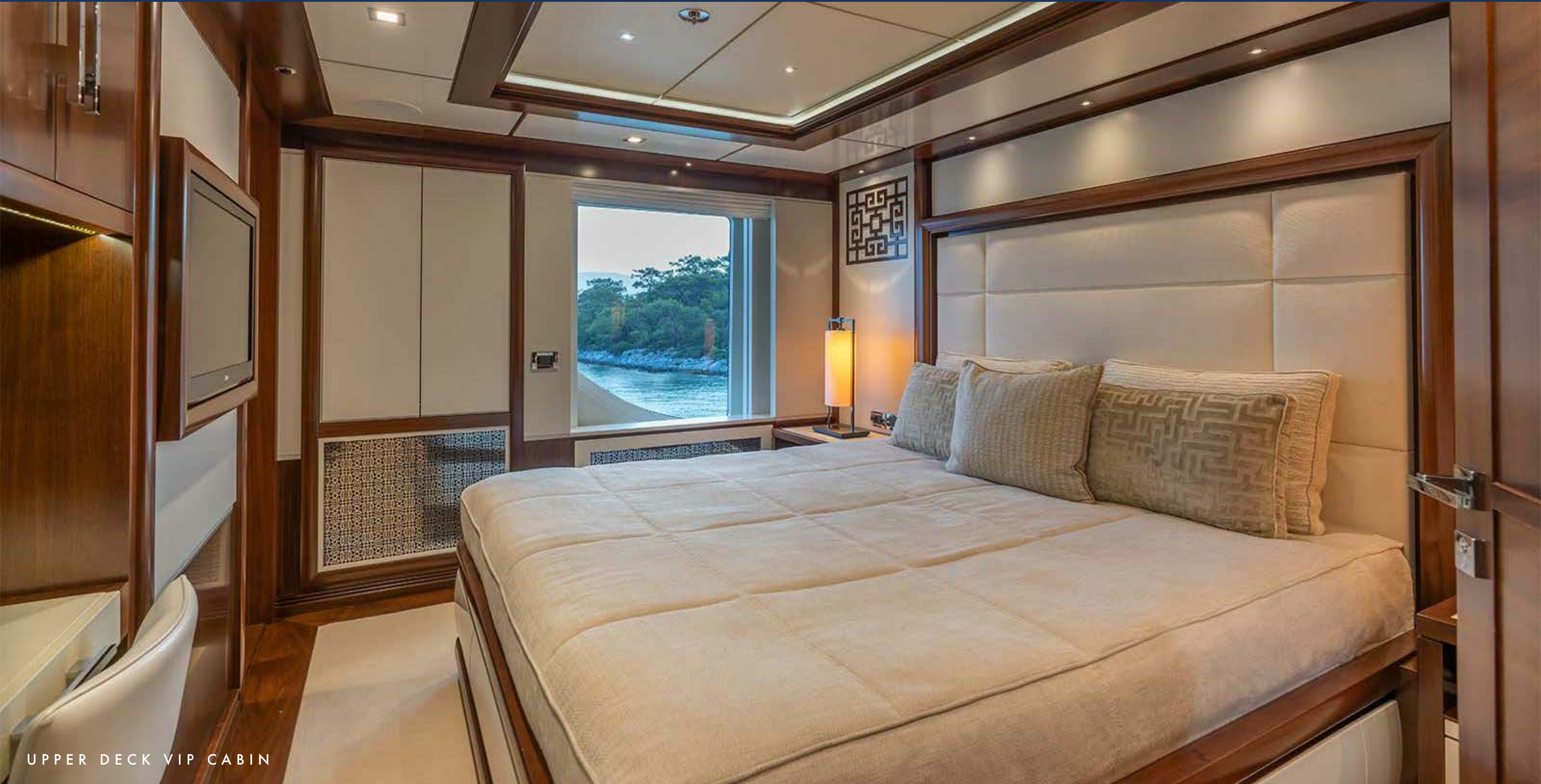
UPPER DECK VIP CABIN