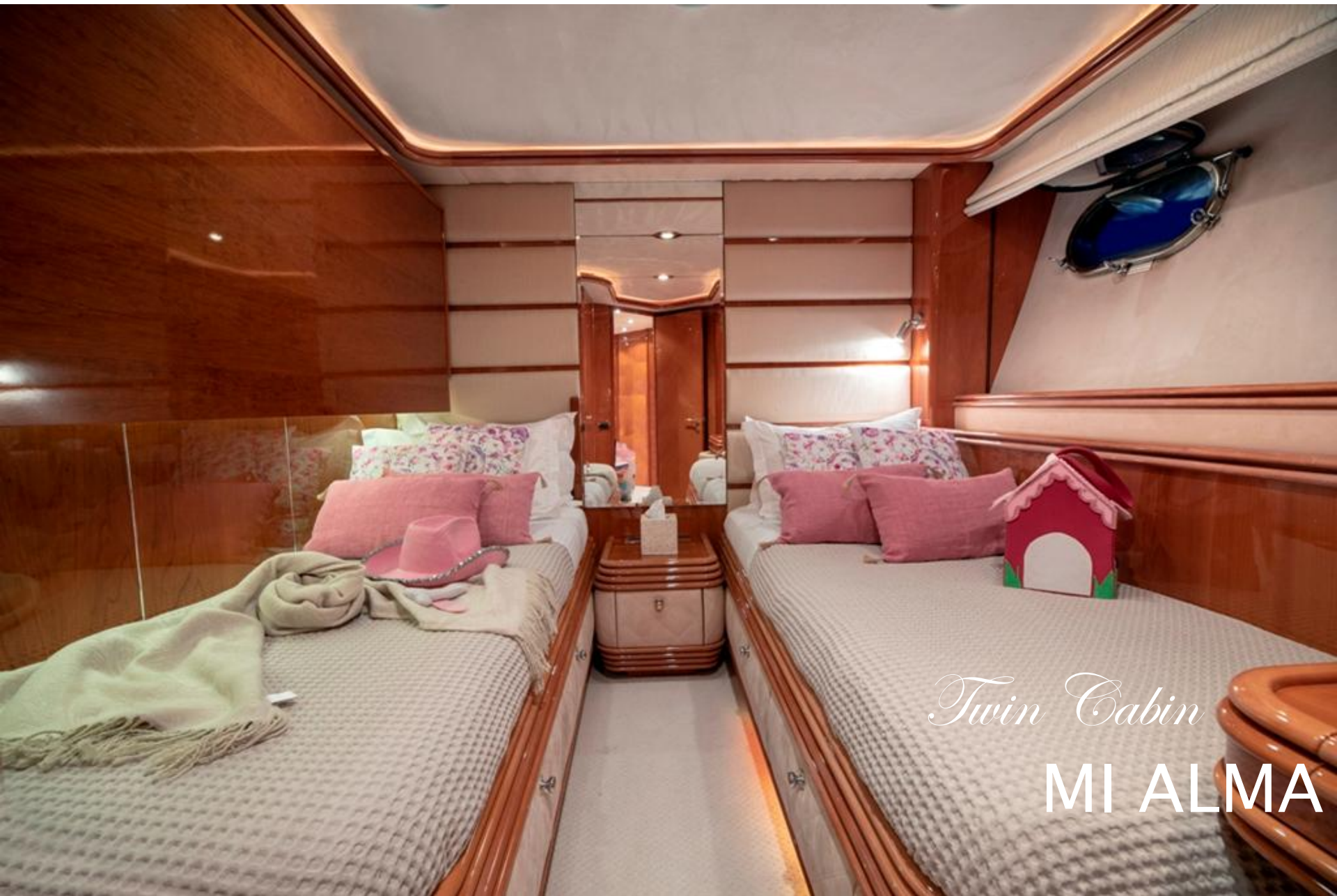
Twin Cabin MI ALMA