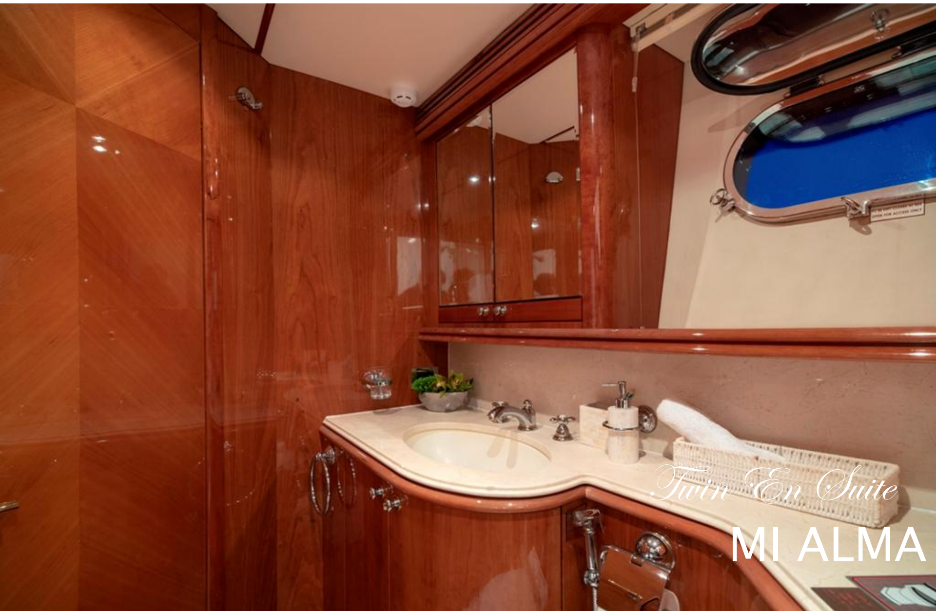
Twin En Suite MI ALMA