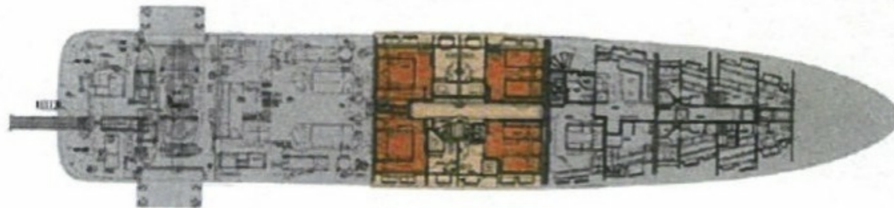
"B" Lower Deck Level