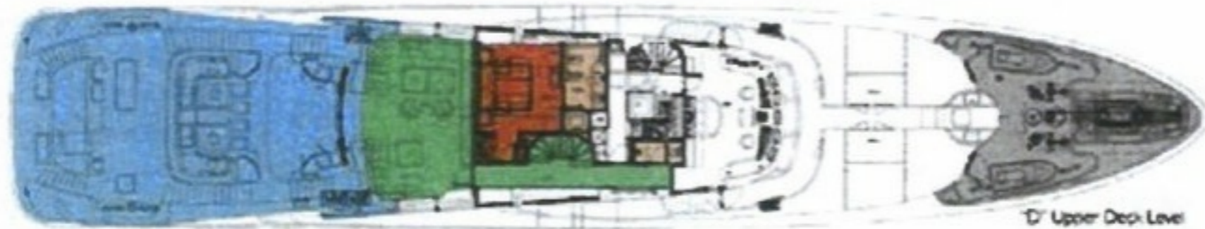
"D" Upper Deck Level