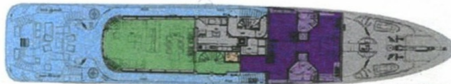
"C" Main Deck Level