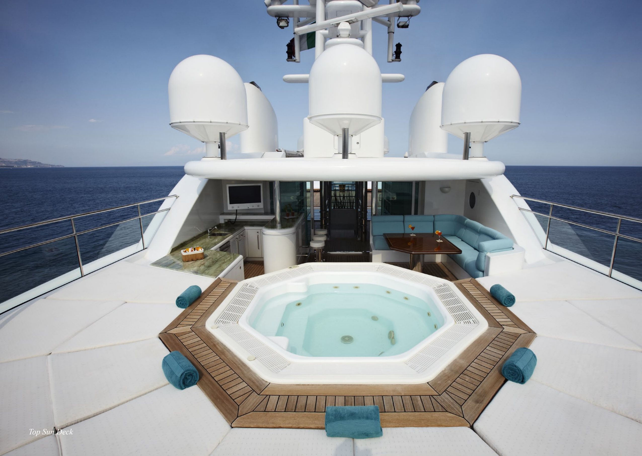
Top Sun Deck