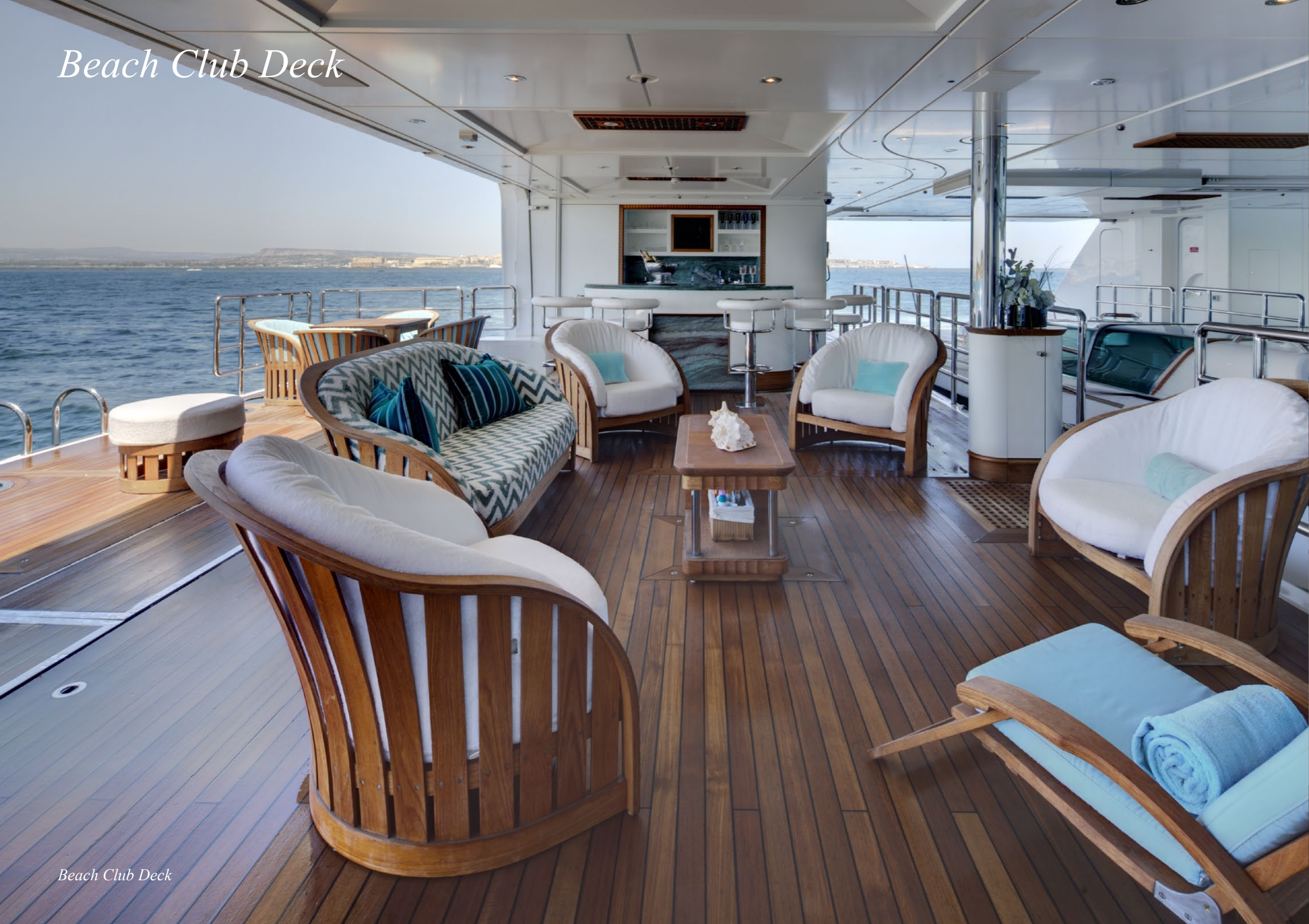
Beach Club Deck