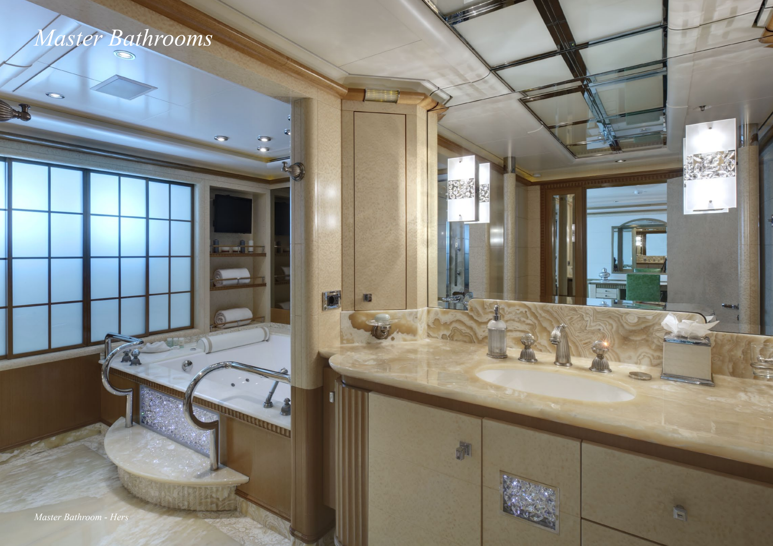
Master Bathroom - Hers