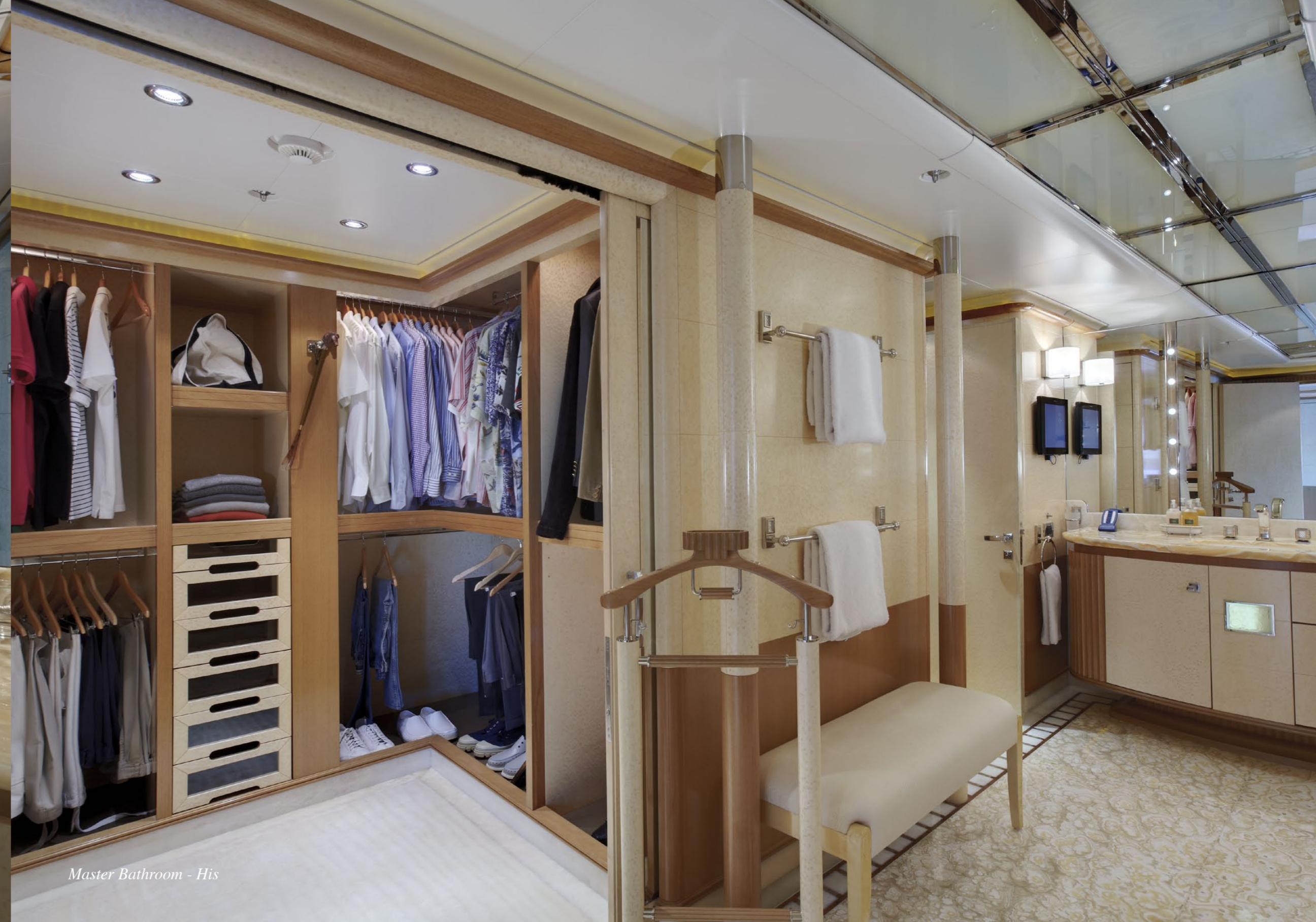
Master Bathroom - His