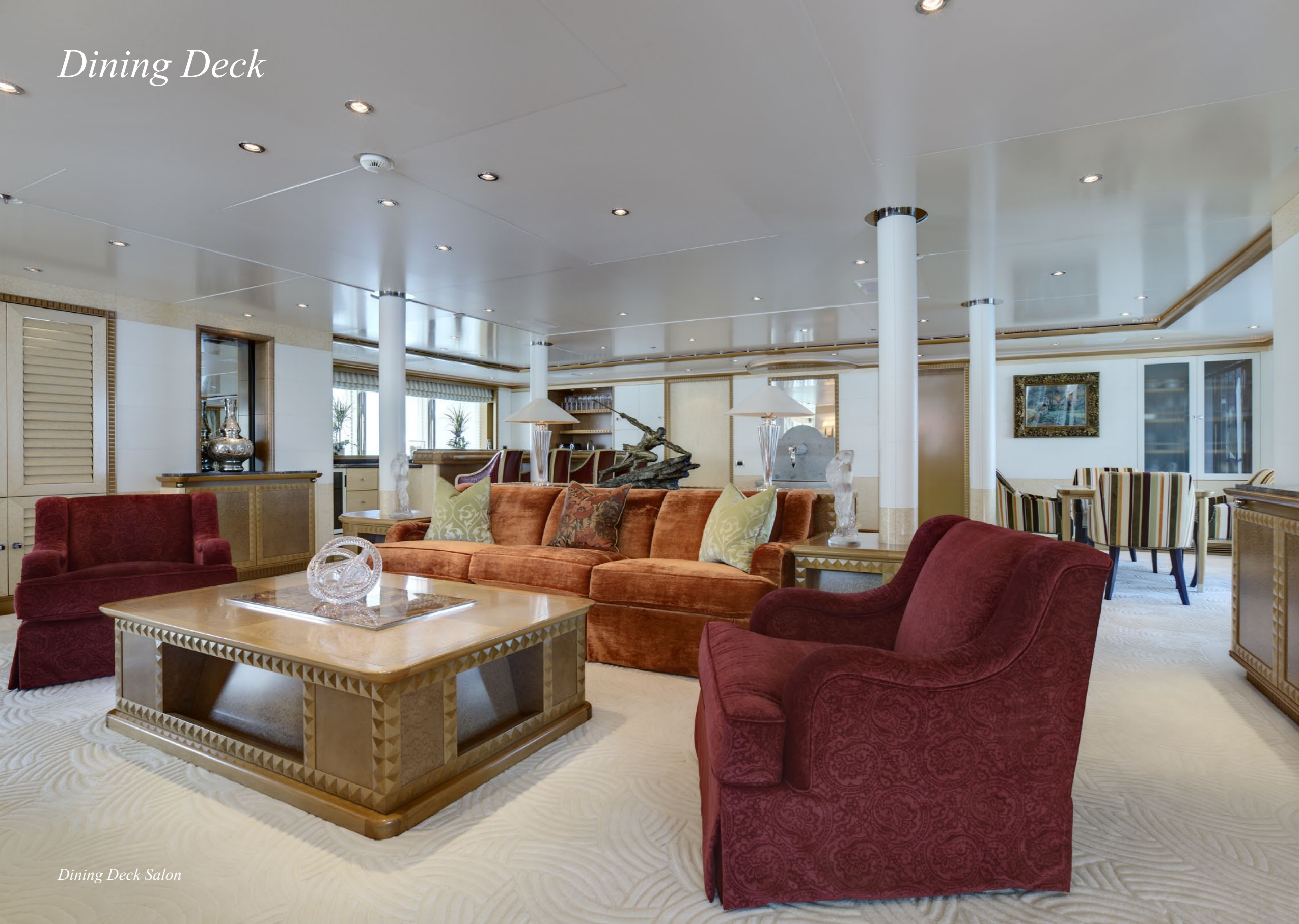
Dining Deck Salon