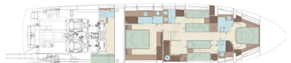
Pont inférieur - OPT