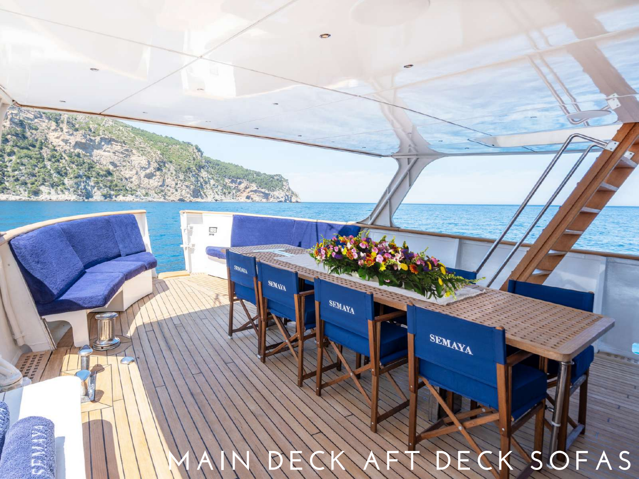
MAIN DECK AFT DECK SOFAS