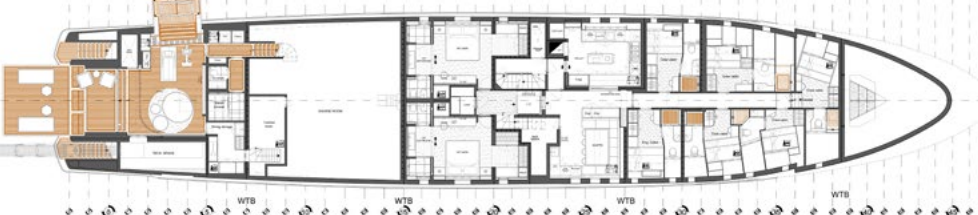
PONTE BOTTICOPERTA LOWER DECK