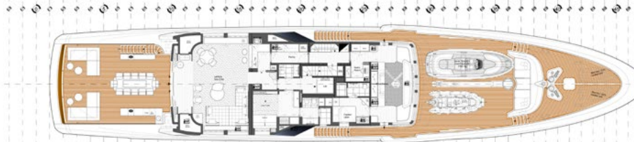
PONTE TRACERIA BRIDGE DECK