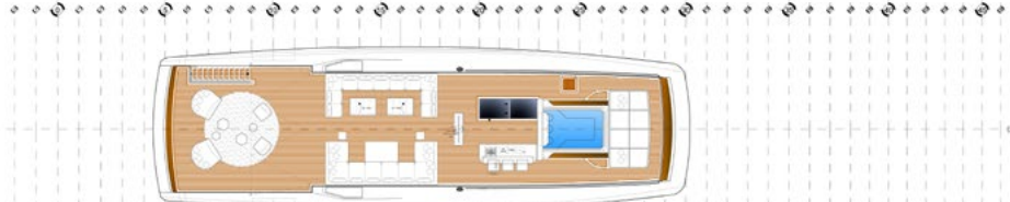
PONTE SOLE SUN DECK