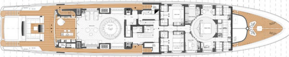
PONTE COPERTA MAIN DECK