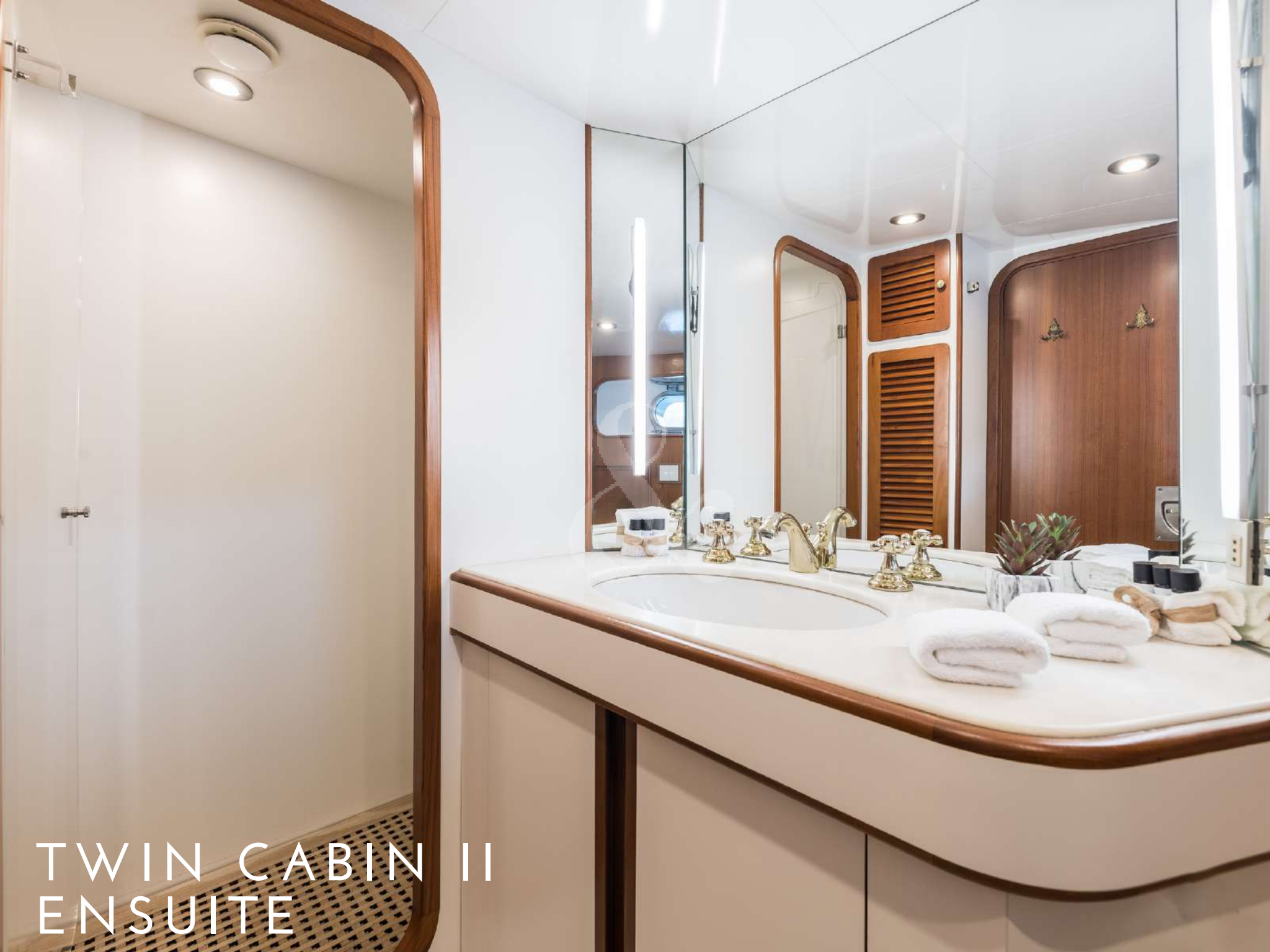
TWIN CABIN II ENSUITE