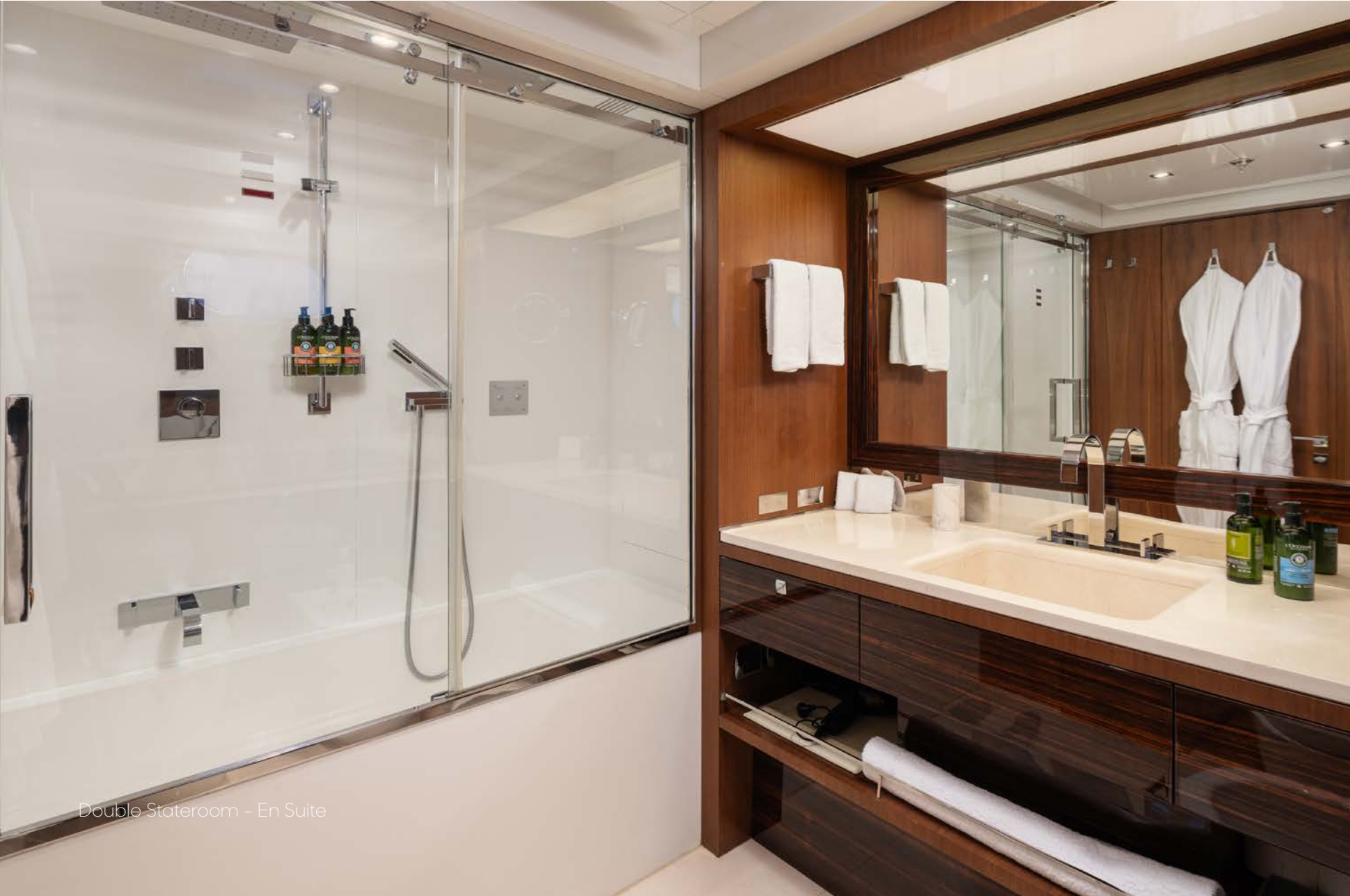
Double Stateroom - En Suite