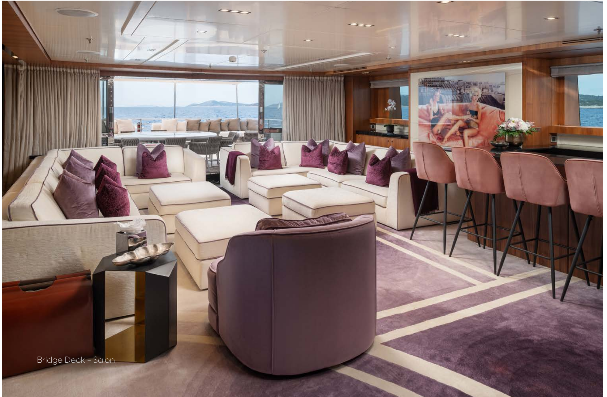
Bridge Deck - Salon