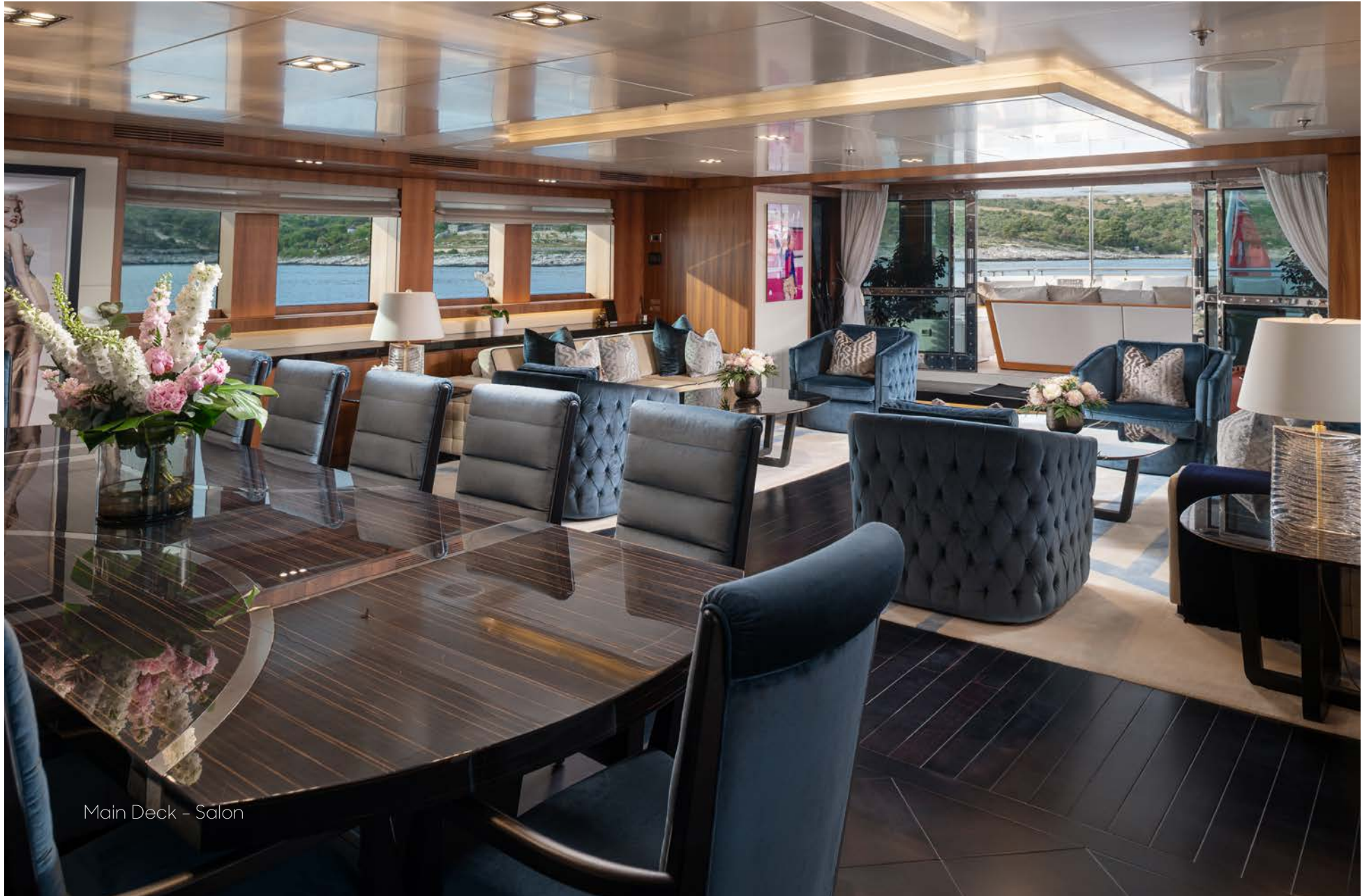
Main Deck - Salon