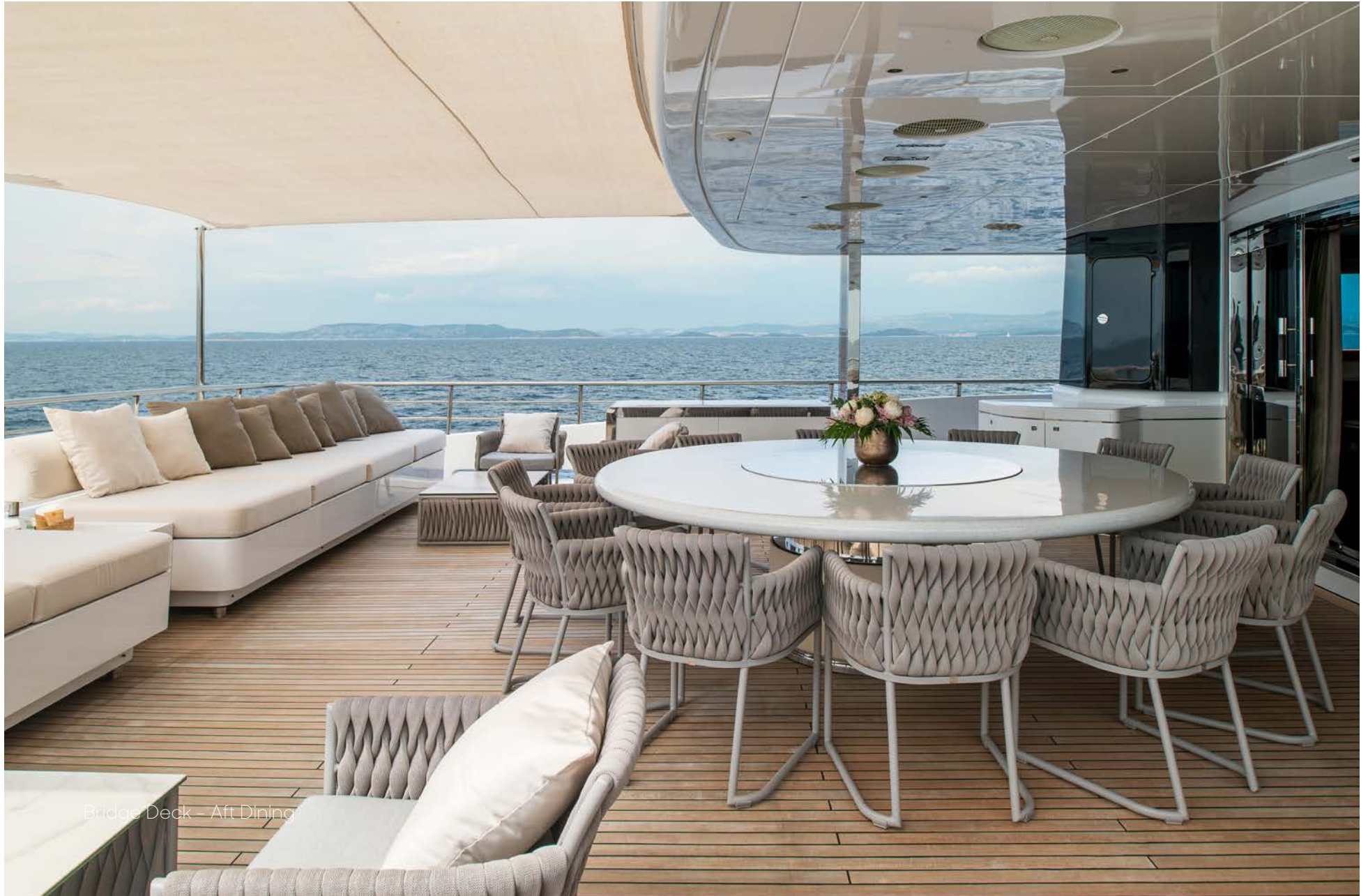
Bridge Deck - Aft Dining