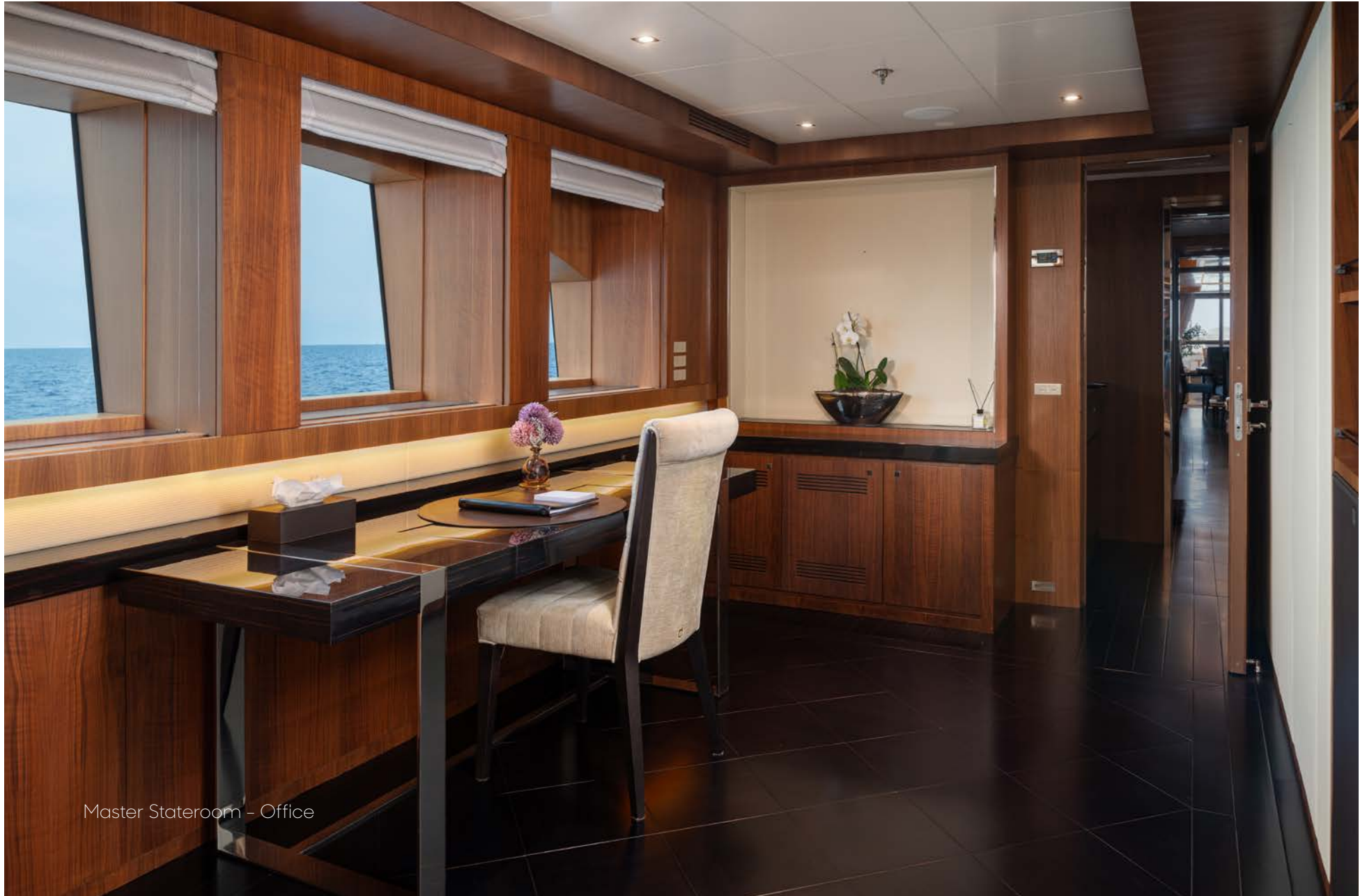
Master Stateroom - Office