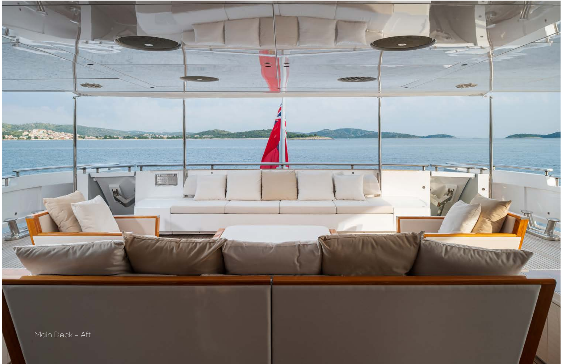
Main Deck - Aft