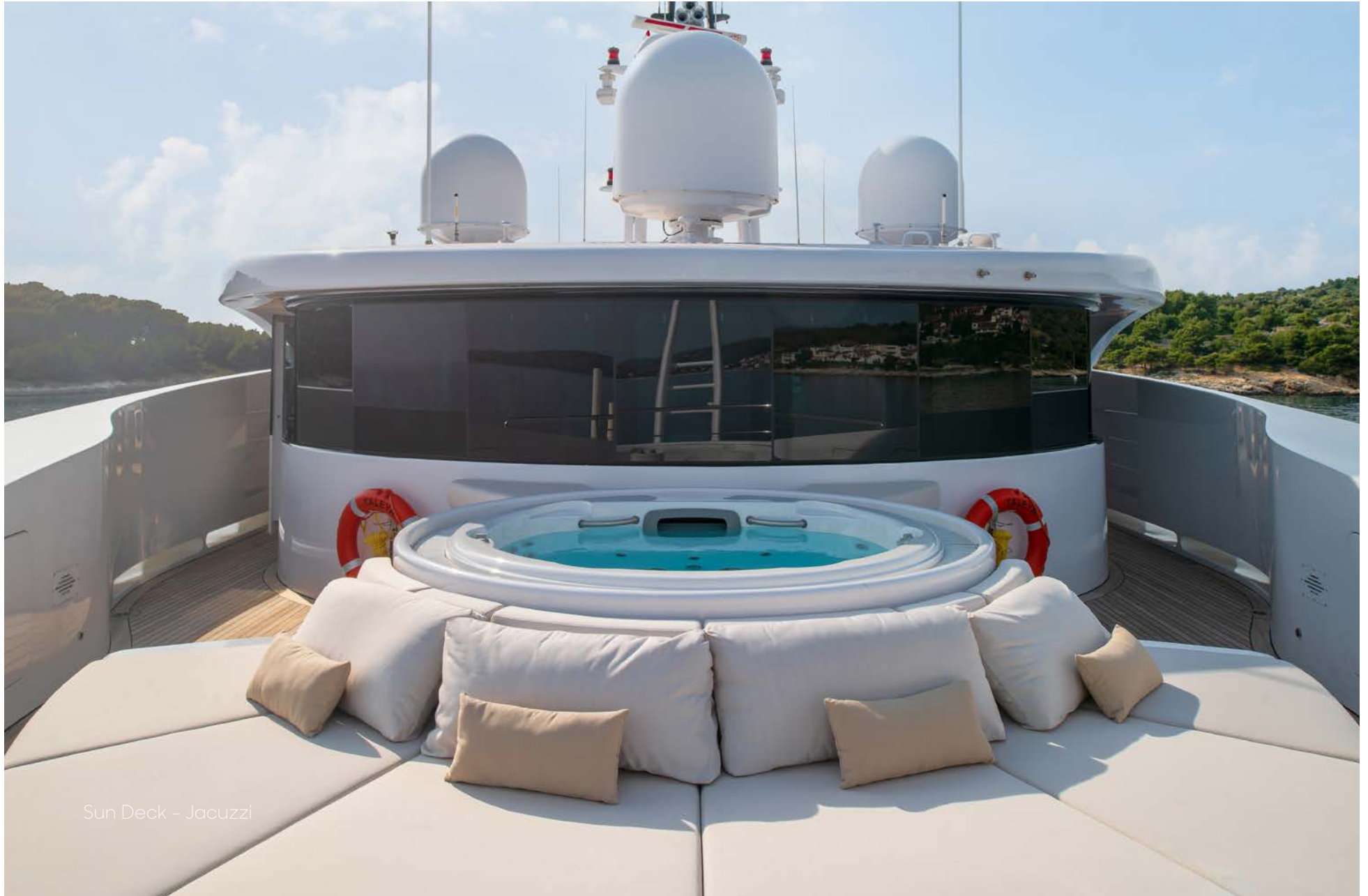
Sun Deck - Jacuzzi