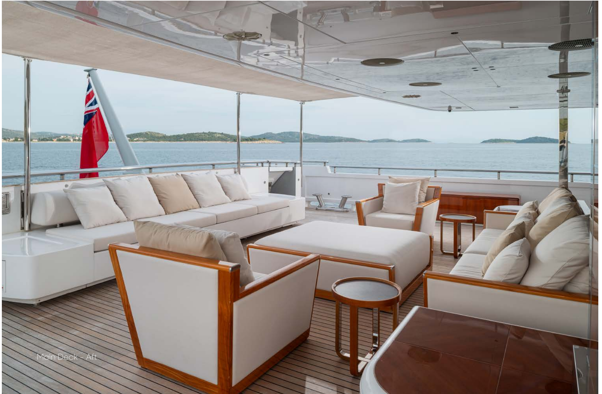
Main Deck - Aft