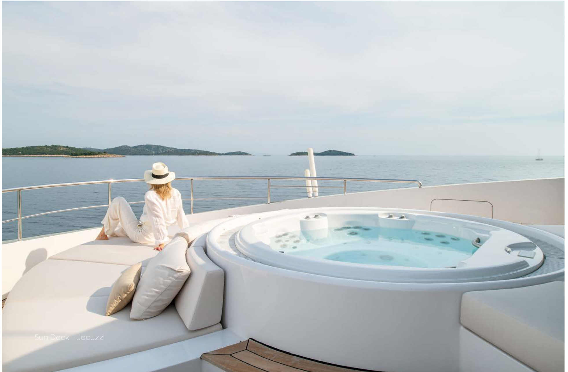
Sun Deck - Jacuzzi