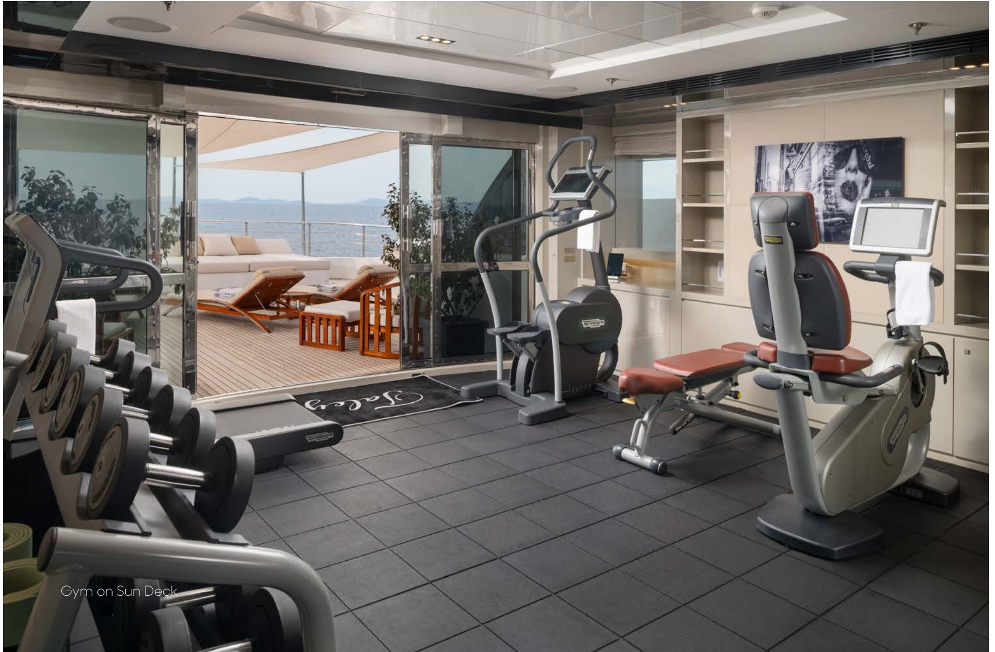
Gym on Sun Deck