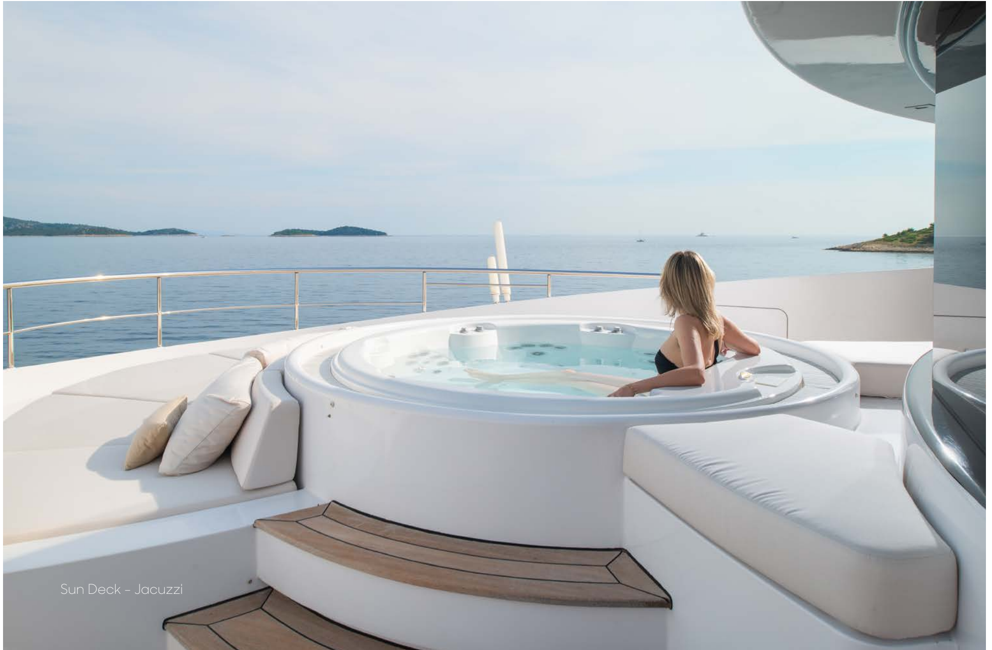
Sun Deck - Jacuzzi