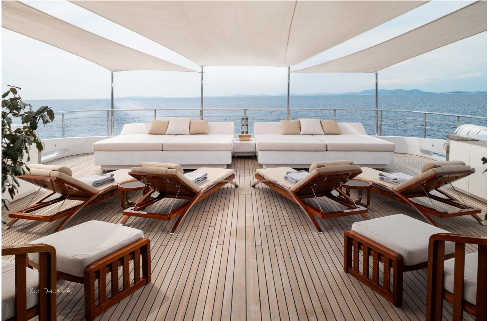
Sun Deck – Aft