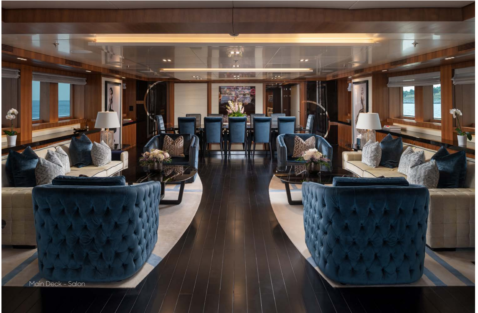
Main Deck - Salon