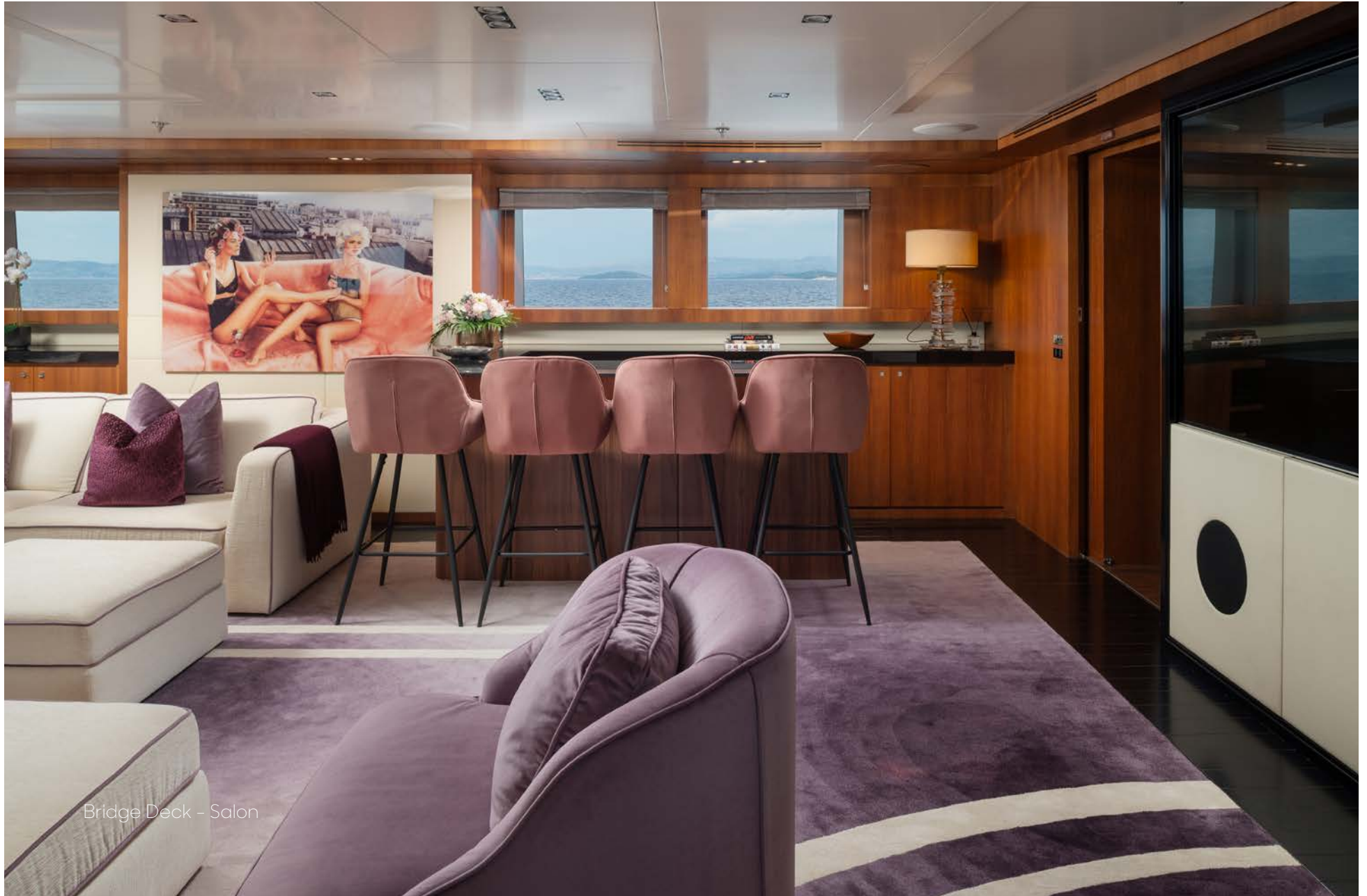
Bridge Deck - Salon