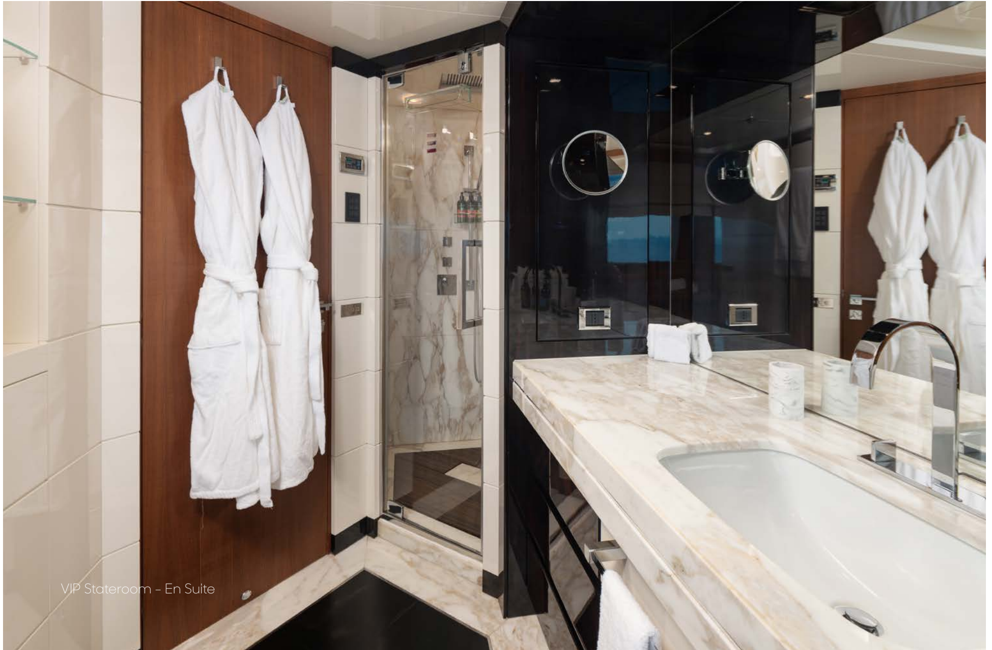
VIP Stateroom - En Suite