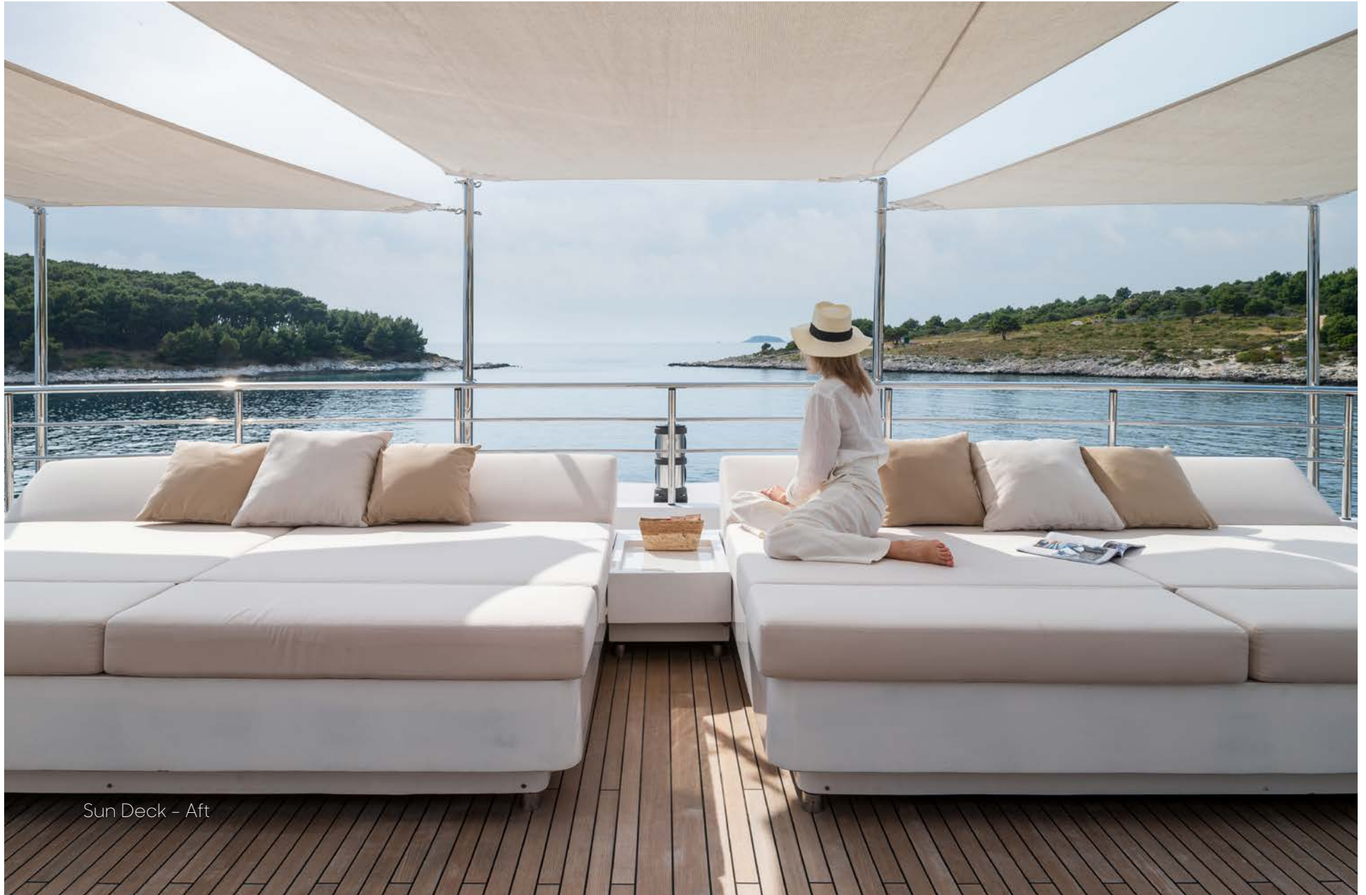
Sun Deck - Aft