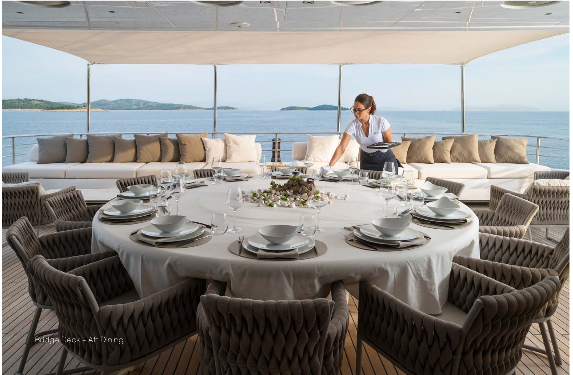
Bridge Deck - Aft Dining