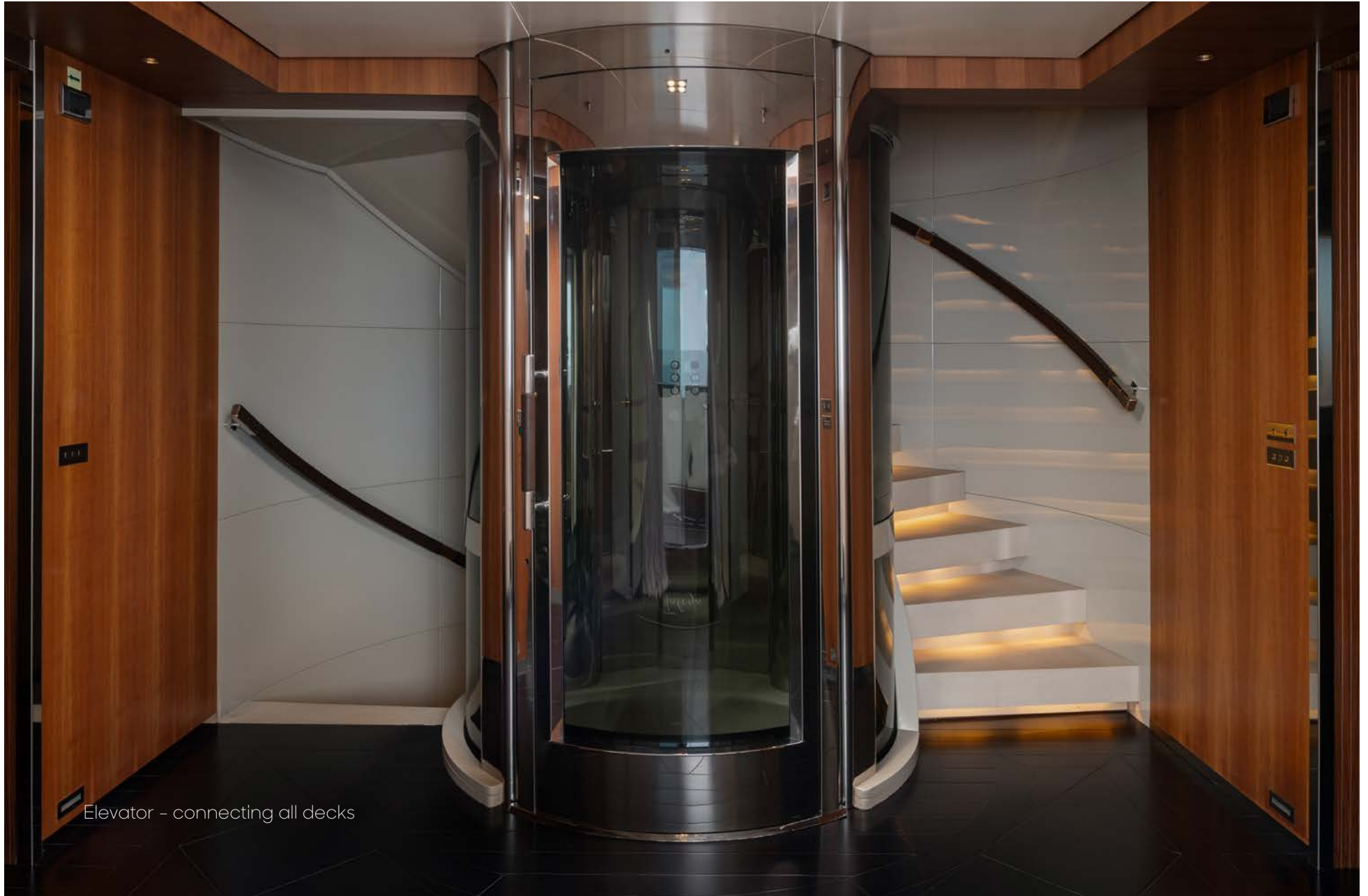
Elevator - connecting all decks