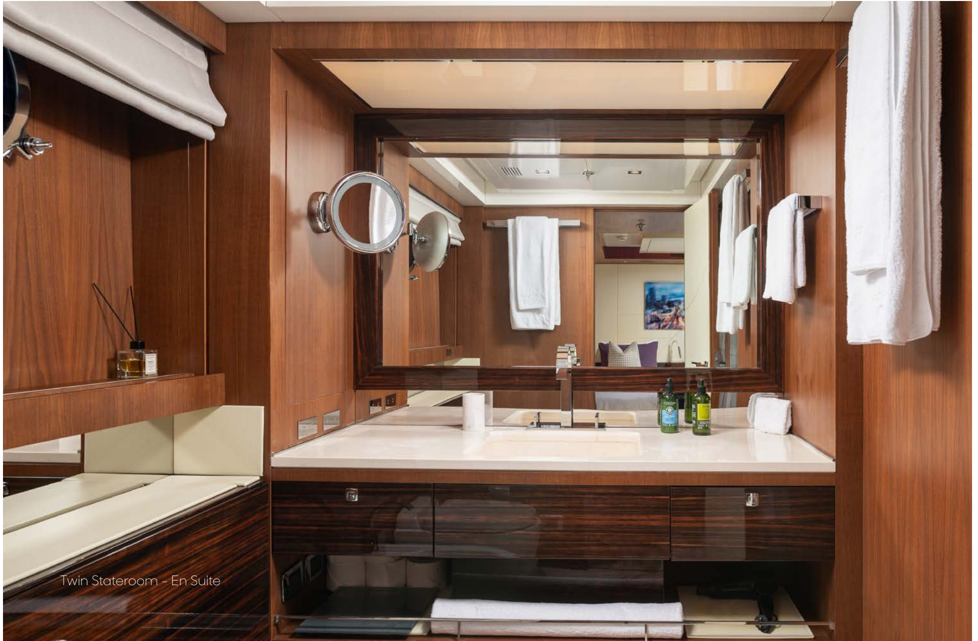
Twin Stateroom - En Suite