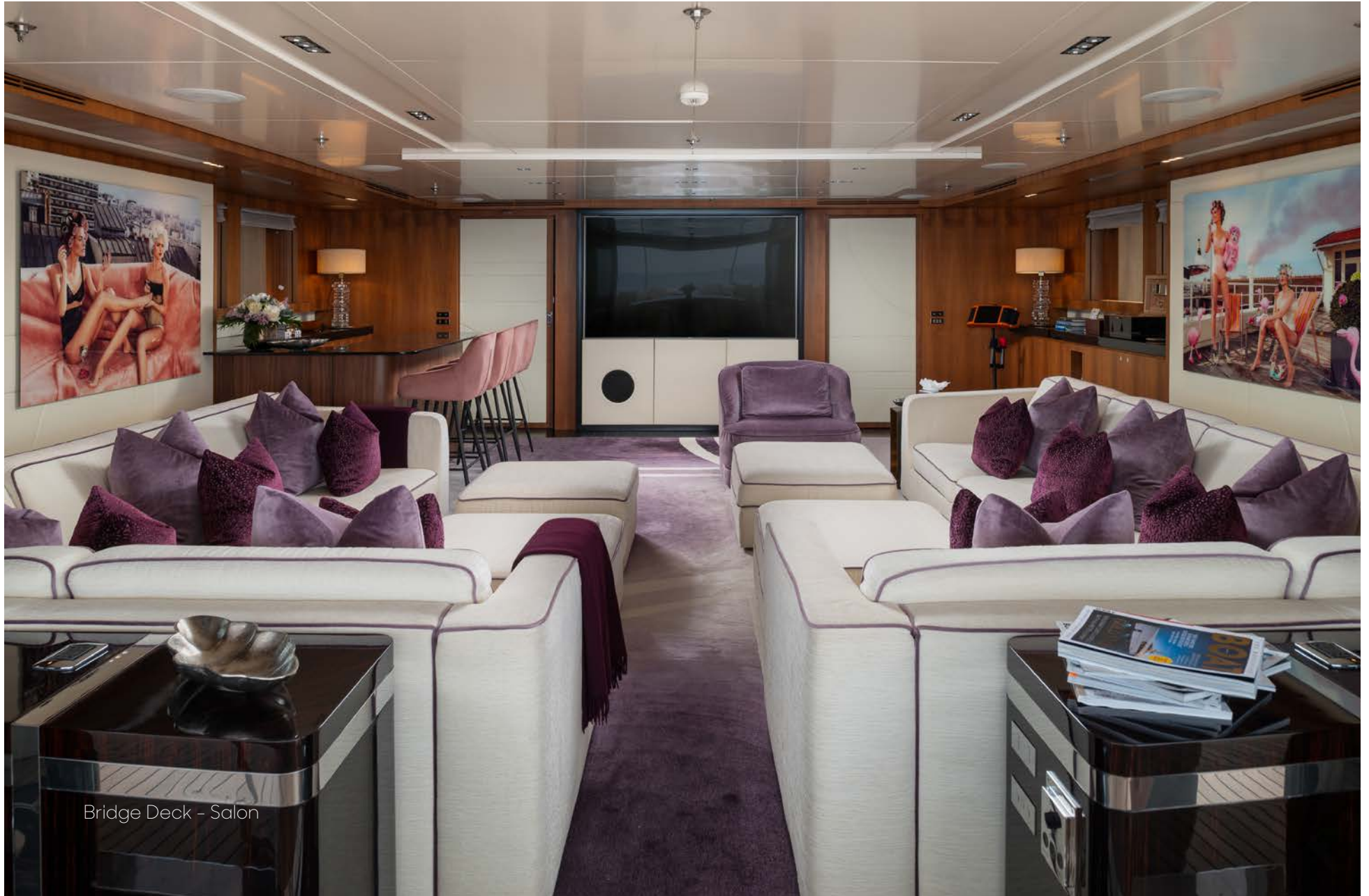
Bridge Deck - Salon