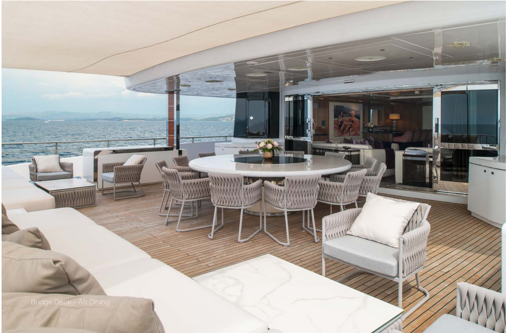
Bridge Deck - Aft Dining