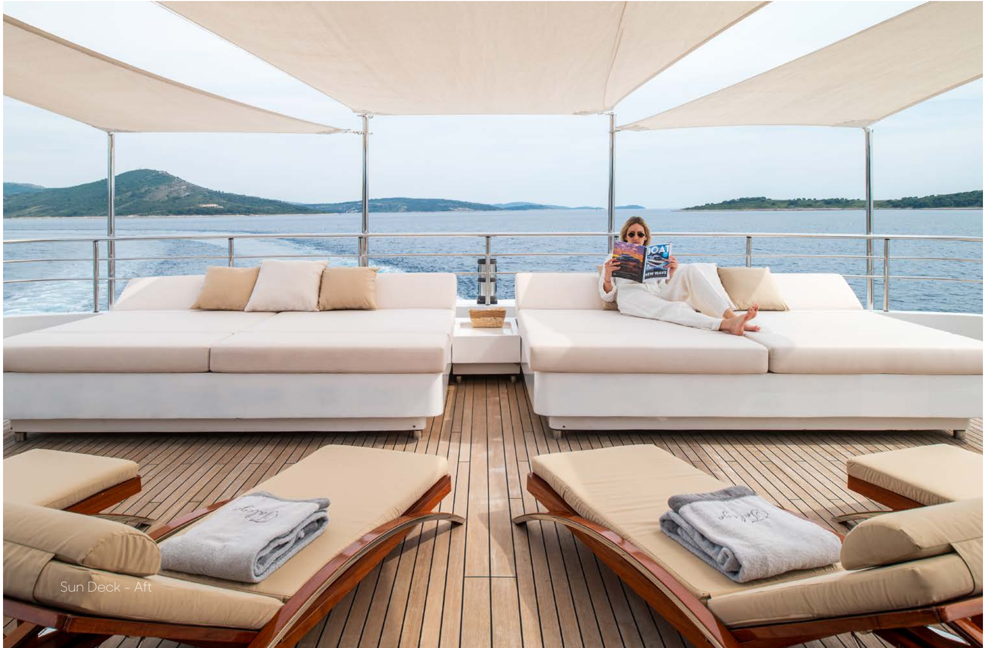
Sun Deck - Aft