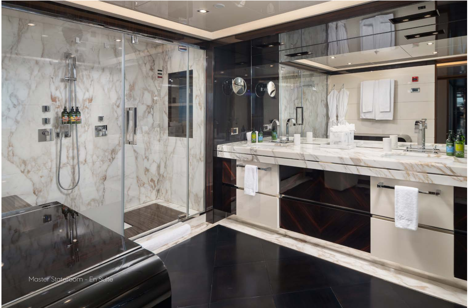
Master Stateroom - En Suite