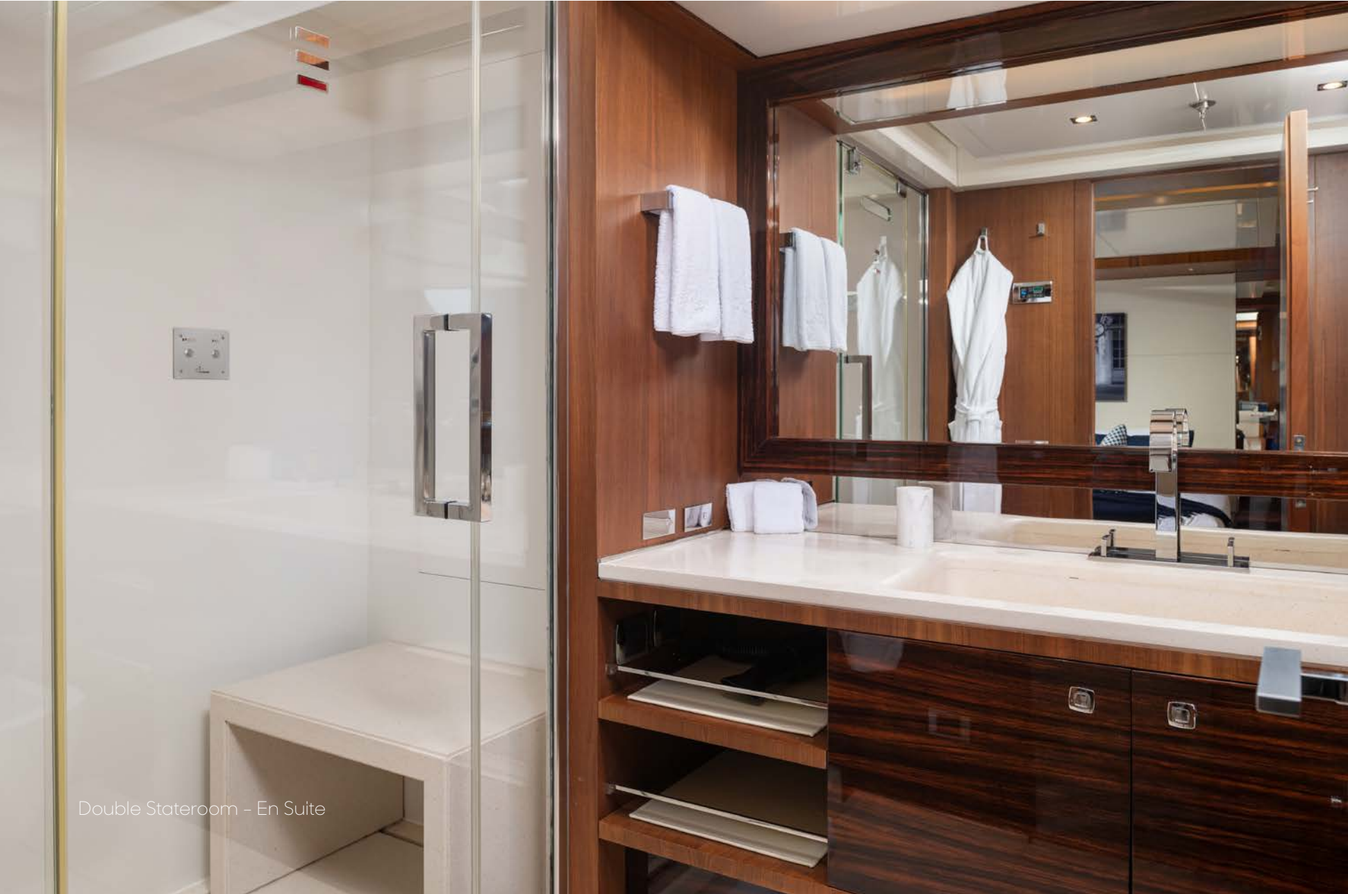
Double Stateroom - En Suite