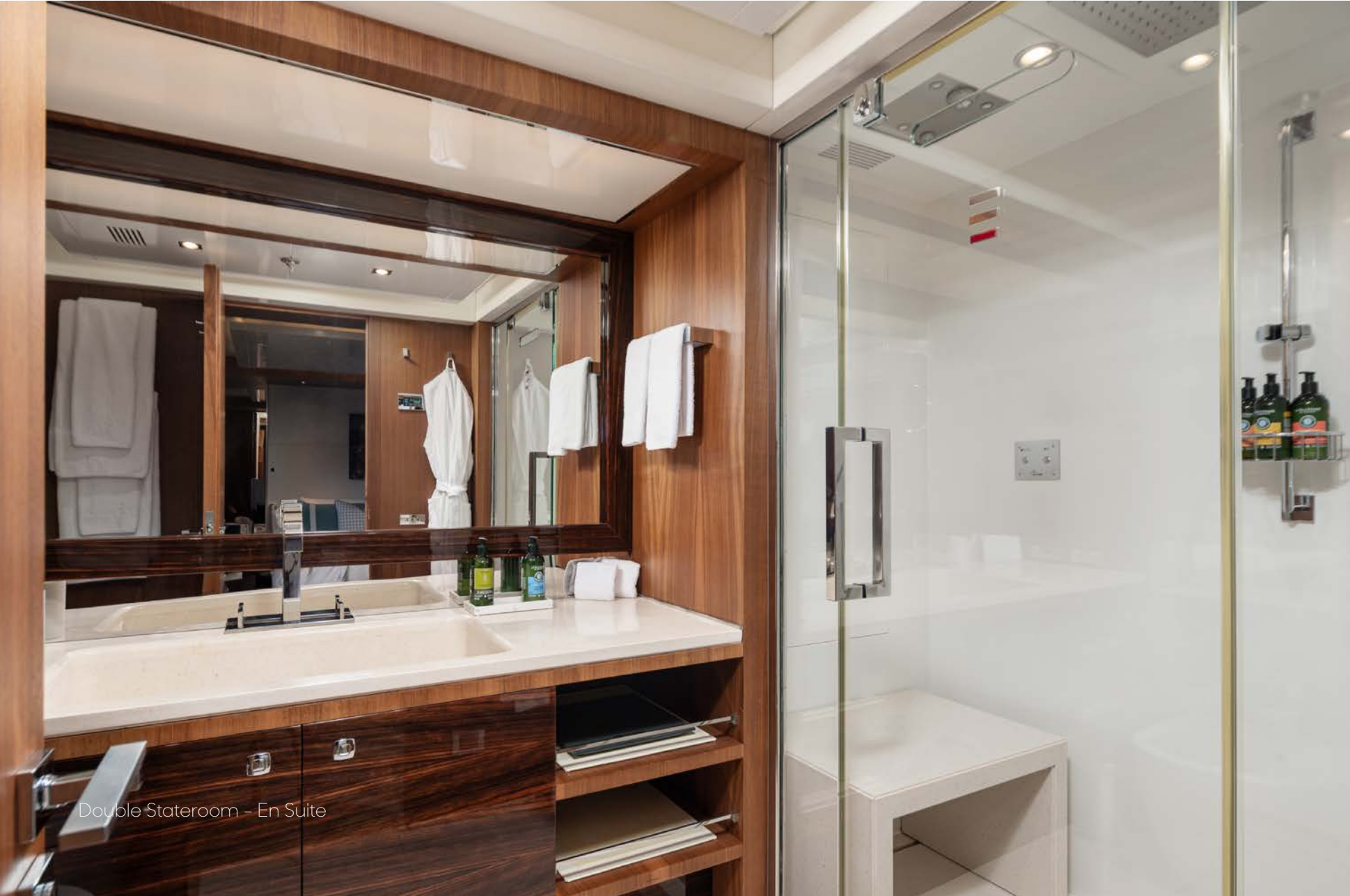
Double Stateroom - En Suite