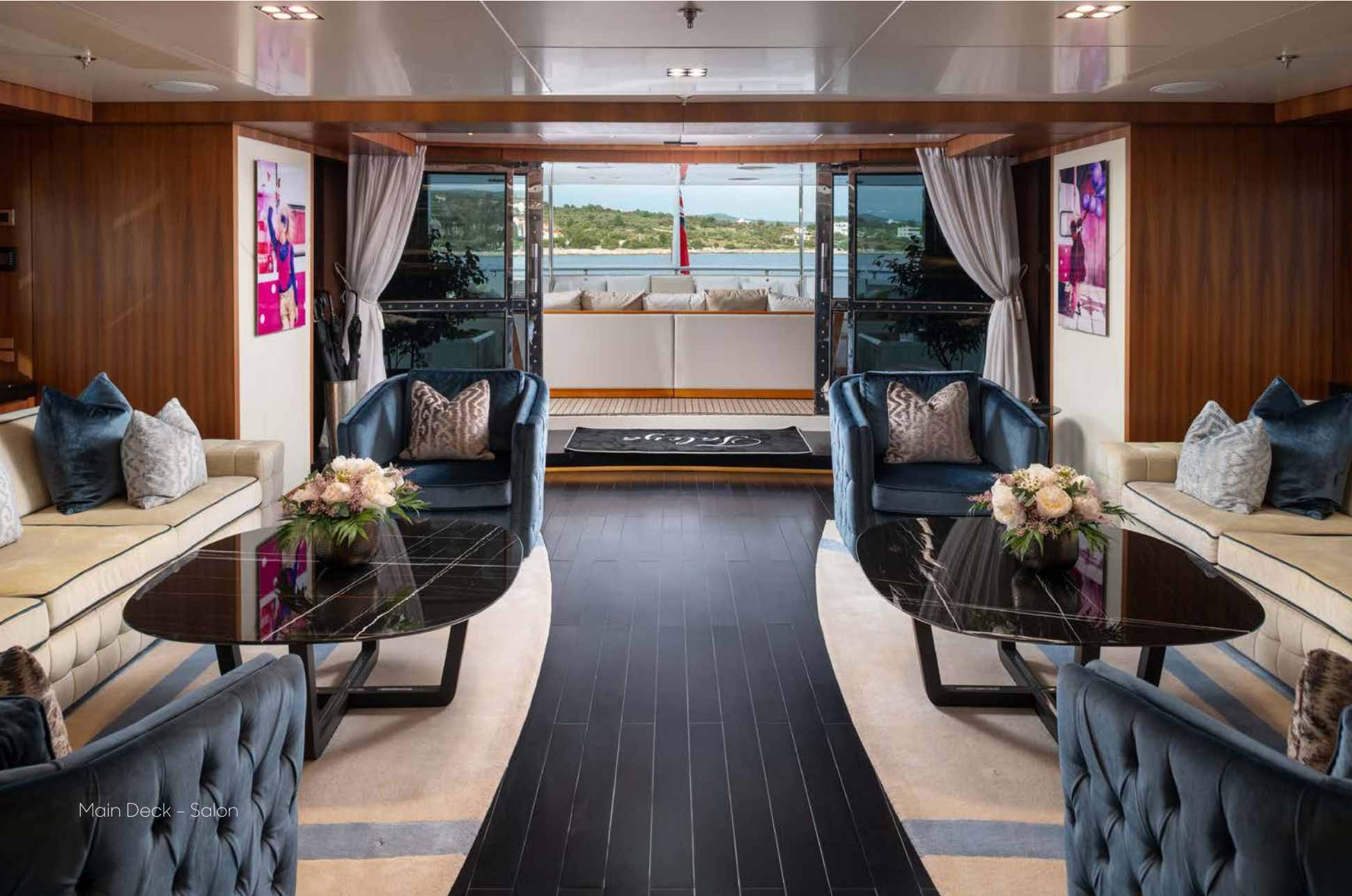
Main Deck - Salon