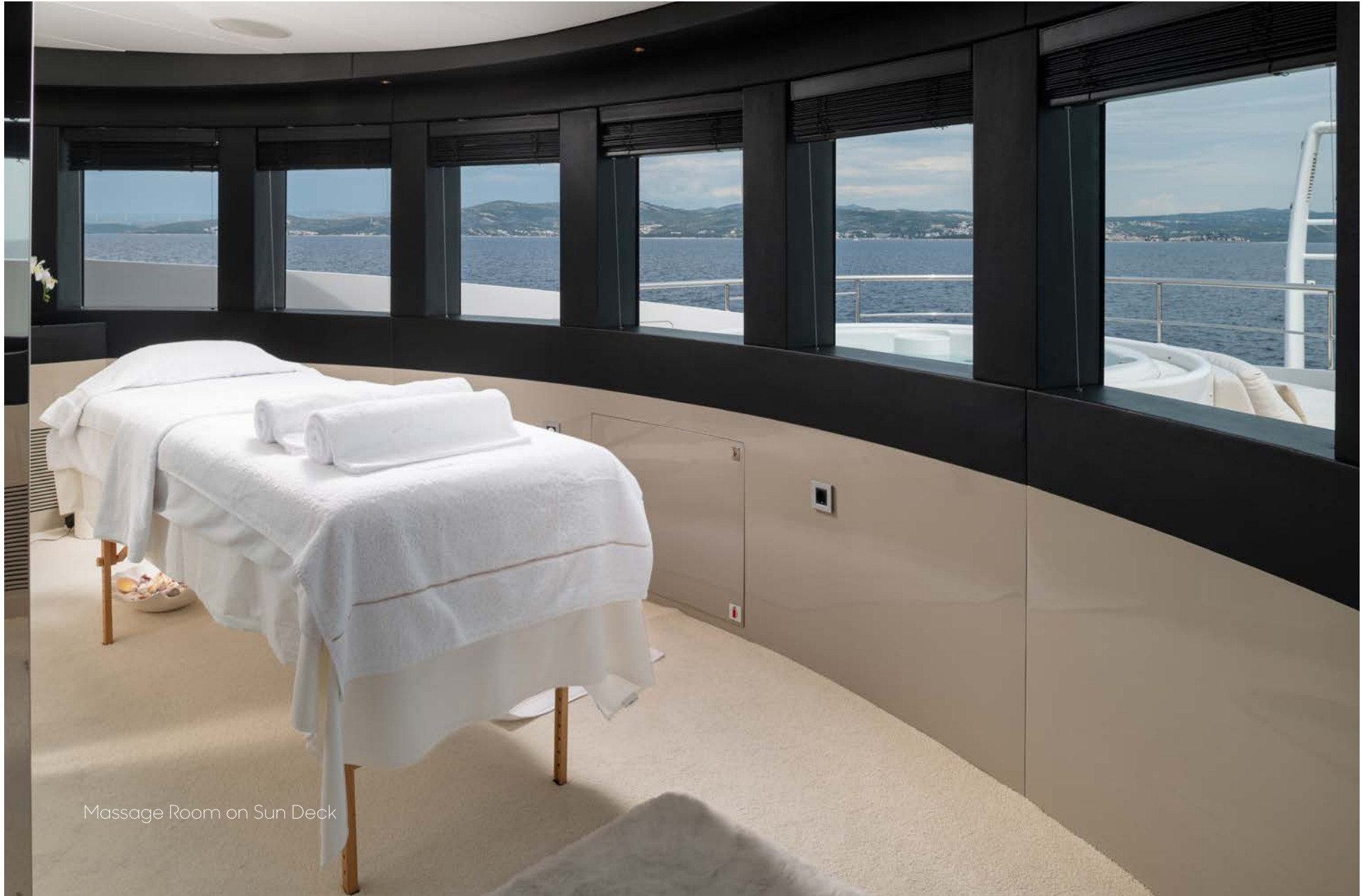
Massage Room on Sun Deck