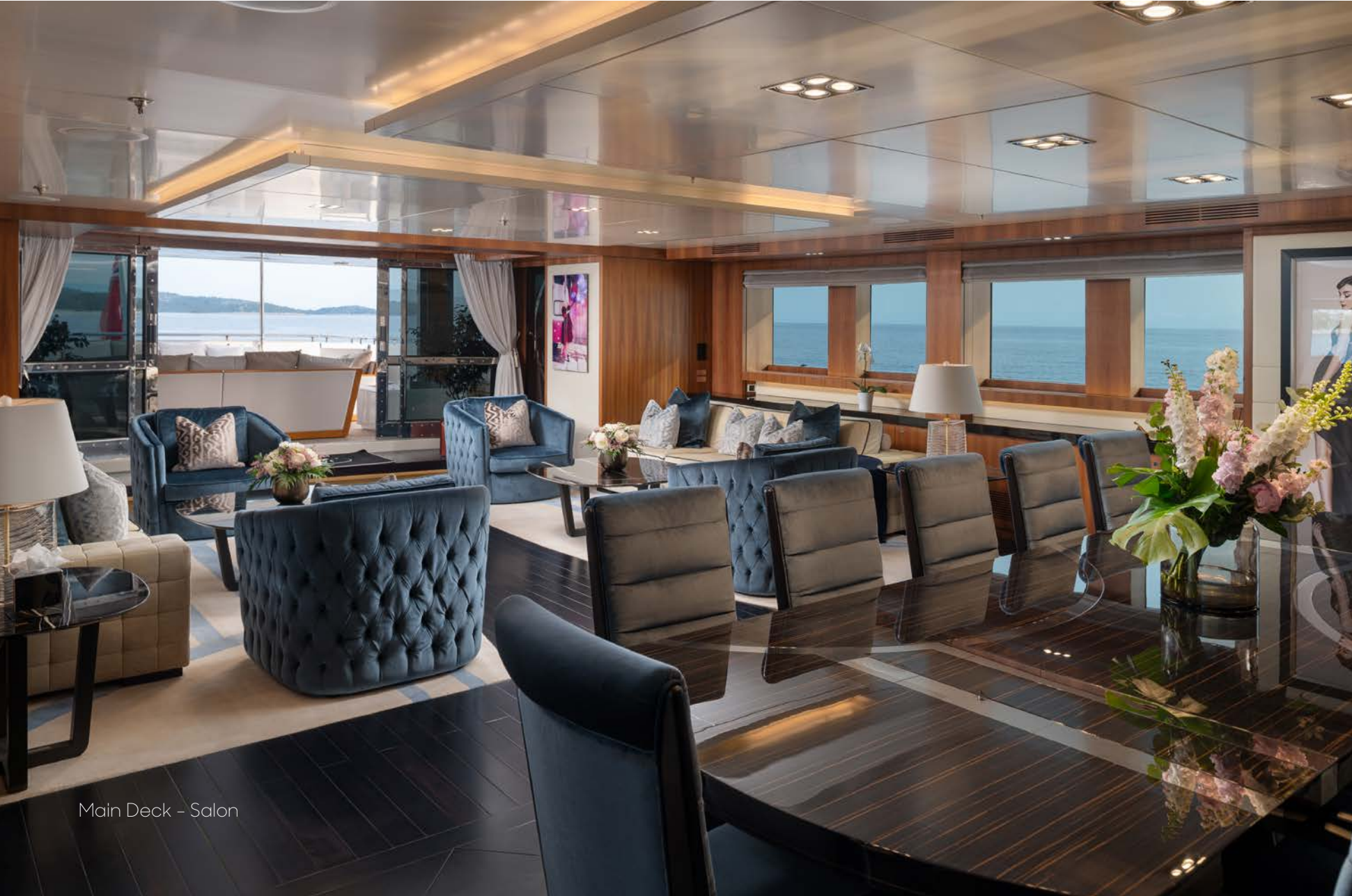
Main Deck - Salon