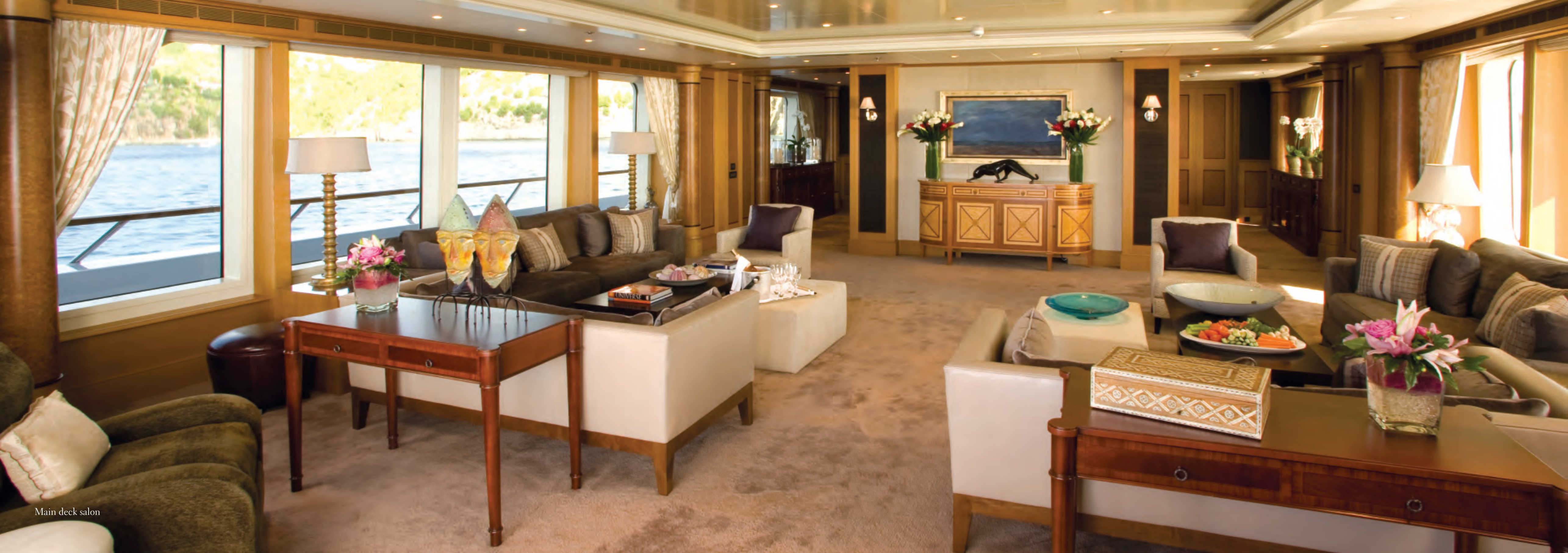
Main deck salon