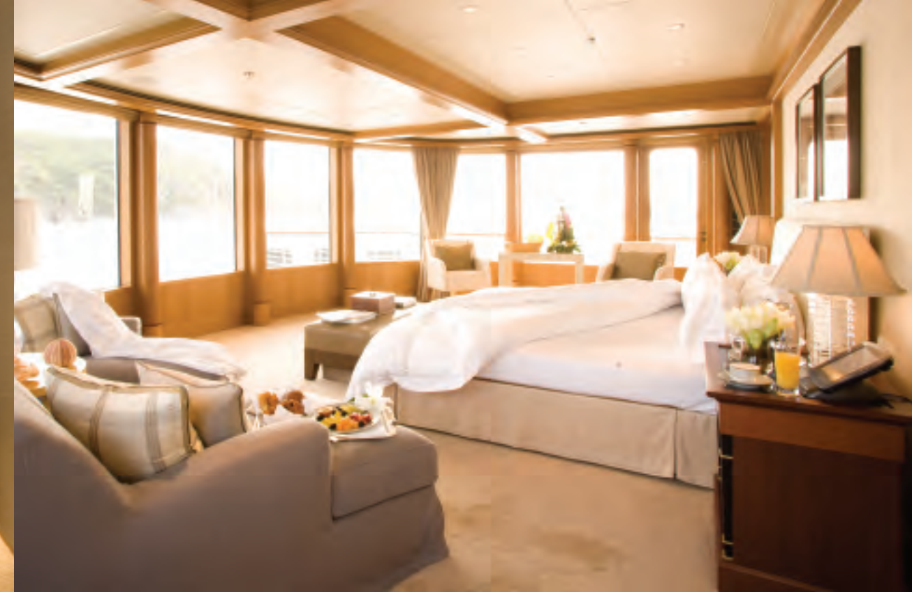
From sunrise to starry night, the owner's bedroom is transformed by views through 270° windows.