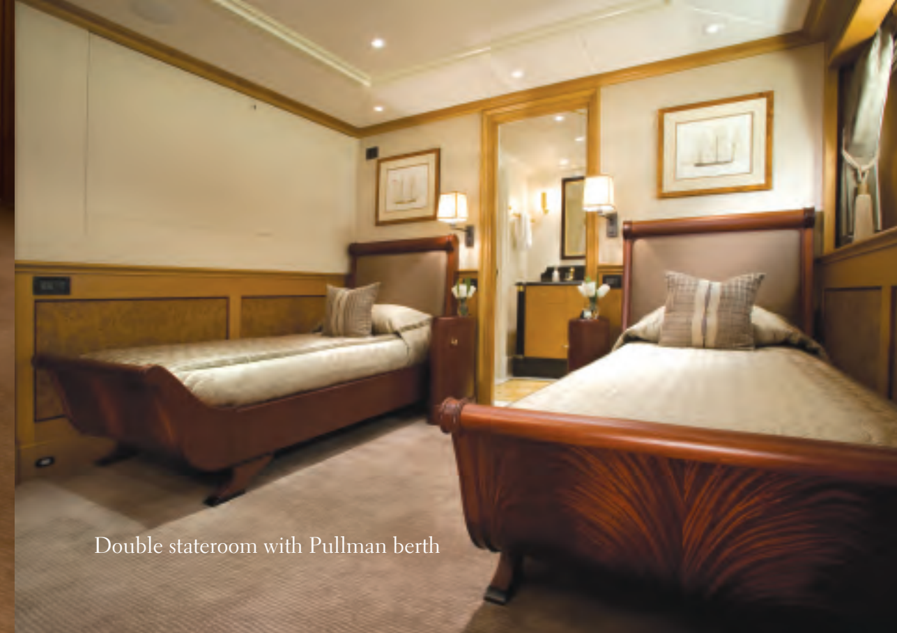
Double stateroom with Pullman berth