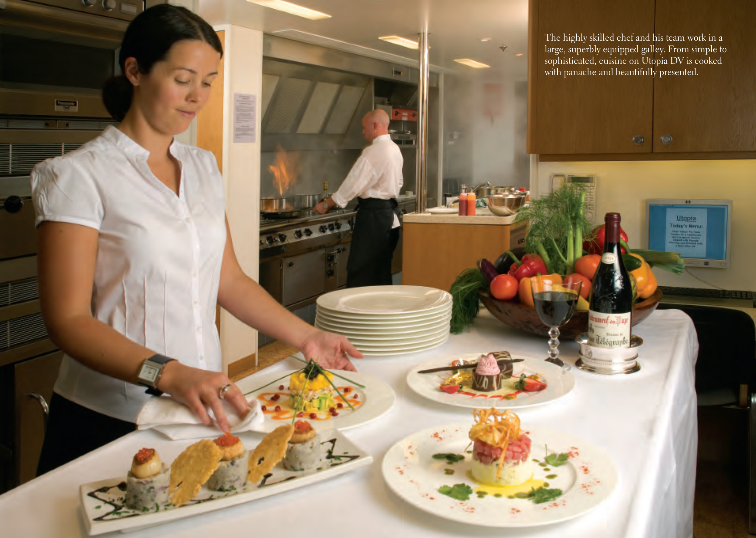
The highly skilled chef and his team work in a large, superbly equipped galley. From simple to sophisticated, cuisine on Utopia DV is cooked with panache and beautifully presented.