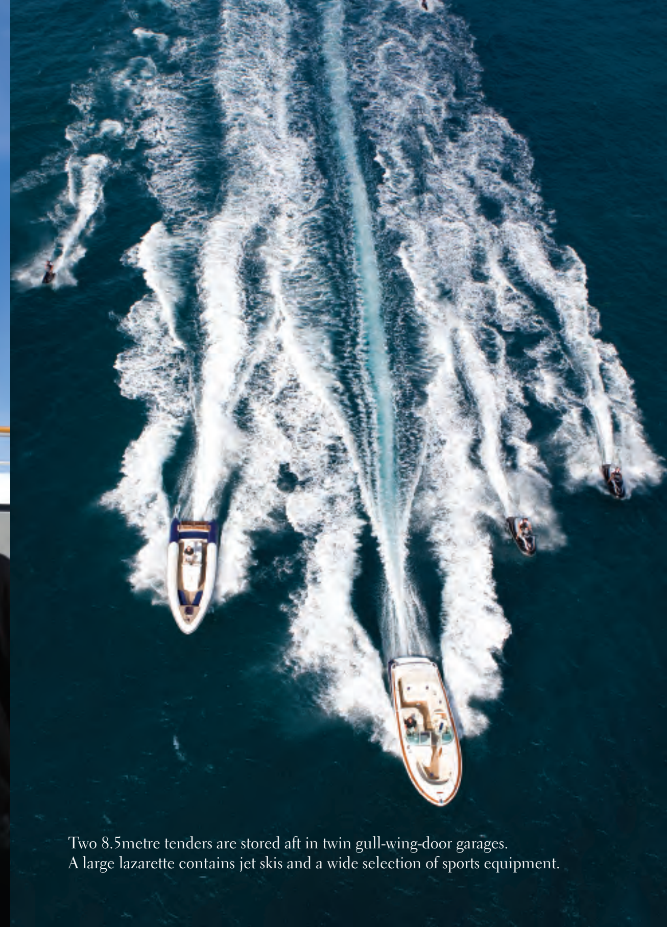
Two 8.5-metre tenders are stored aft in twin gull-wing-door garages. A large lazarette contains jet skis and a wide selection of sports equipment.